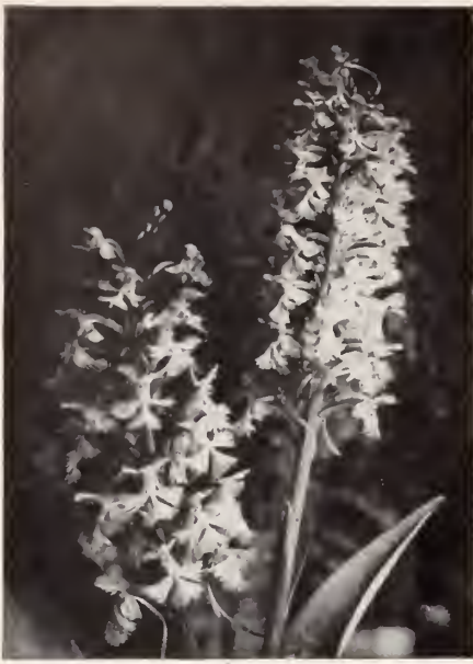
PURPLE FRINGE ORCHID