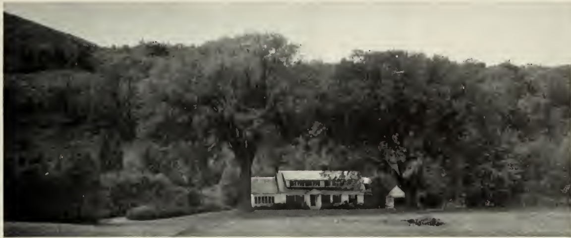
A VERMONT HOME WITH AMERICAN ELMS