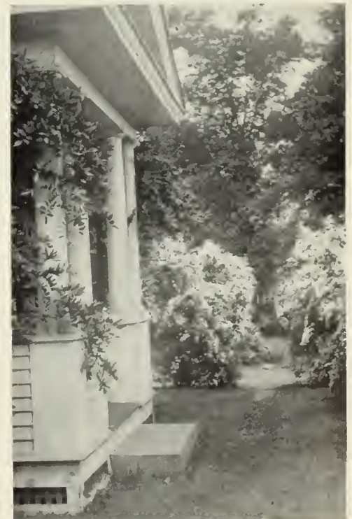
SPIREA VAN HOUTTEI

GREAT LAUREL, Rhododendron Moximum. This is the most northern species growing wild in northern New England, although, as a matter of fact, the Catawba seems able to withstand greater extremes of temperature. Maximum apparently should be grown in shade for best results. Blossoms, in July, are white tinged with pink. 15-18 in. B & B $2.50 each, $21.00 per 10; 18-24 in. B & B $3.00 each, $26.00 per 10. 2-2½ ft. B & B $3.50 each, $32.50 per 10.