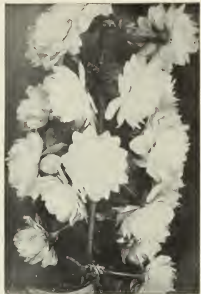
PRUNUS TRILOBA—DOUBLE FLOWERING PLUM

RUBUS ODORATUS. A true raspberry, with large purple flowers two inches across, which are borne through July and August, and the edible fruit is a flattish red berry. Plant in moist shade for best results. 50c each, $4.00 per 10.