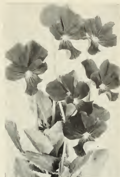
VIOLA JERSEY GEM

FIRE PINKS, Silene Virginica. Loose, sprawling foliage, brilliant red star-shaped flowers. One to two feet. July.