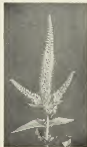
VERONICA LONGIFOLIA SUBSESSILIS

Price each Hardy Perennials, except as noted, 30c each, 75c per 3, $2.50 per 12, $18.00 per 100.