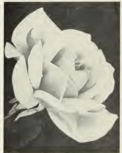
HYBRID TEA ROSE

LAFAYETTE. The red Elsie Poulsen. Both make ideal bedding roses or for the foreground of shrubbery.