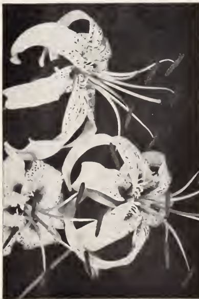
LILIUM SPECIOSUM RUBRUM