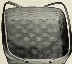
No. 9 Basket

PINE NEEDLES. As a mulch around Arbutus Plants and in the planting of the Orchids, particularly Cypripedium Acaule, Pine Needles will be of great help. We will send you material which is particularly decomposed and ideal for the purpose intended. Price $1.50 per two-bushel bag, $6.50 per 5 bags.