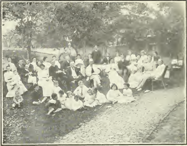
Missionaries turning aside from their conference to an afternoon tea.