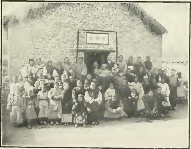
Chinese Christians in convention.