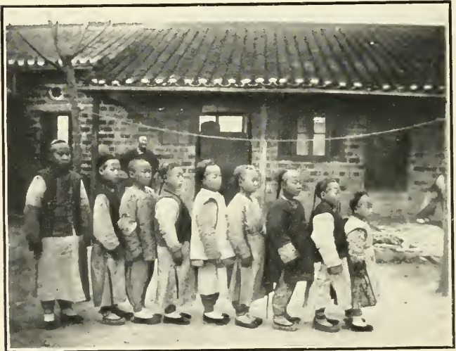
Chinese school children at the Chu Cheo dispensary.