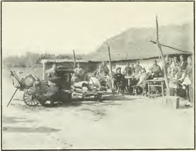
Travelling on the road in sedan chairs with wheelbarrows as freight cars.