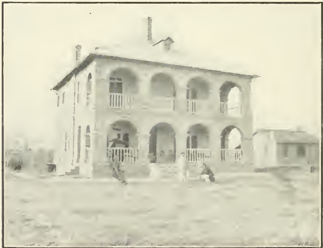
The author's home in Chu Cheo, China. His dispensary is seen at the right.