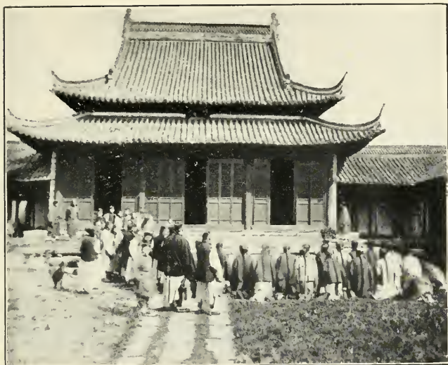
Worshipping at the Confucian Temple by successful candidates.