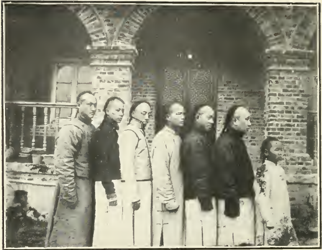
A group of influential Chinese who studied with the author.