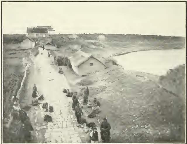
Entrance to Chu Cheo city, showing rut of wheelbarrow in paving stones; city gates, wall and moat; and a wayside restaurant.