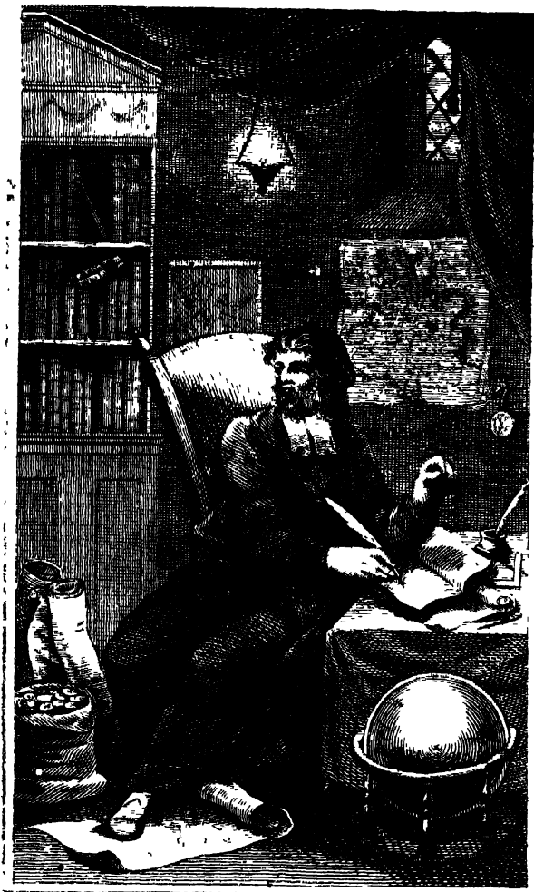
MAHMUD the TURKISH SPY.