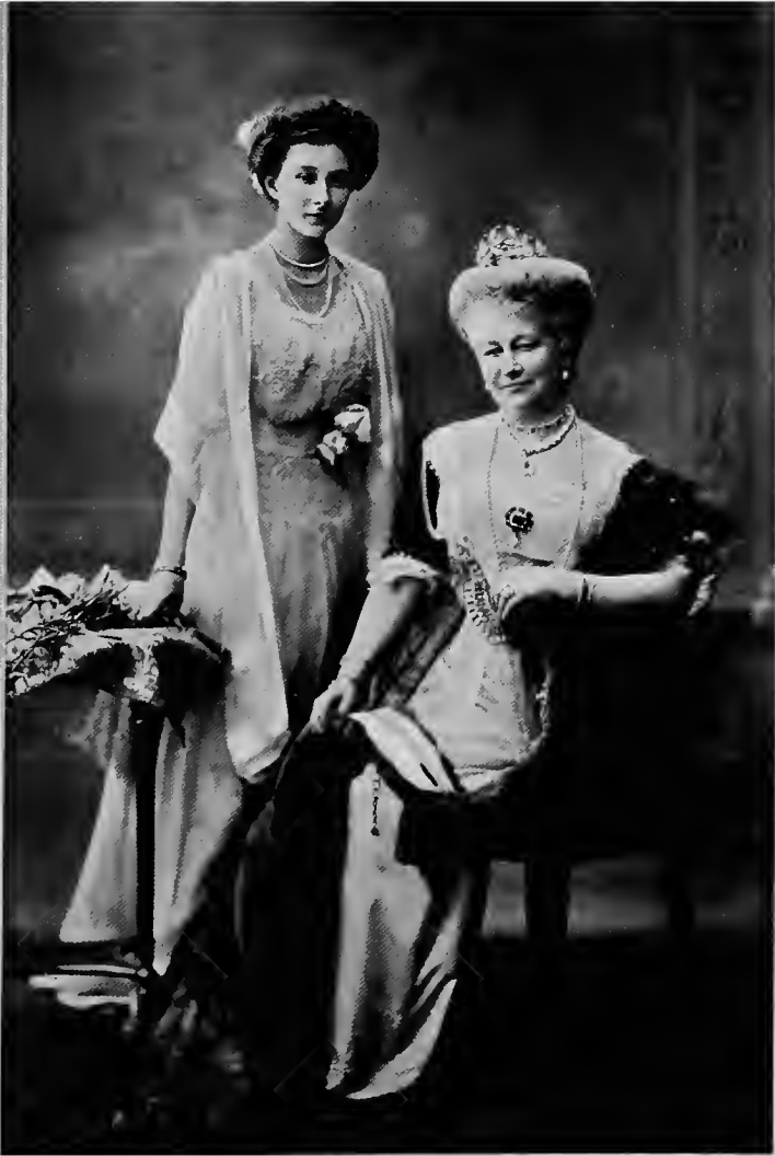
AUGUSTA VICTORIA, GERMAN EMPRESS, WITH HER DAUGHTER