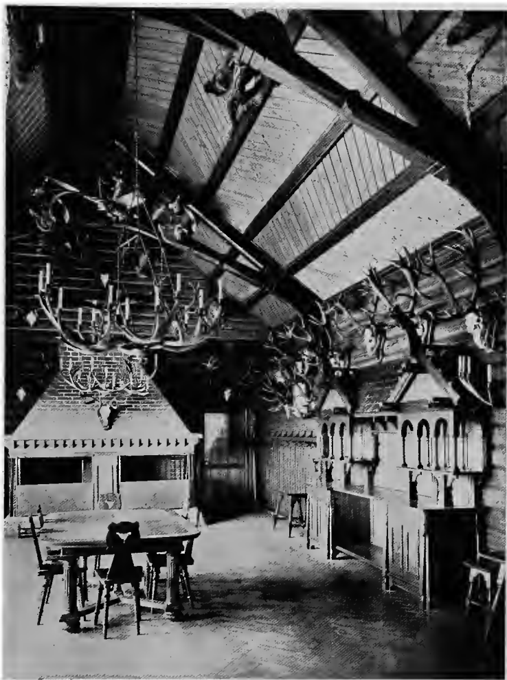
DINING-HALL AT ROMINTEN, HUNG WITH TROPHIES FALLEN TO THE EMPEROR'S GUN