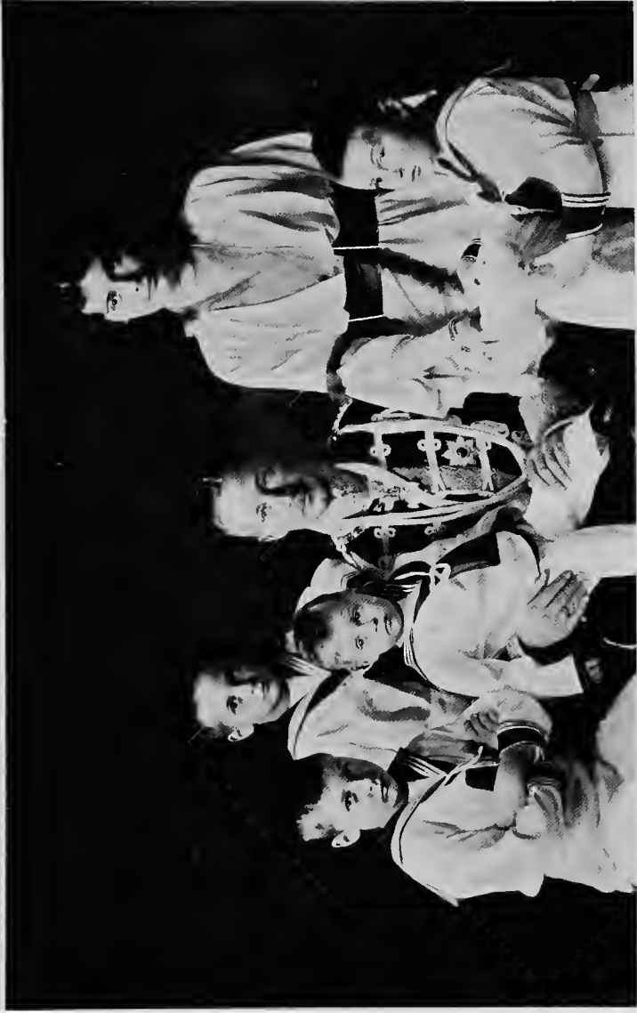
THE CROWN PRINCE AND PRINCESS WITH THEIR FOUR SONS, PRINCES WILHELM, LOUIS FERDINAND, HUBERTUS AND FRIEDRICH