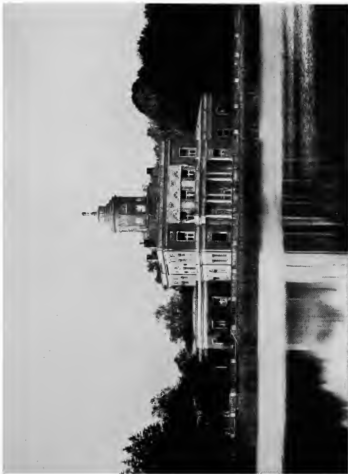
THE MARMOR PALAIS, NEAR POTSDAM, WHERE THE KAISER AND KAISERINE BEGAN THEIR MARRIED LIFE, NOW THE SUMMER RESIDENCE OF THE CROWN PRINCE AND PRINCESS