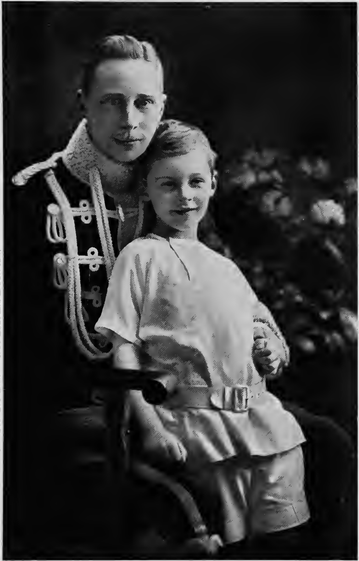
THE CROWN PRINCE AND HIS HEIR, PRINCE WILHELM