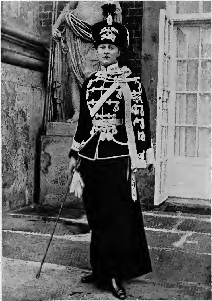
THE EMPEROR'S DAUGHTER, TAKEN ON THE DAY WHEN SHE WAS MADE COLONEL OF THE DEATH'S HEAD HUSSARS