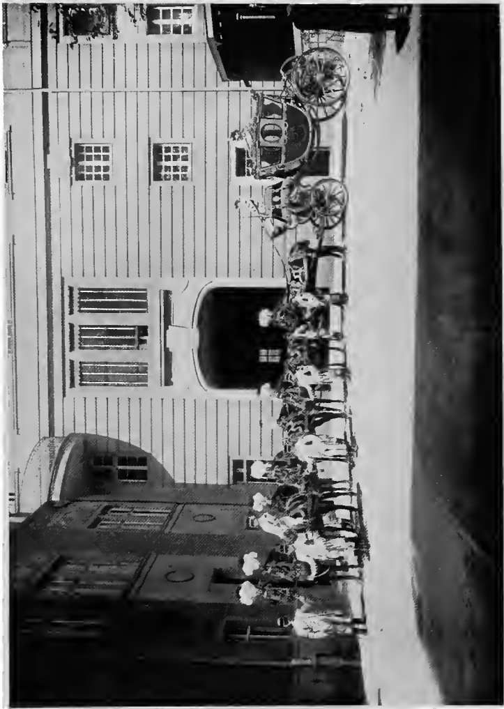
THE BRIDAL CARRIAGE, USED AT THE STATE ENTRY INTO BERLIN OF ALL ROYAL BRIDES, TAKEN IN THE COURT-YARD OF THE ROYAL MEWS, BERLIN