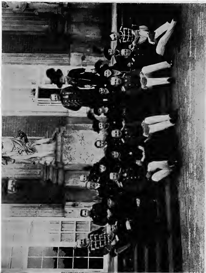
THE EMPEROR AND EMPRESS WITH MEMBERS OF THEIR FAMILY, TAKEN AT THE NEW PALACE, WILDPARK