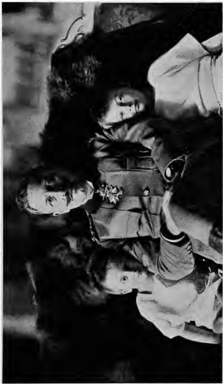
THE KAISER AND HIS TWO ELDEST GRANDSONS, PRINCES WILHELM AND LOUIS FERDINAND OF PRUSSIA