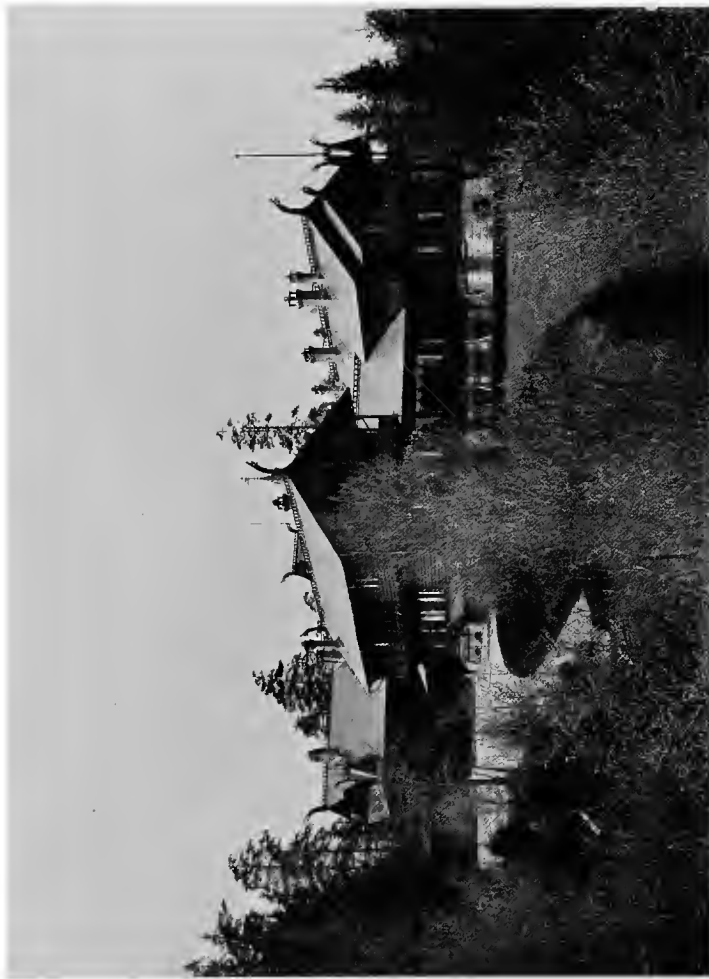
THE KAISER'S HUNTING-LODGE AT ROMINTEN, EAST PRUSSIA