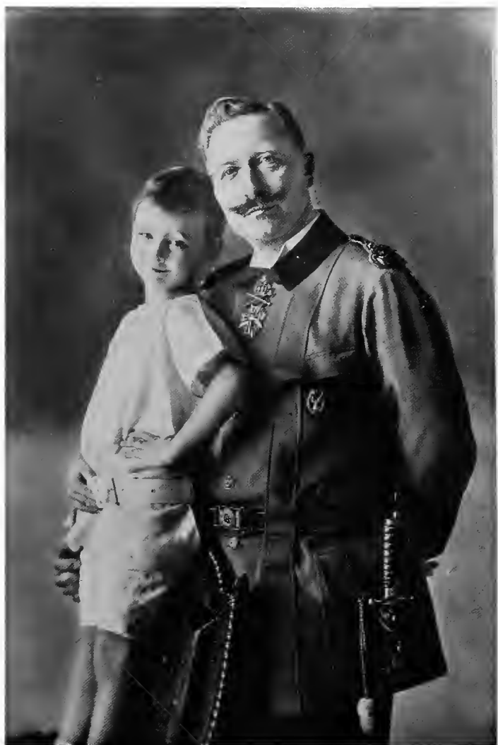
THE KAISER AND HIS ELDEST GRANDSON