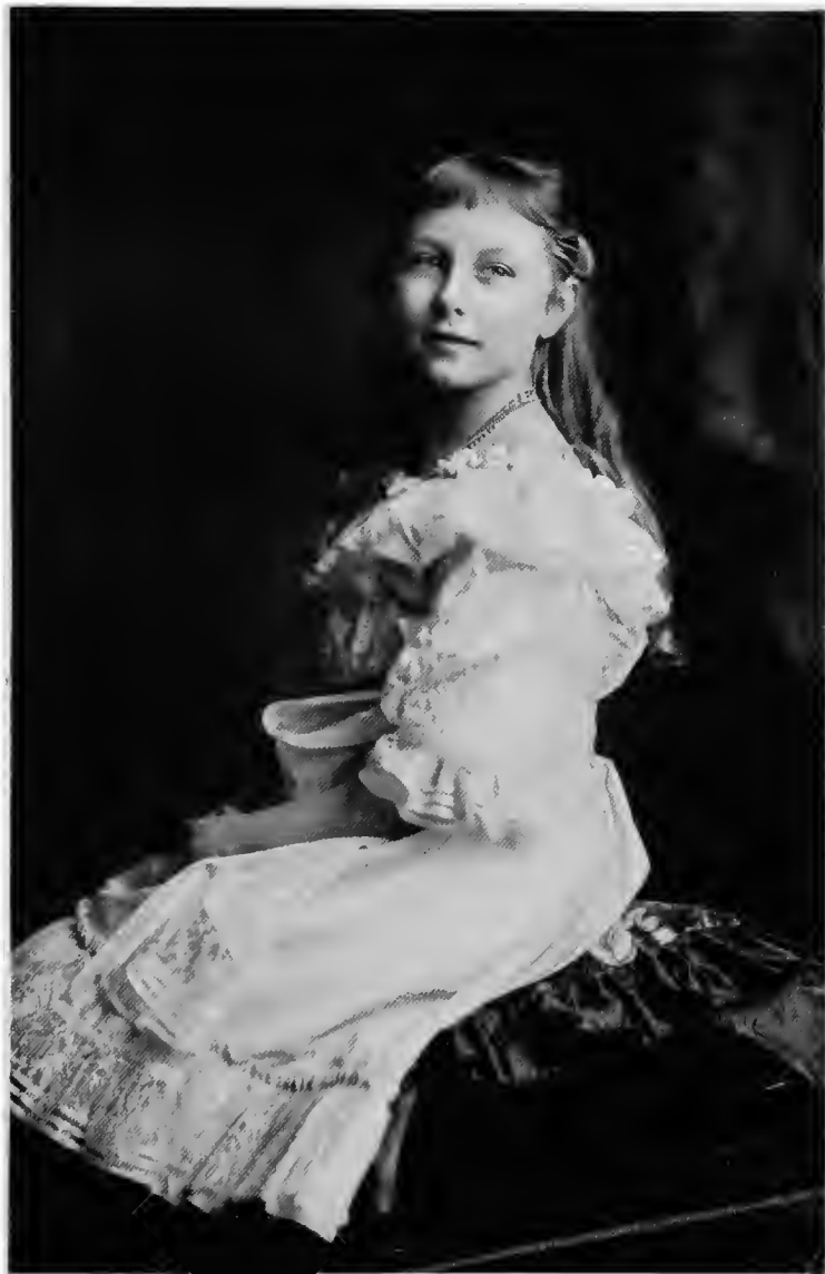
THE KAISER'S DAUGHTER, PRINCESS VICTORIA LOUISE (NOW DUCHESS OF BRUNSWICK) AT THE AGE OF NINE