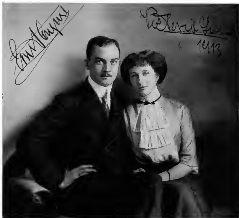
THE DUKE AND DUCHESS OF BRUNSWICK