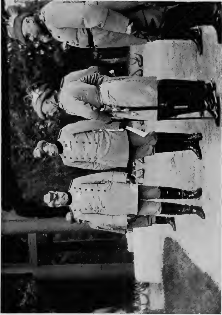
THE KAISER EXAMINING ANTLERS. BEHIND HIM STANDS PRINCE DOHNA OF SCHLOHITTEN