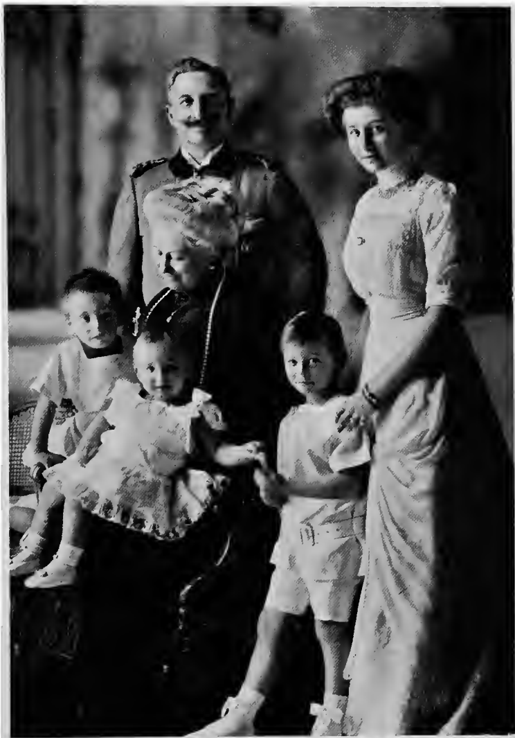
THE EMPEROR AND EMPRESS, THEIR DAUGHTER AND THE THREE ELDER SONS OF THE CROWN PRINCE