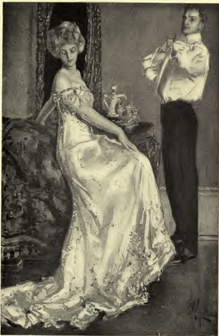
“She glanced complacently down at her softly glistening shoulders.”