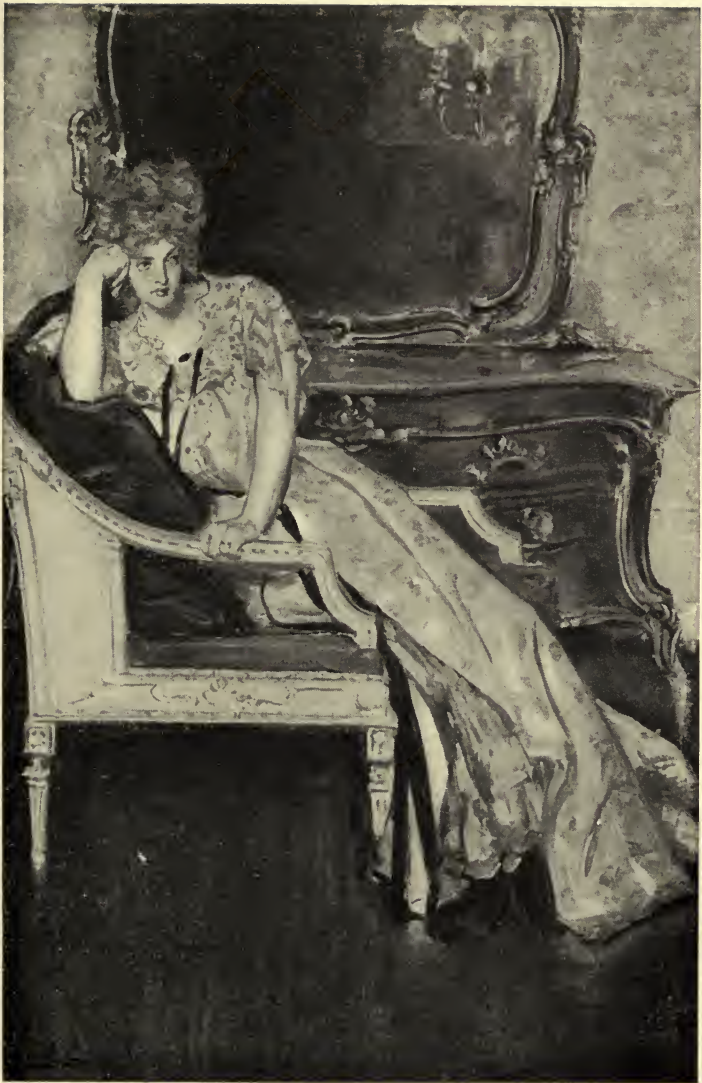
“Evidently she had been crying.”