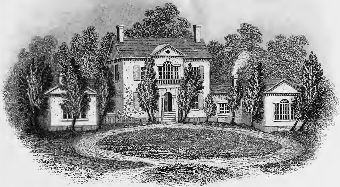
A S H L A N D .