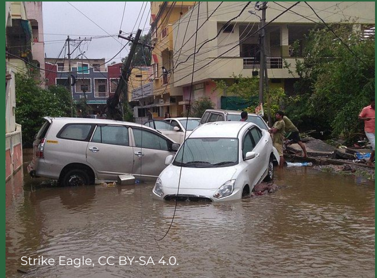
Strike Eagle, CC BY-SA 4.0.