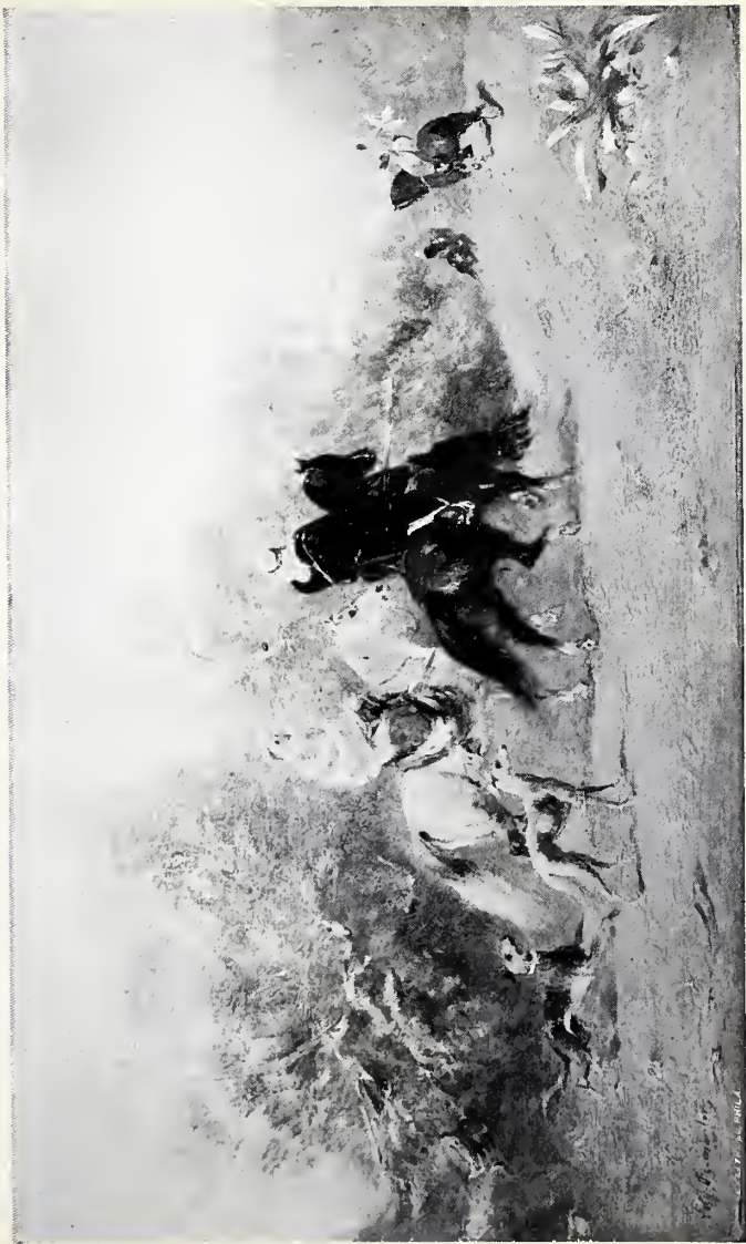
ARABS ON HORSEBACK.—EUGENE FROMENTIN.