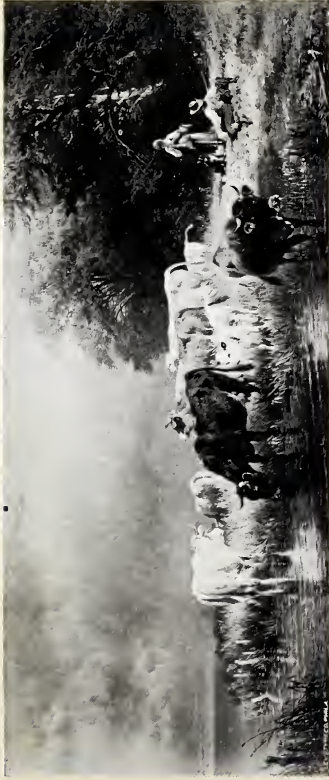
LANDSCAPE AND CATTLE. — FREDERICK VOLTZ.