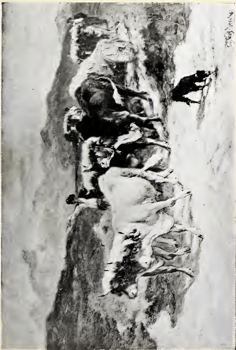
SPANISH OX TEAM. — EMILE VAN MARCKE.