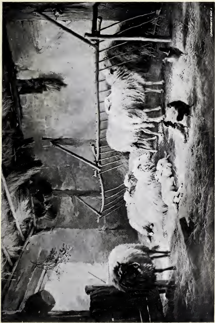
INTERIOR OF STABLE. — EUGÈNE VERBOECKHOVEN.