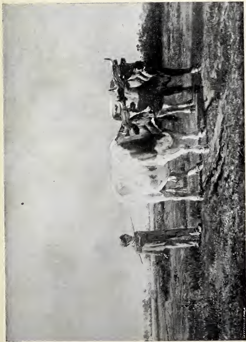
YOKE OF OXEN AND BOY. — CONSTANT TROYON.