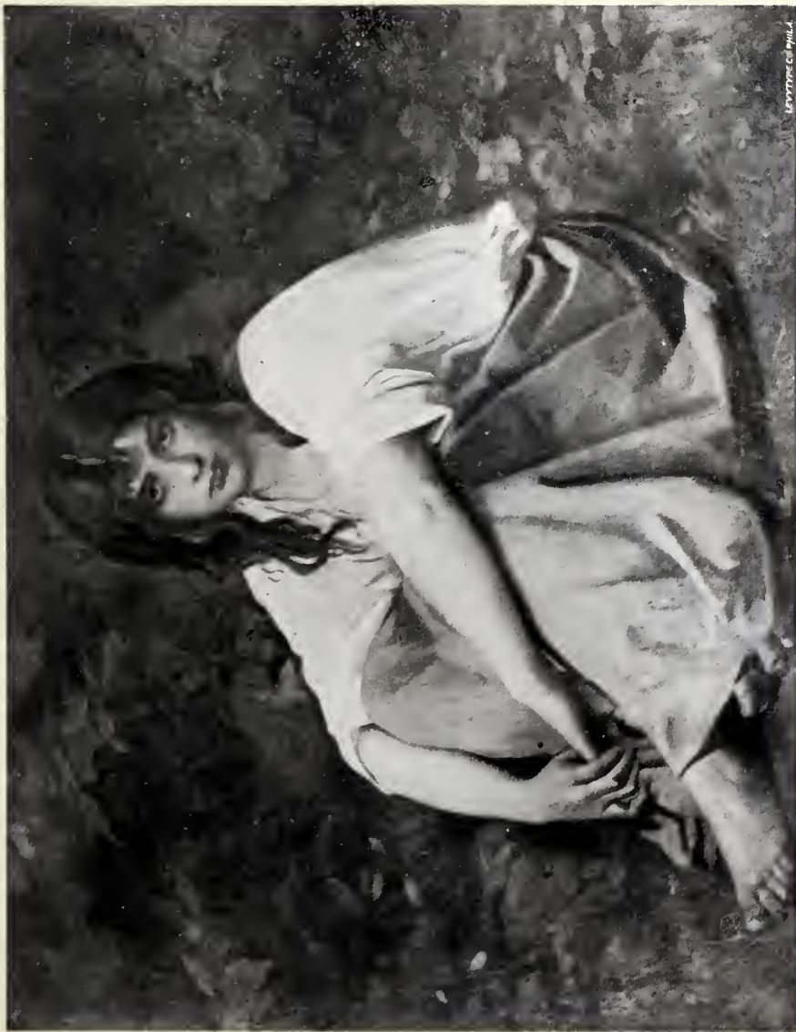
CONTEMPLATION. — ALEXANDRE CABANEL.