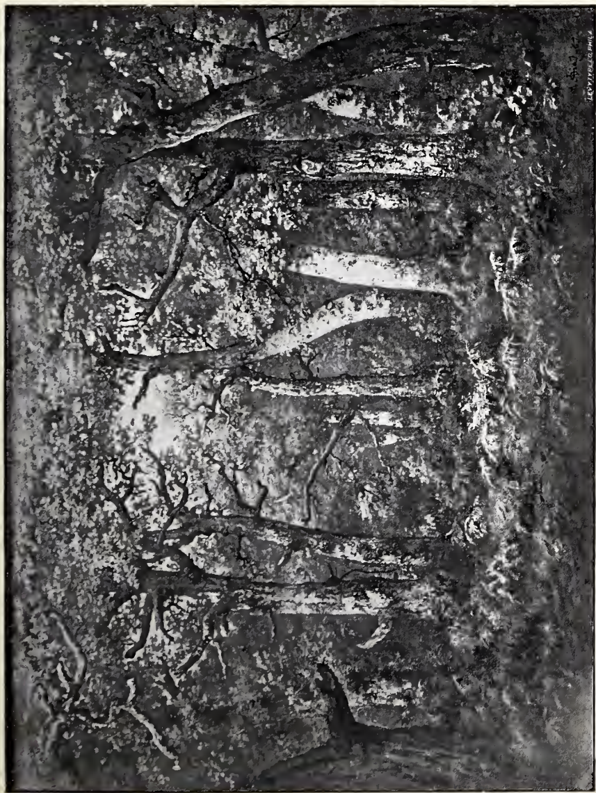
FOREST OF FONTAINEBLEAU.—N. V. DIAZ.