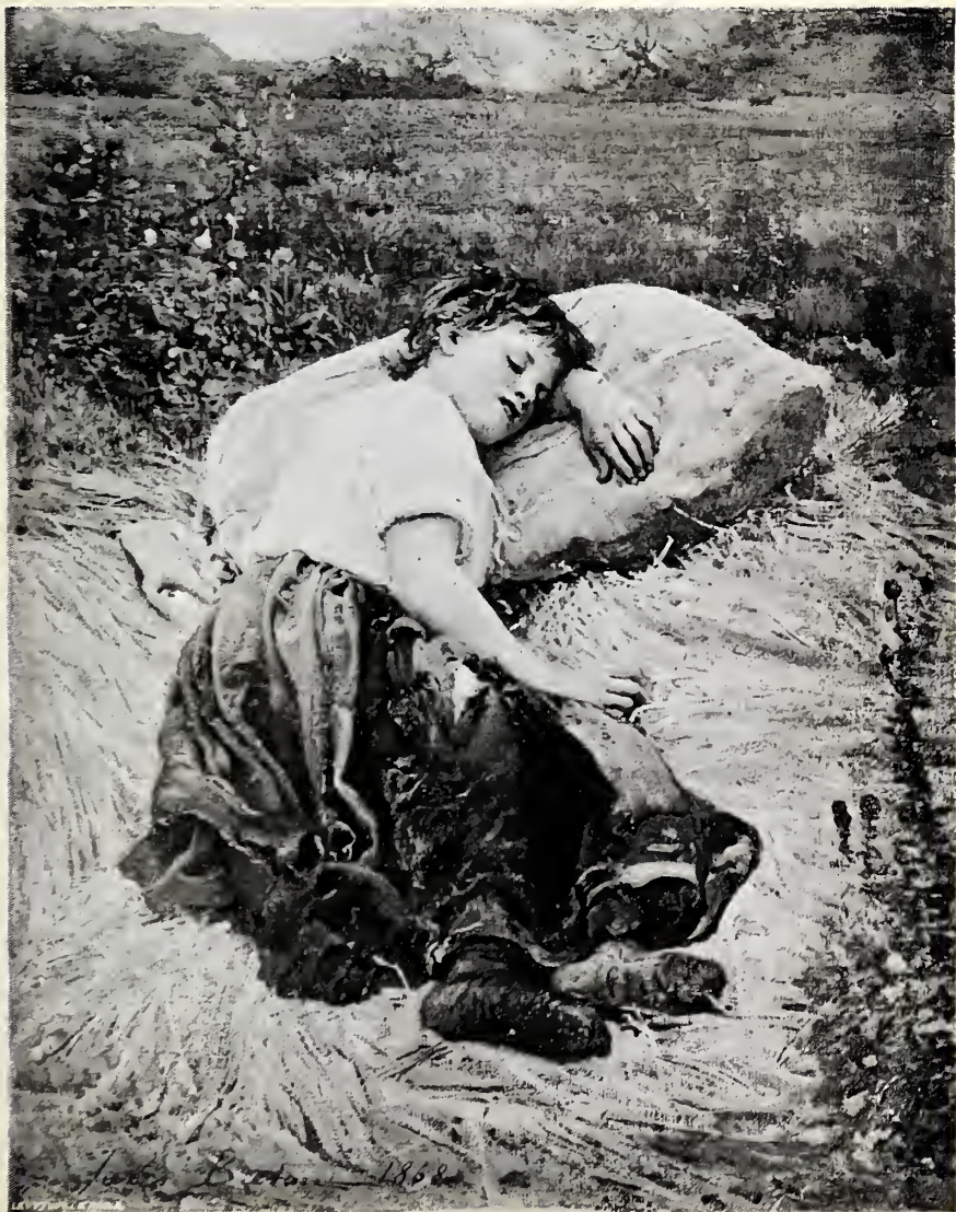
TIRED OUT. — JULES BRETON.