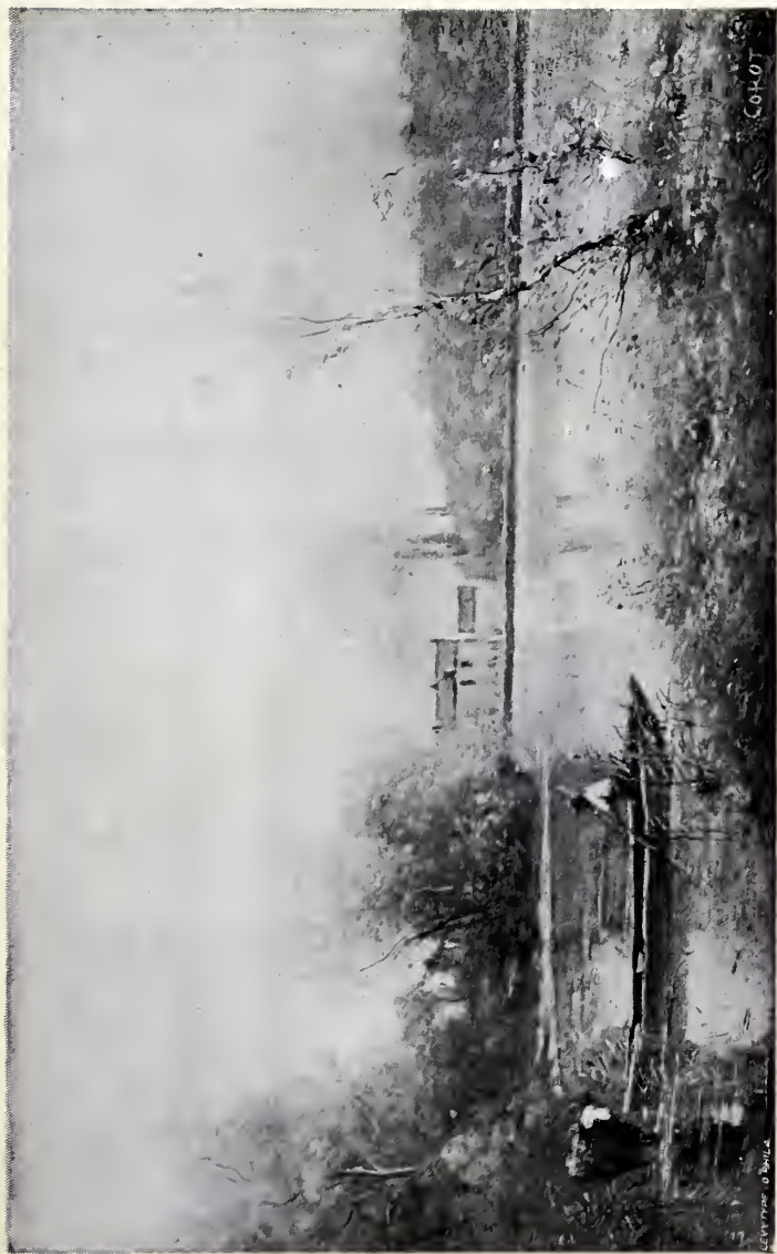
LANDSCAPE.—J. B. COROT.