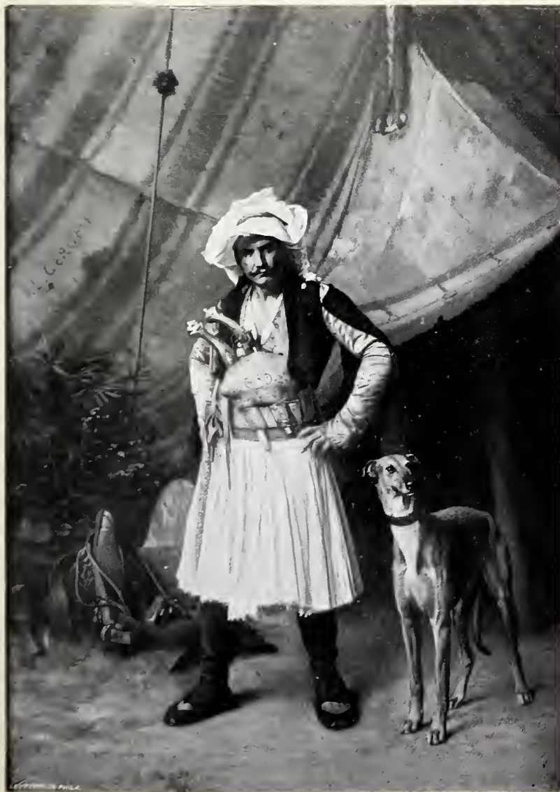
AN ARAB CHIEFTAIN — JEAN LÉON GÉRÔME.