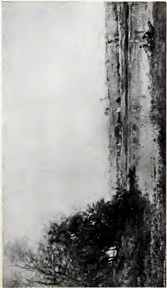
EVENING TWILIGHT.—CHARLES FRANCOIS DAUBIGNY.