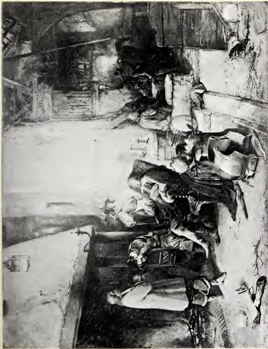
THE ORDER OF THE GUARD, — BARON HENRI LEYS.