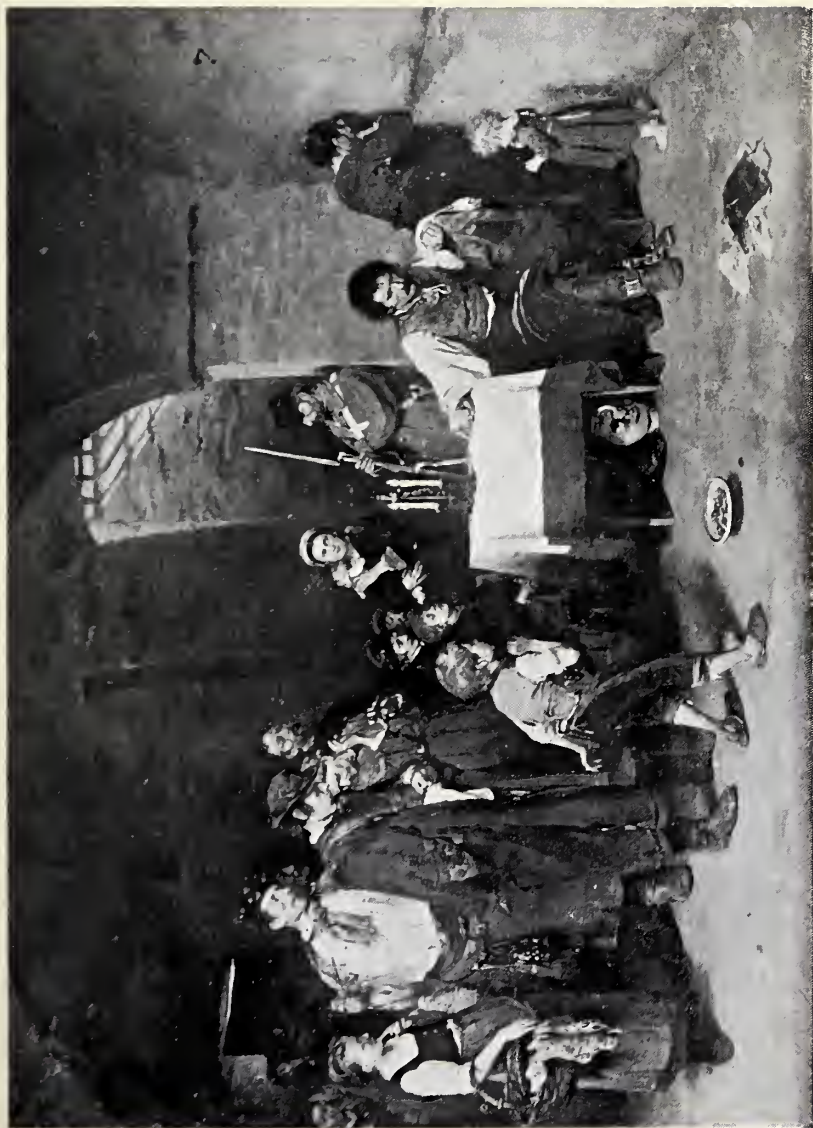
THE LAST DAY OF THE CONDEMNED, — MIHÁLY MUNKÁCSY.