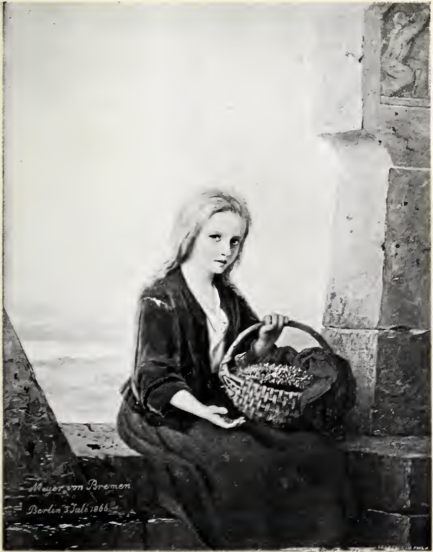
WILL YOU BUY MY FLOWERS?—MEYER VON BREMEN.