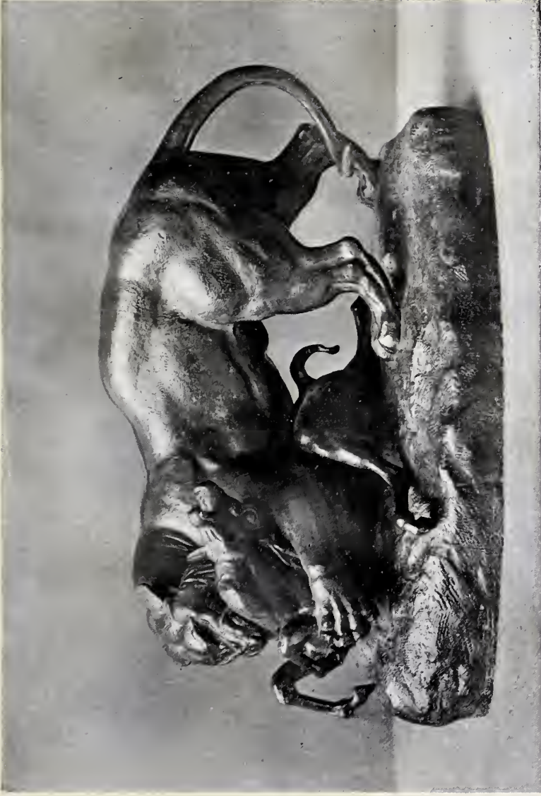
TIGER DEVOURING AN ANTELOPE; — A. L. BARYE.