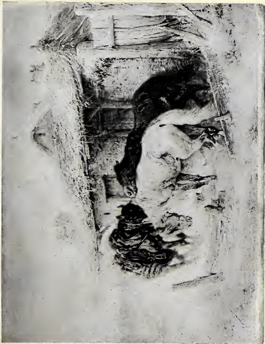
WINTER. — ADOLPHE SCHREYER.