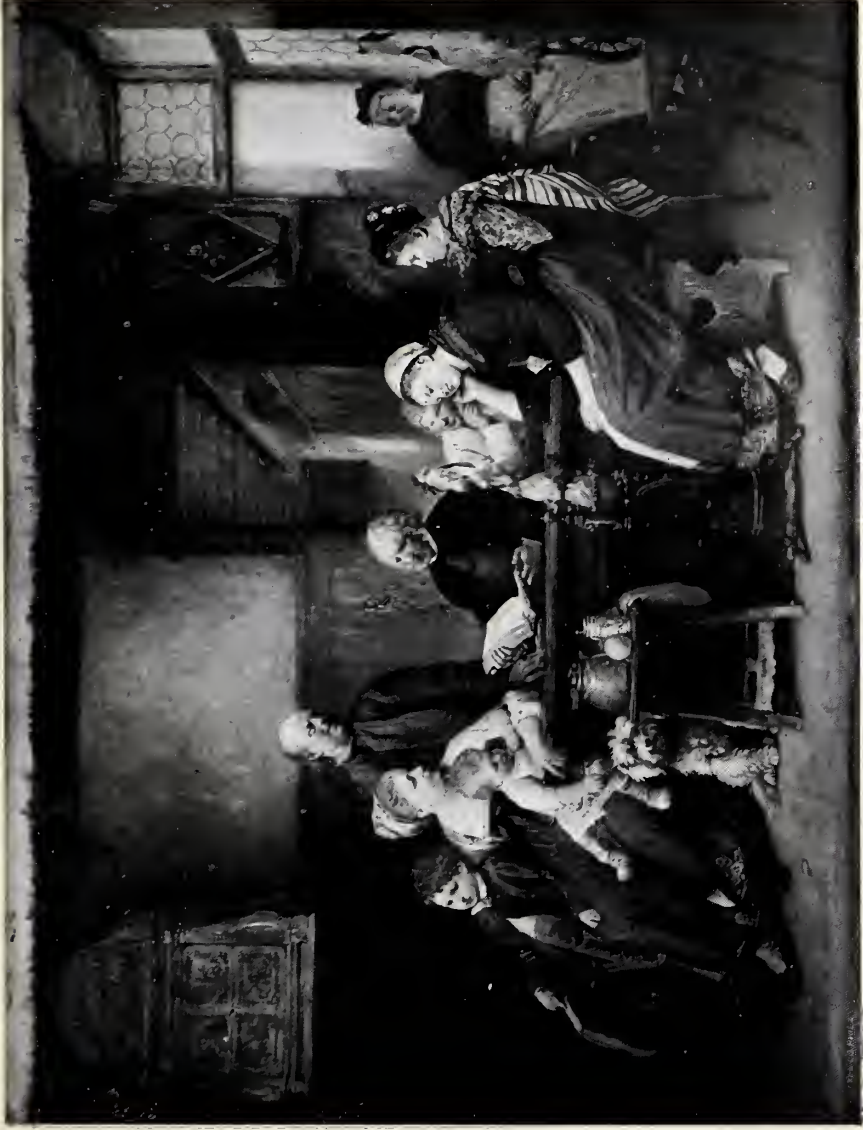
READING THE BIBLE IN THE FAMILY:—GUSTAVE BRION.