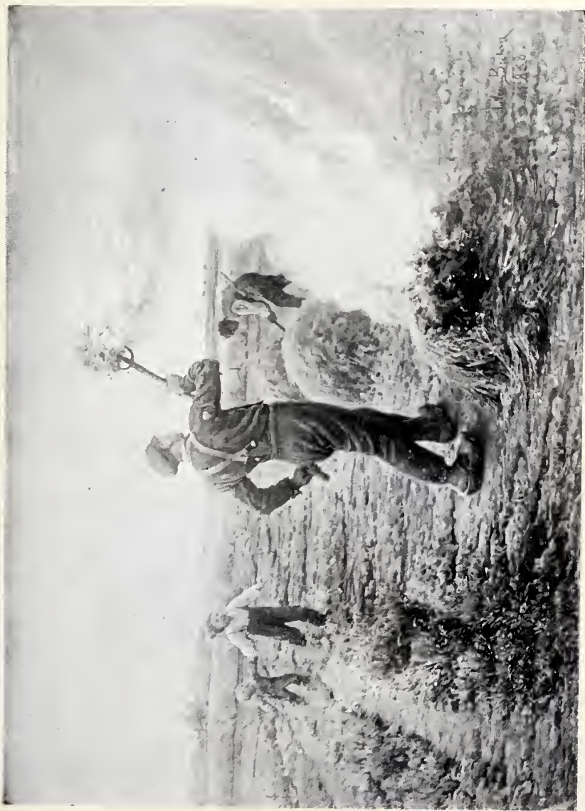
BURNING TARES IN A WHEATFIELD.—JULES BRETON.