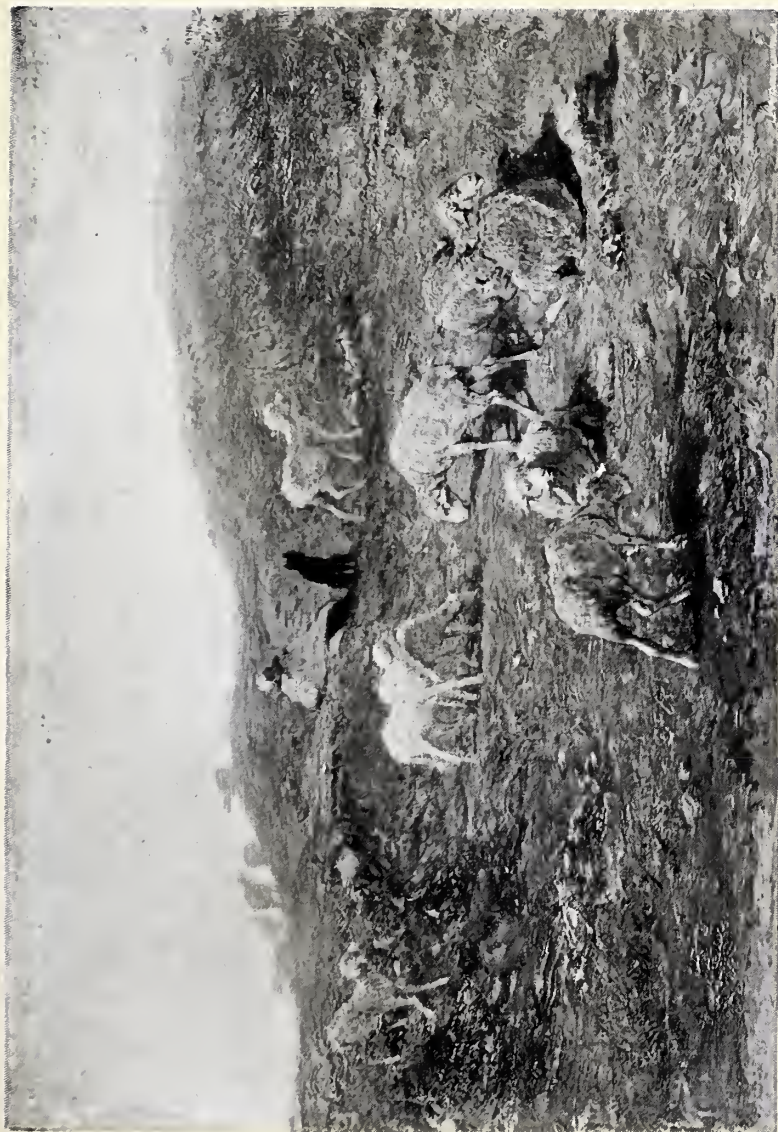
LANDSCAPE, WITH SHEEP GRAZING. —CHARLES EMILE JACQUE.