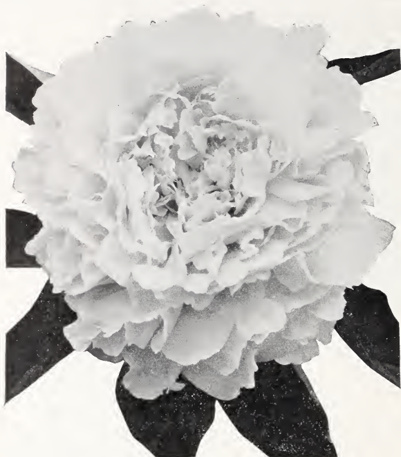
Mme Emile Lemoine