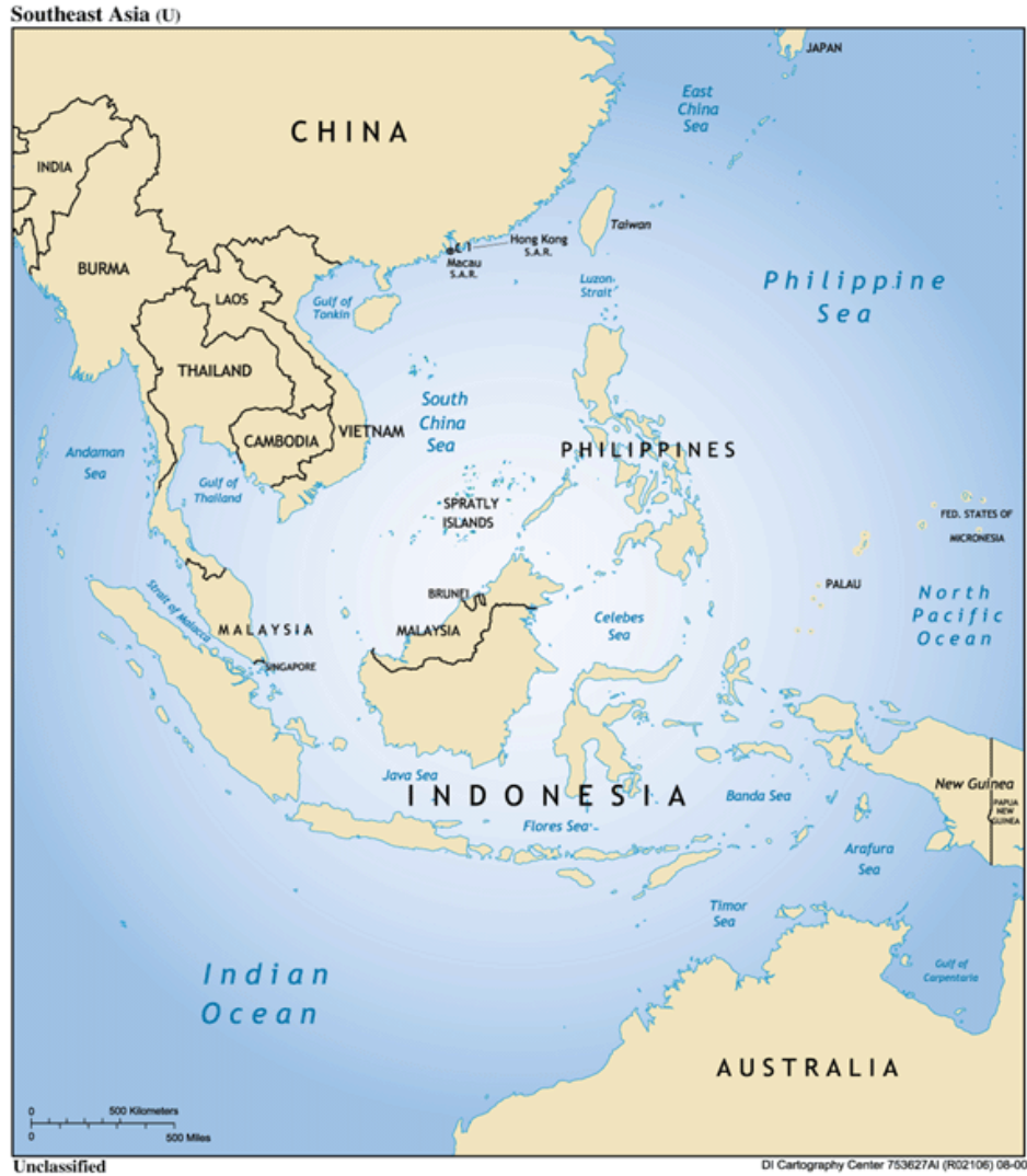
Figure 2. Map of Southeast Asia

The Islamized people of today's Mindanao are the most dominant ethnic group in the Philippines. 24 They include at least thirteen different ethno-linguistic groups. The three largest and most politically dominant are 1) The Maguindanaons, "people of the flooded plains," of the Cotabato Province (Maguindanao, Sultan Kudarat, North Cotabato, and South Cotabato); 2) The Maranaos, "people of