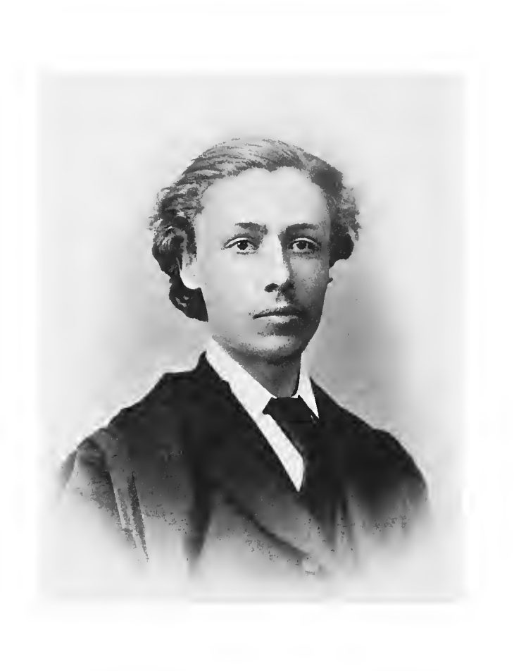
As an undergraduate at Oxford