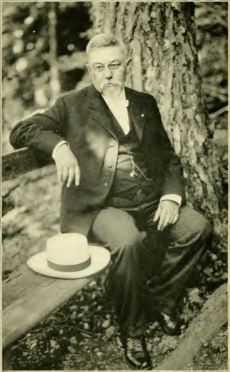
SAMUEL WHITAKER PENNYPACKER