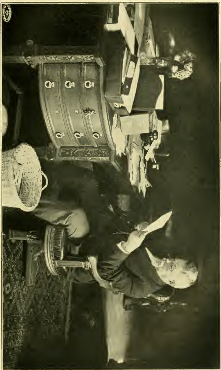
GOVERNOR PENNYPACKER IN THE EXECUTIVE CHAMBER, HARRISBURG