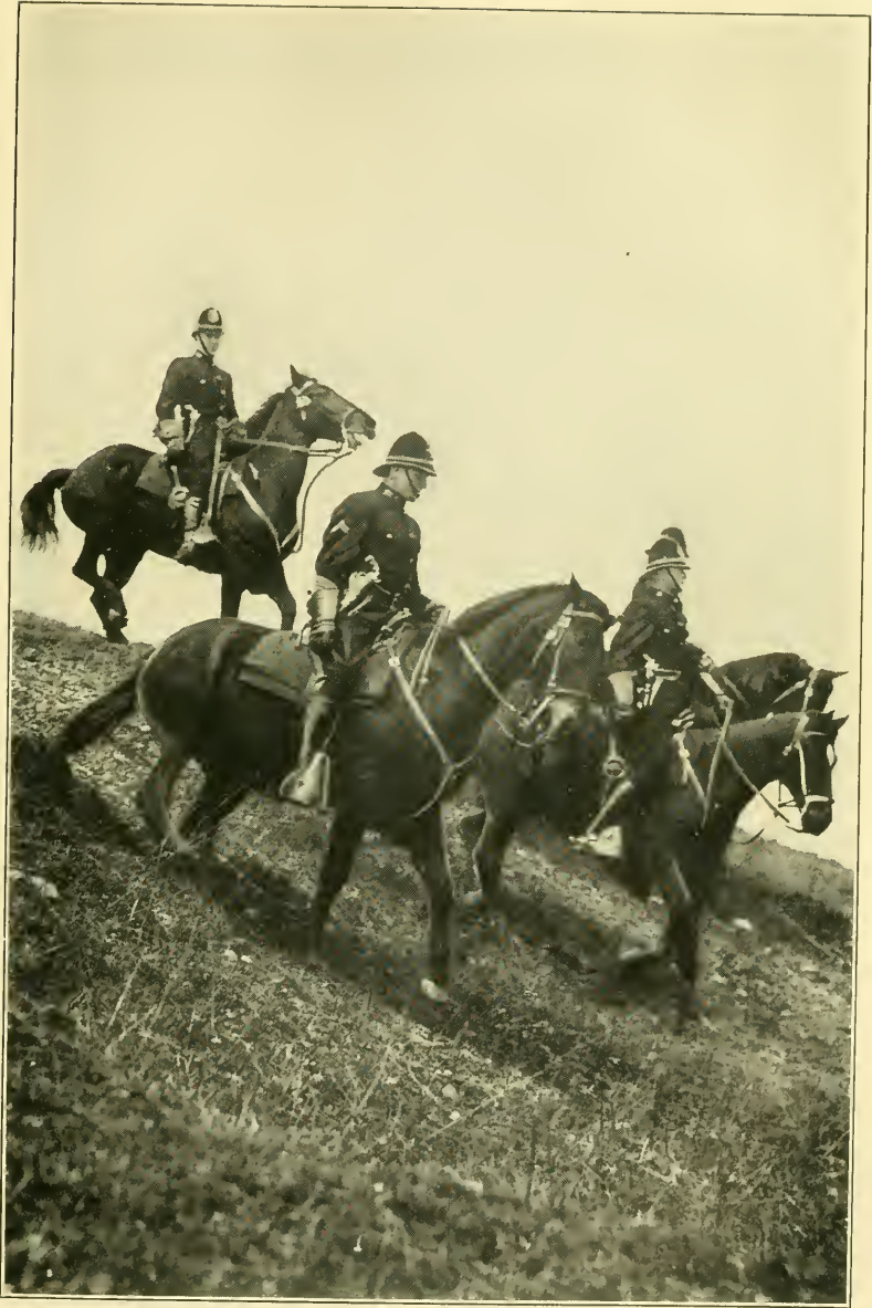
GROUP OF GOVERNOR PENNYPACKER'S PENNSYLVANIA CONSTABULARY