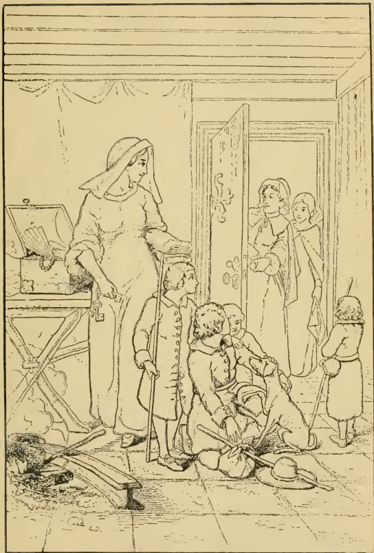
“Found the good woman preparing to be gone.”—Page 255. Pilgrim's Progress.