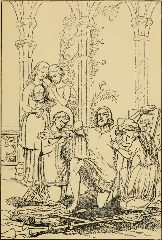
“They harnessed him from head to foot.”—Page 89. Pilgrim's Progress.