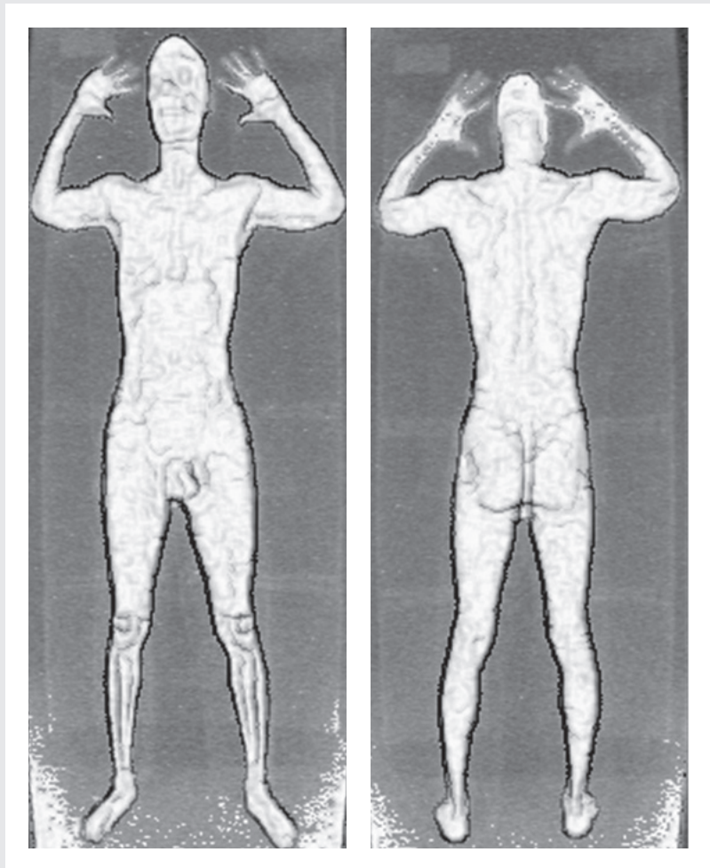
Male Front and Back