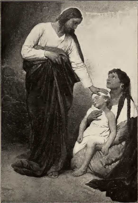
CHRIST HEALING THE SICK CHILD.