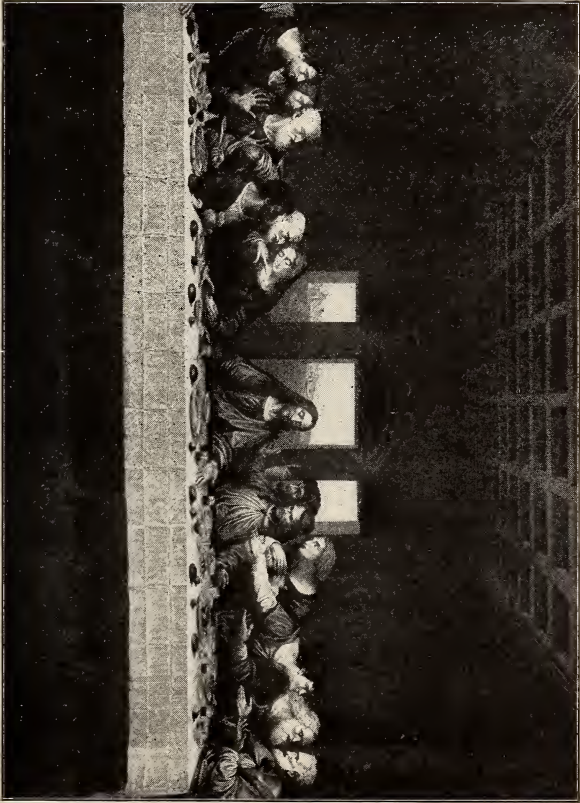
THE LAST SUPPER.