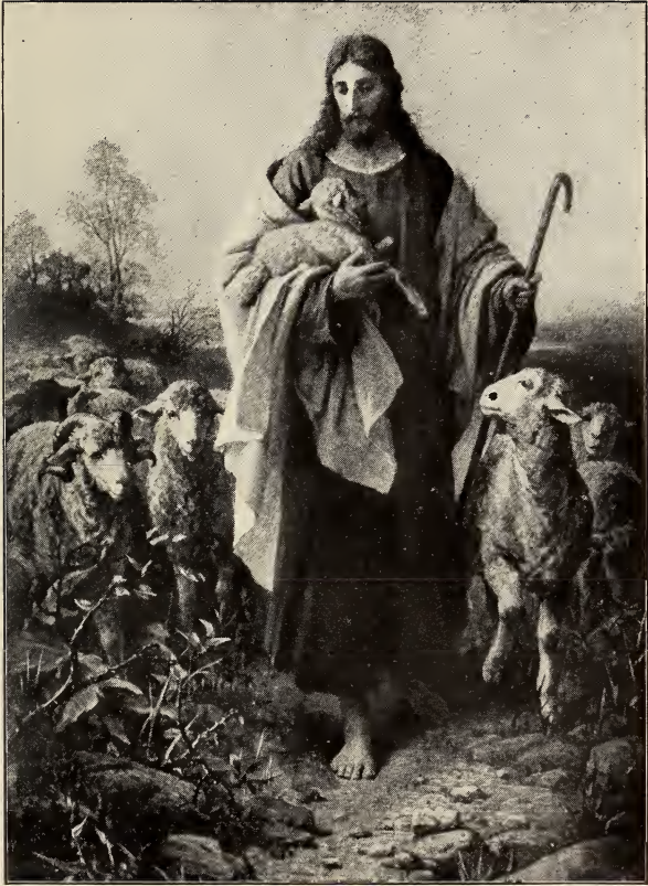
CHRIST THE GOOD SHEPHERD.