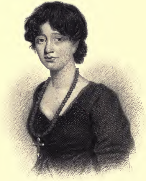
Lady North Wife of Sir Walter