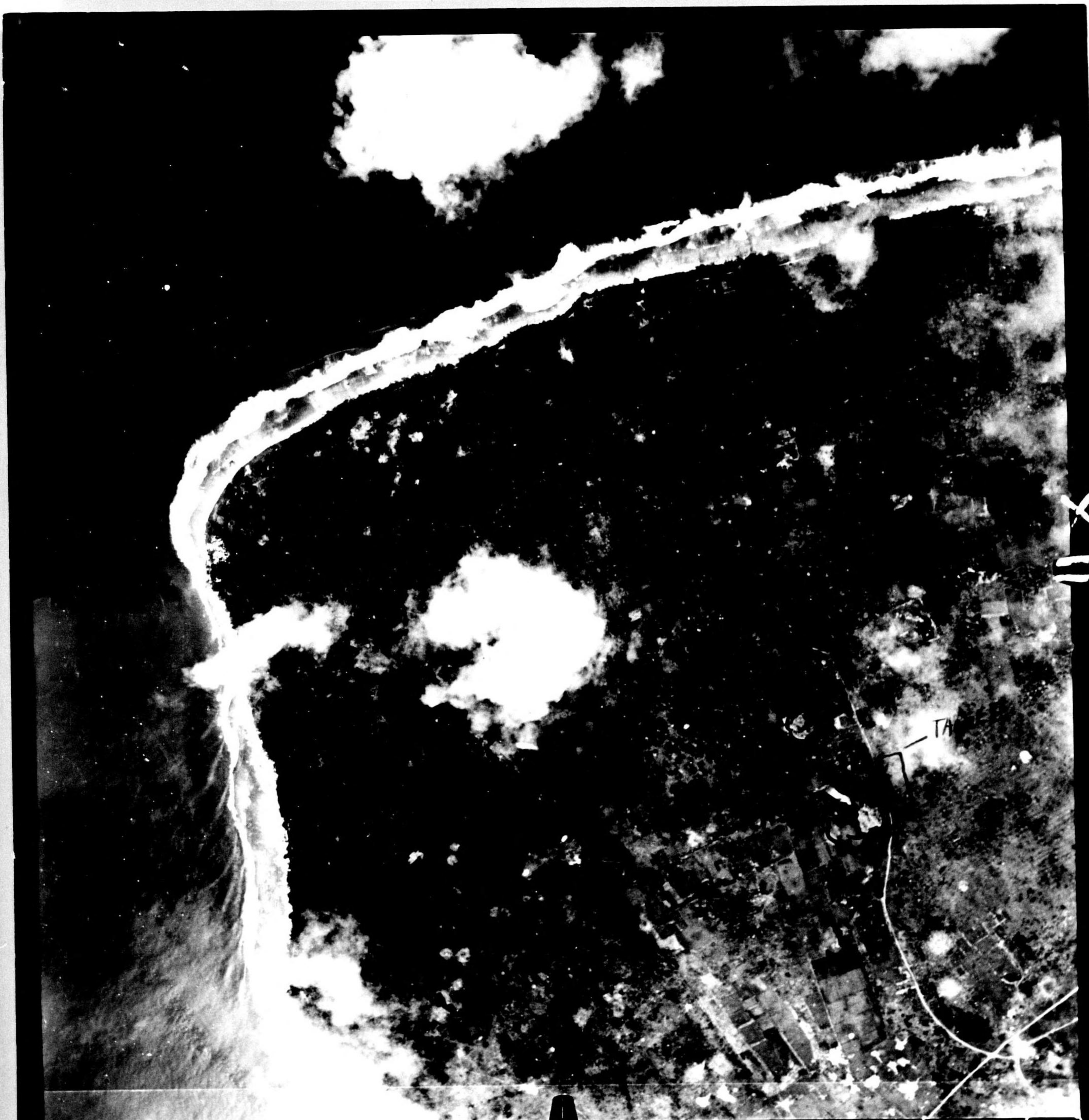
VII 7/12 1945 - MARCH 45 - NAVEN 301 Pos. - 10700 - 55