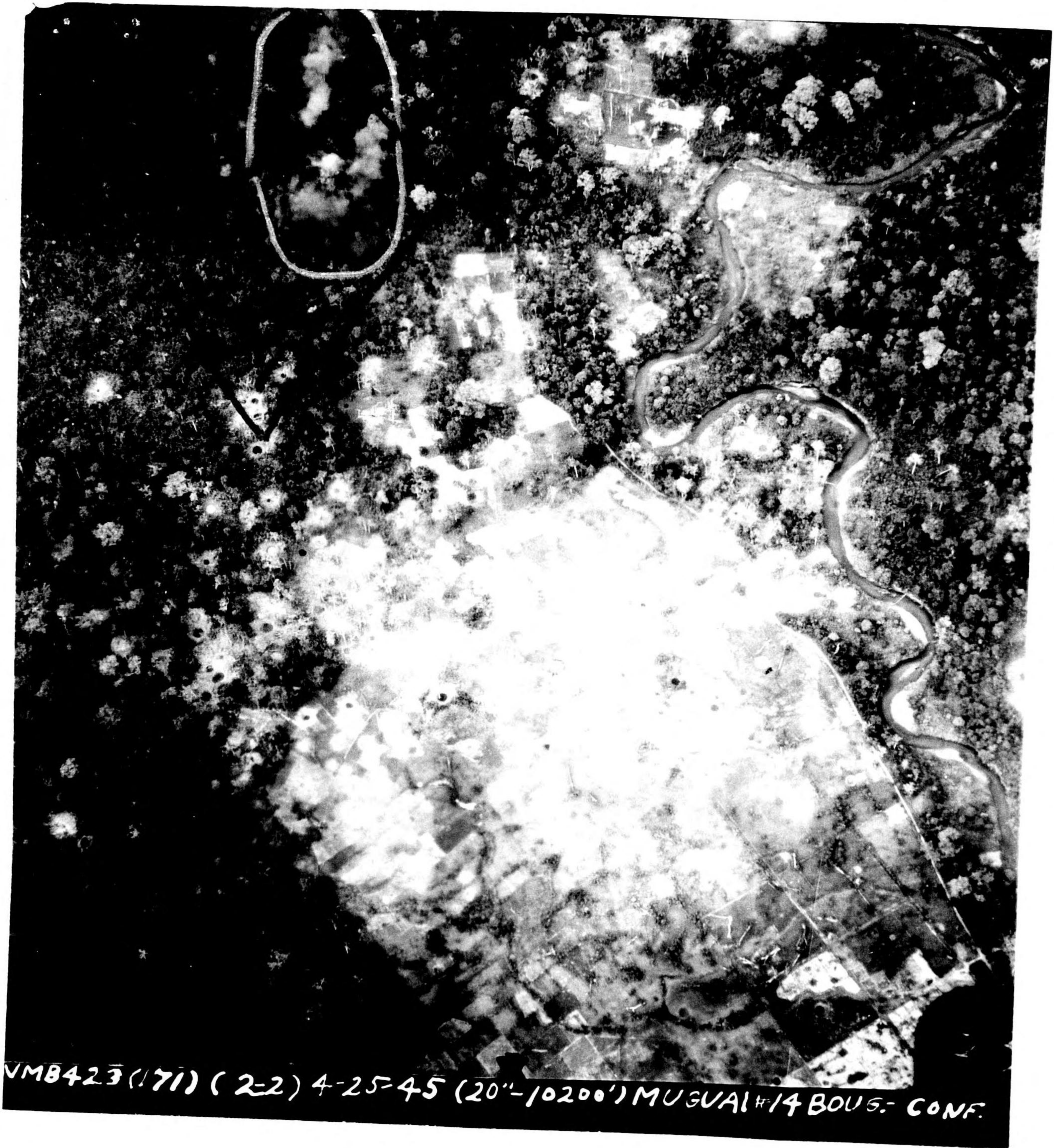
VMB423 (171) (2-2) 4-25-45 (20"-10200') MUSVAL #14 BOUS- CONF.