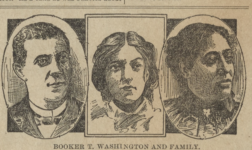
BOOKER T. WASHINGTON AND FAMILY.

Should the more extensive experiments now in progress support the earlier work, as there is every reason to expect, the result will be to increase greatly the area adapted to the growth of the finest quality of cigar wrappers known, and there will be raised in this country tobacco now imported to the amount of $8,000,000 annually.