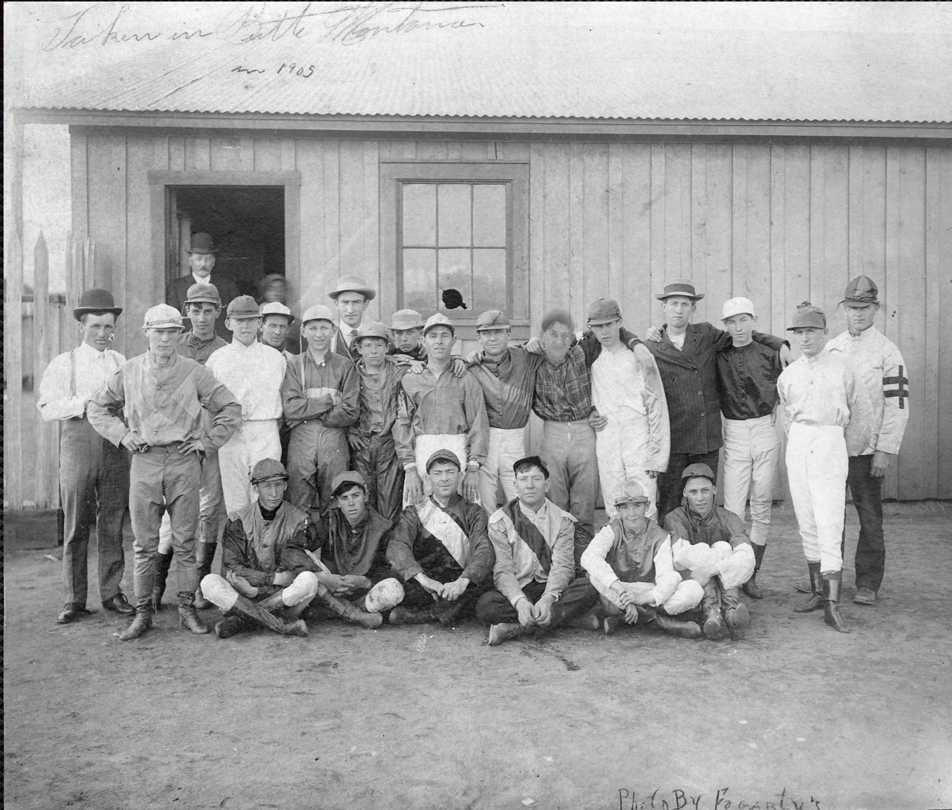
Jockeys in Butte, Montana, 1905.