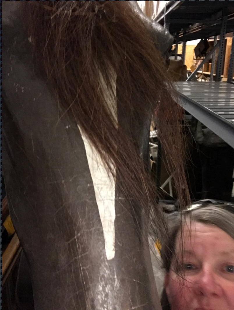
Selfie with “Spokane,” courtesy Montana Historical Society