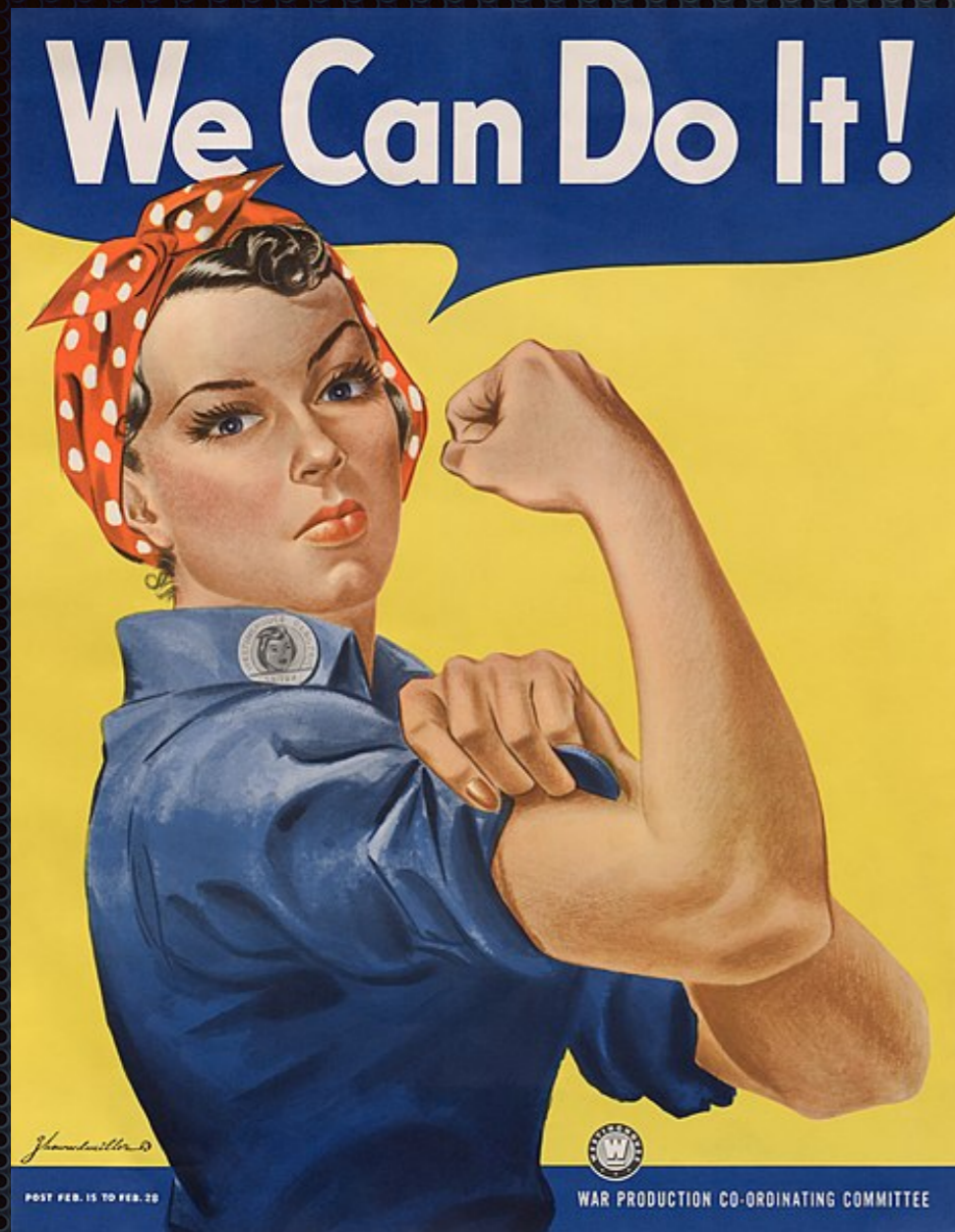
Wikimedia Commons File:We Can Do It! NARA 535413 - Restoration 2.jpg