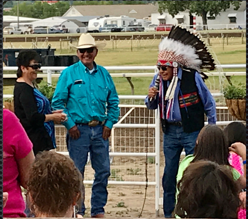
Great Falls State Fair, 2018. Joe Bird Rattler honored by lifetime Chief of the Blackfeet nation, Earl Old Person