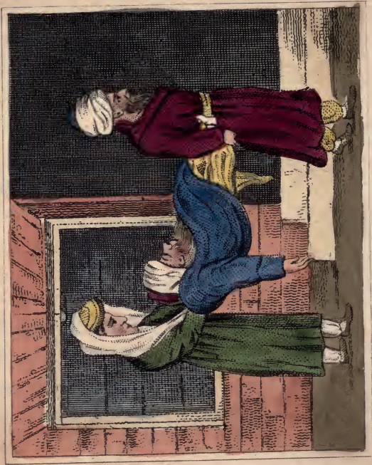
And between them they carried it thus up the Street. — page 5.