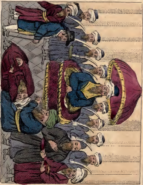
From whom a great fish bone he quickly drew out. — page 80.