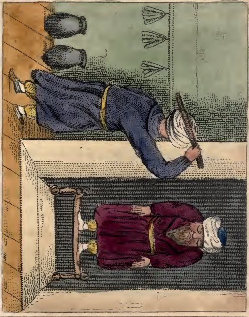
Took up a large stick and approached him full force. — page 10.