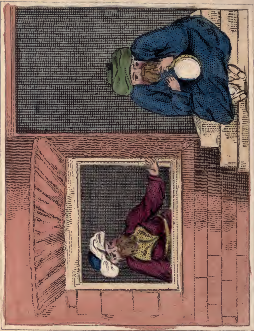
Began on his Tabor most merrily playing. — page 5.