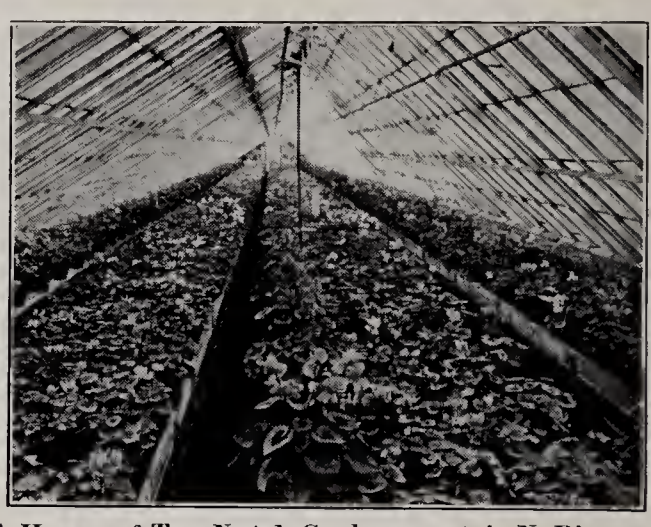
A House of Top Notch Cyclamen at A. N. Pierson, Inc., grown from our seed.