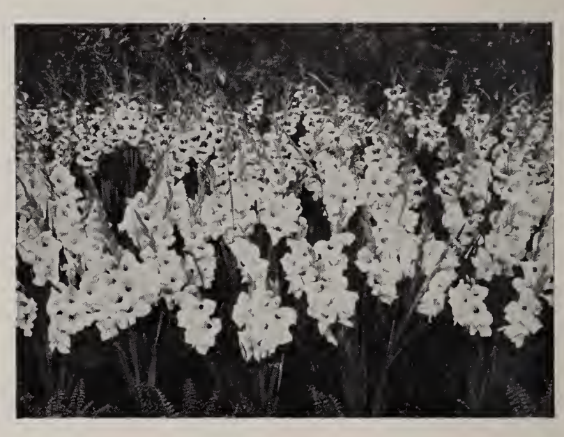
This is how they bloom-grown from S. S. S. bulbs.

Tried and true Northern Grown Bulbs. Clean and free from Thrip and disease. Well ripened Top-Notch Michigan Stock.