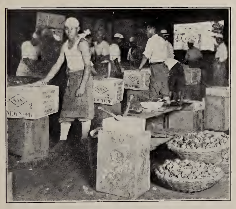
Some of Japan's finest being packed for us, before leaving home.