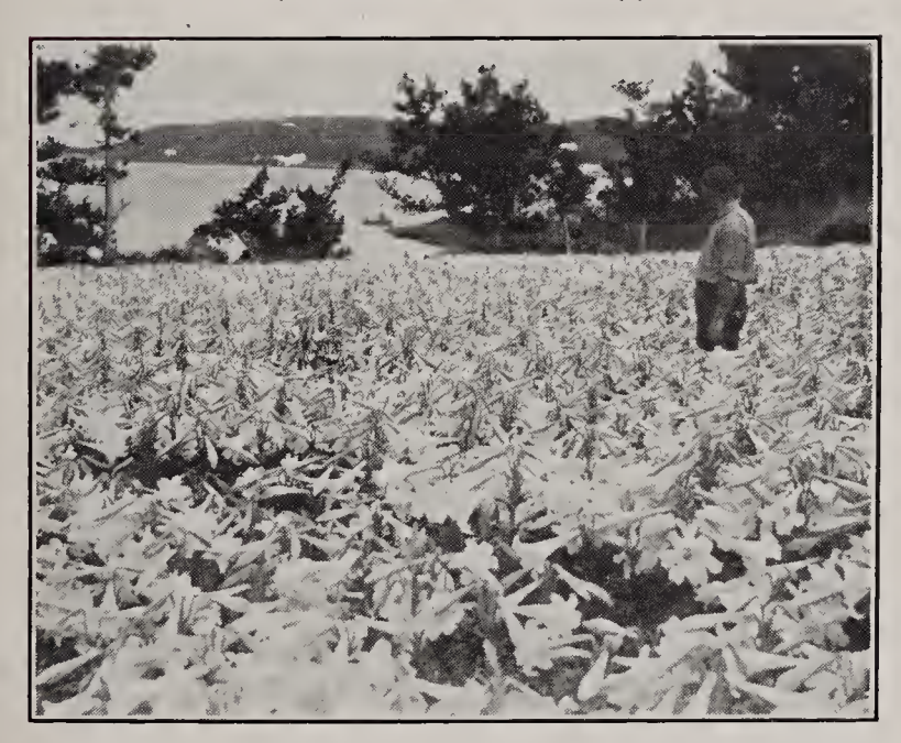
ooking over the Crop "At Home." The Fine Selected True Strain you have always had from S. S. S. & Co.

Our frequent field inspections assure you of only extra selected bulbs from the best