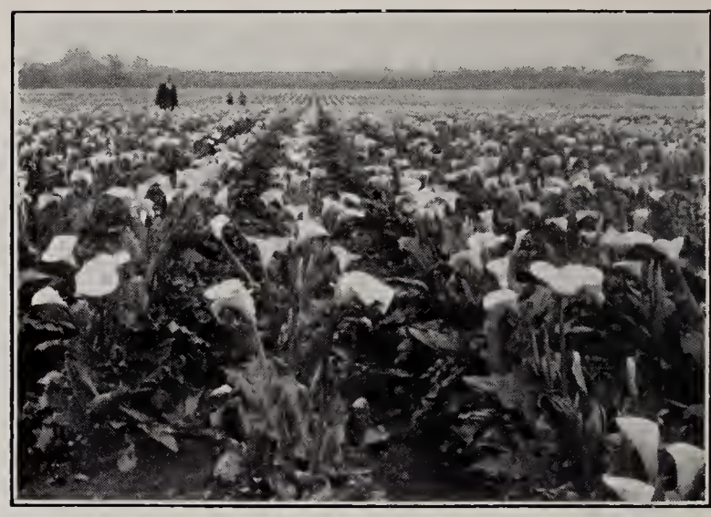
Calla Godfrey grown for S. S. & Co. Here they in the Northwest Fields, Experience has taught that they "do" better here, and so far are "i from disease."

Aethiopiea. (White) (Home and North West grown). 1½-1¾ in., 1¾-2 in., 2 in. and up. Godfrey. Pure white. 1-1½ in., 1½ in. up. Elliottiana. Yellow. 1½-2 in., 2-2½ in., 2½-3 in., 3