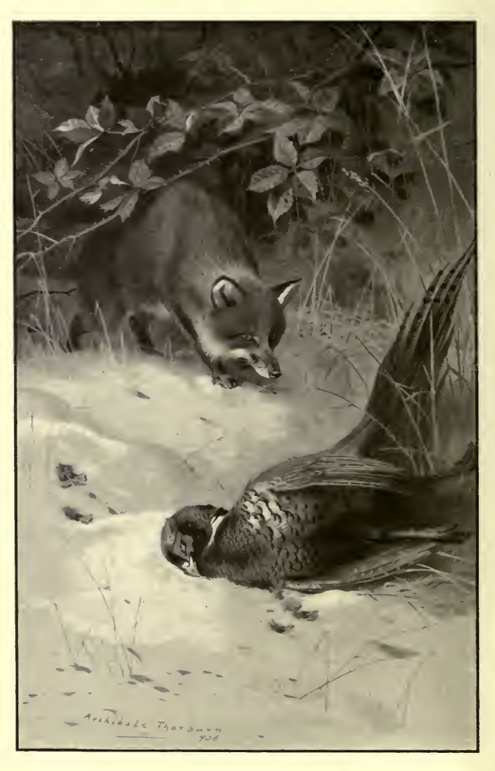
GLEANING AFTER THE SHOOTERS