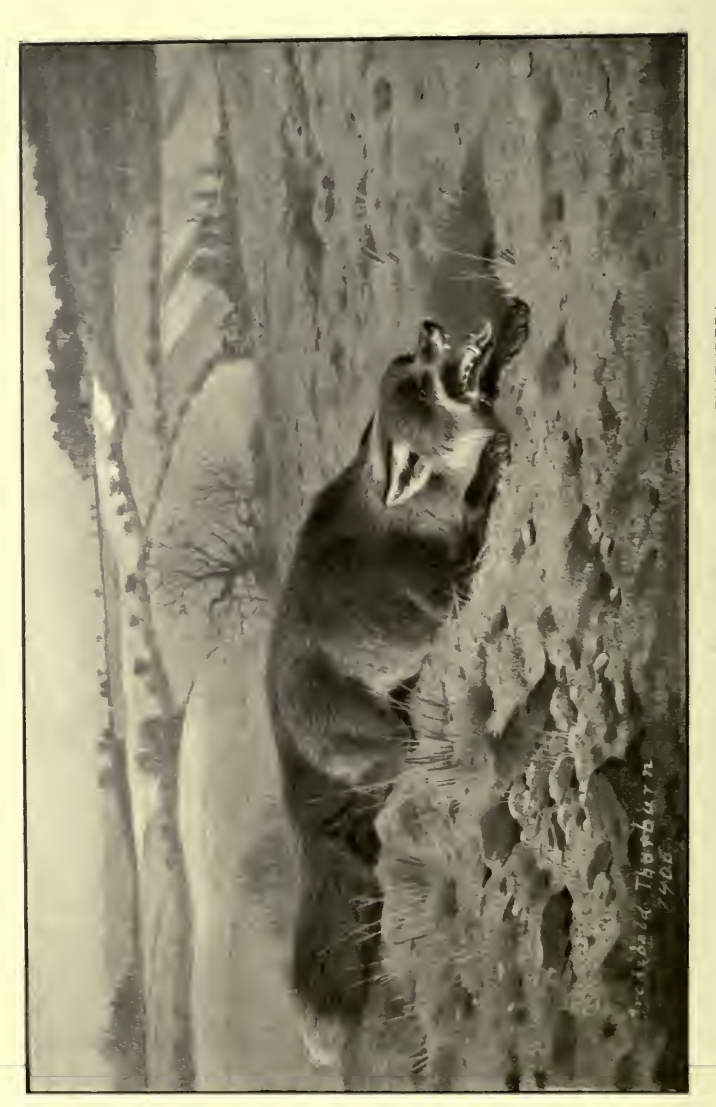
'HIS STRENGTH EXHAUSTED AND WILES EXPENDED'