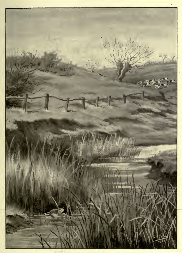
'THE FOX WAS SEEN TO SWIM BACK'