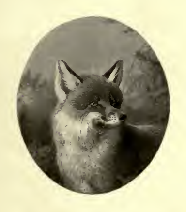
WITH EIGHT ILLUSTRATIONS BY ARCHIBALD THORBURN AND G. D. GILES

JOINT AUTHOR OF 'POLO' IN THE BADMINTON LIBRARY