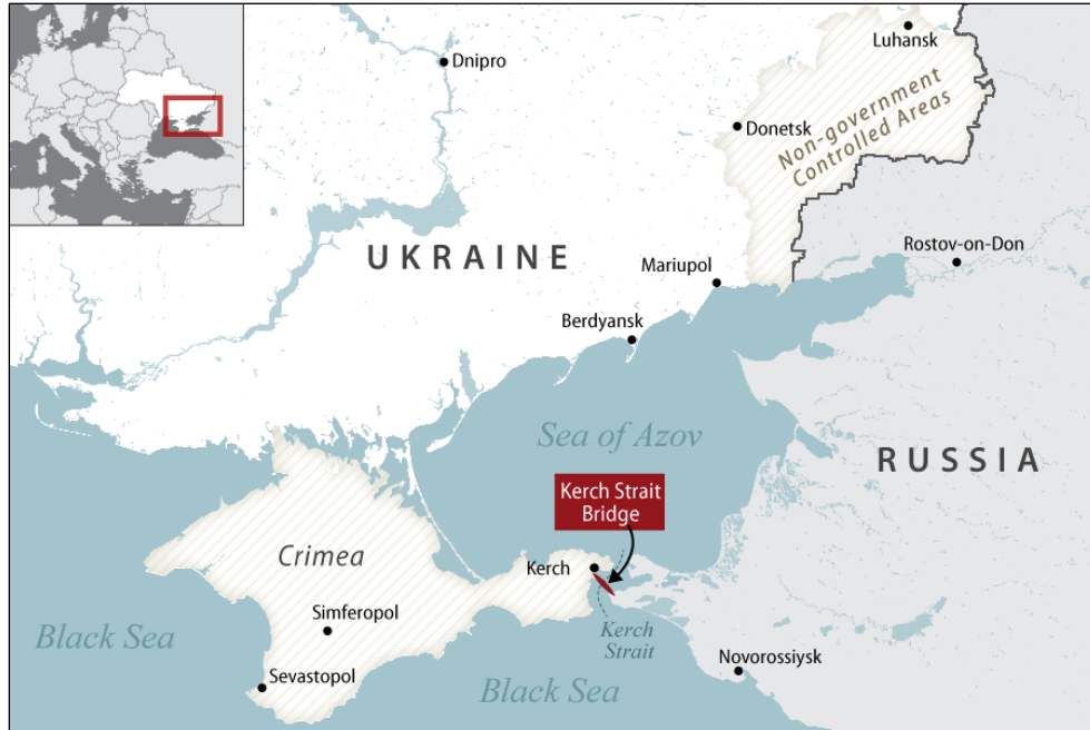
Figure 4. Southern Ukraine and the Sea of Azov