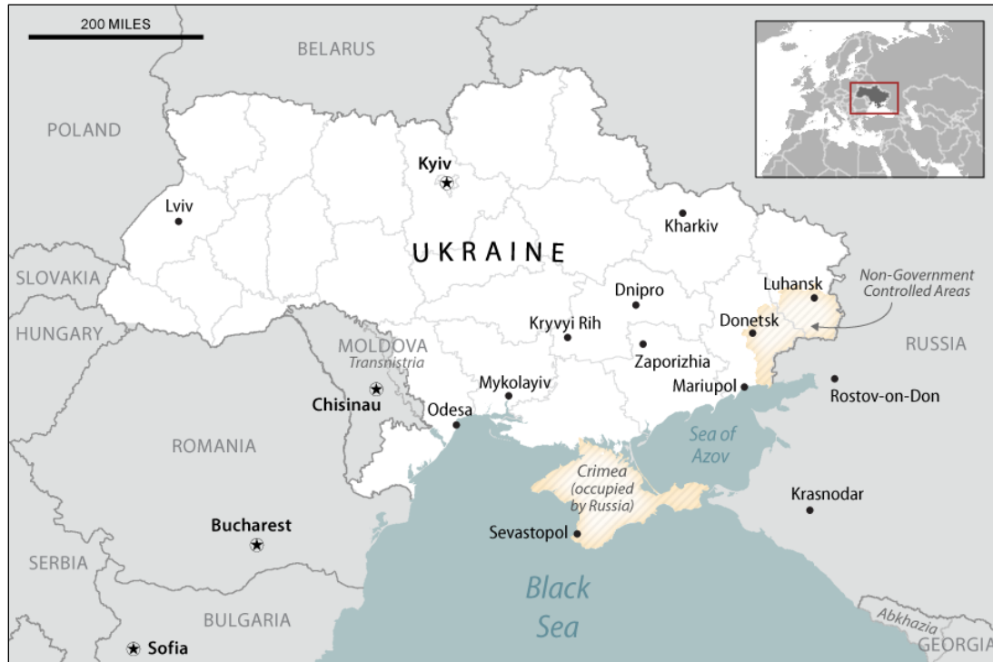
Figure 3. Ukraine