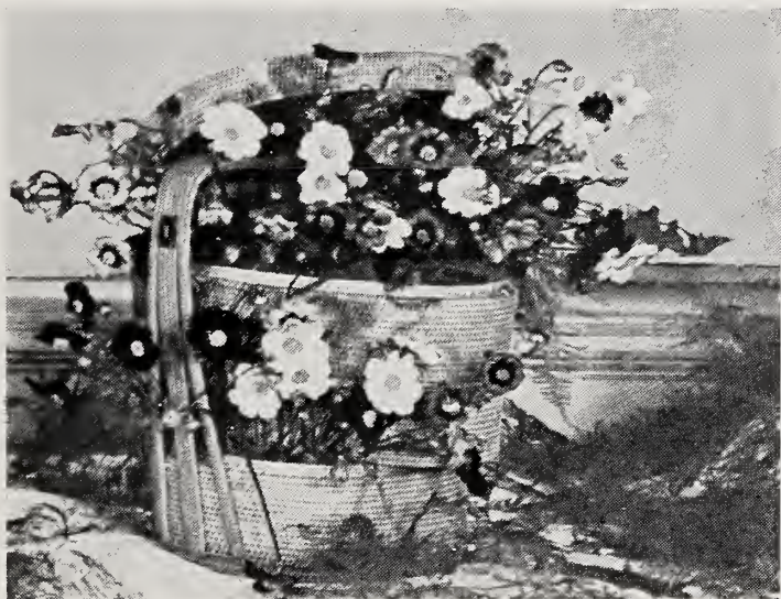
Basket of European Single Dahlias.

These miniature Dahlias are indescribably beautiful and have remarkable color combinations. Our basket of these delightful Single Dahlias won First Prize at the recent Hotel Oakland Show.