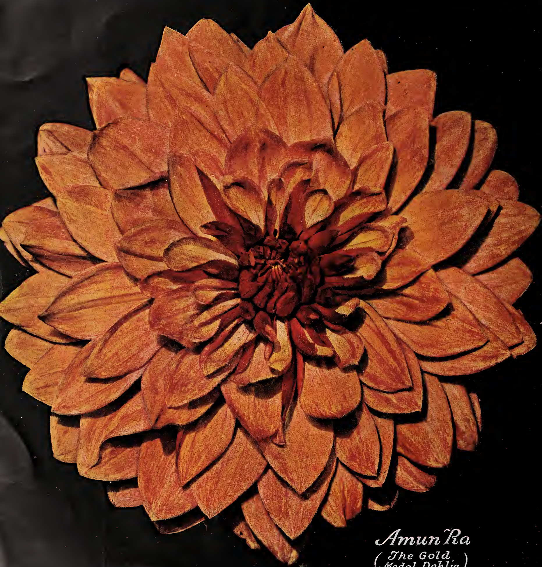
Amun Ra (The Gold Medal Dahlia)