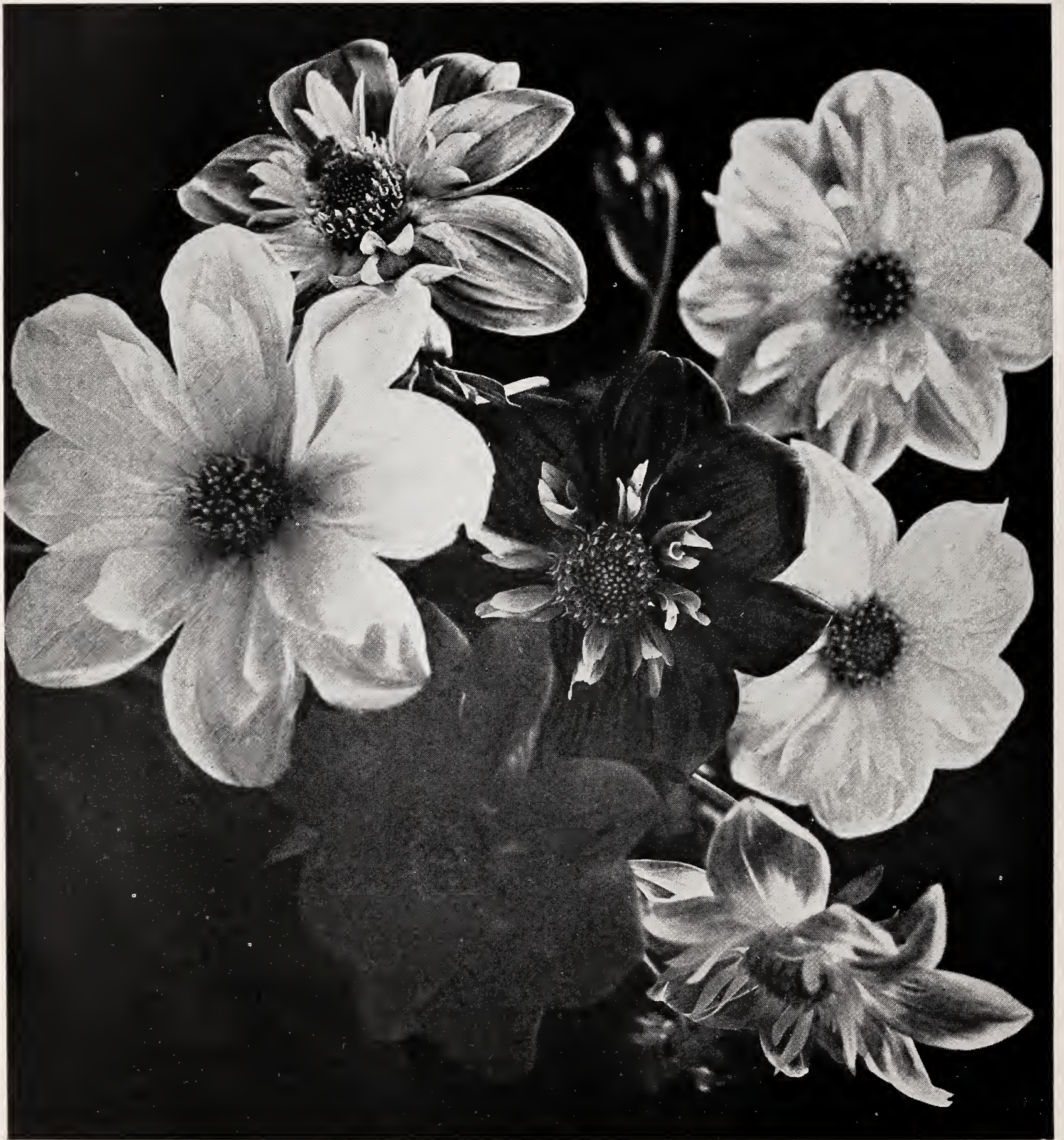
Collarette Dahlias—The Newest Introduction in Dahlias For description see pages 17 and 19