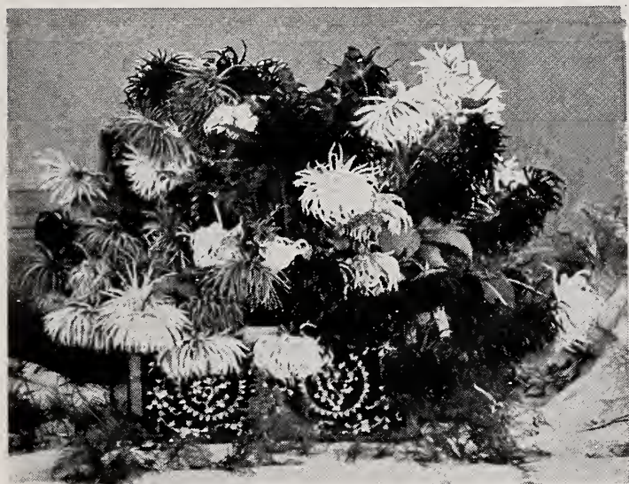
Chest of Cactus Dahlias.

Alabaster —The finest white Cactus. Large and incurved. An indispensable exhibition variety, beautiful for garden and a fine cut-flower. $1.00.