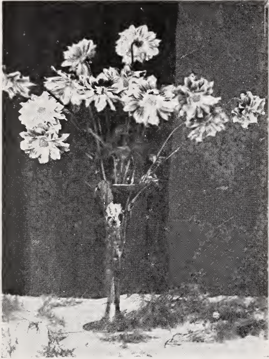
Vase of Peony Dahlias

The Peony or Art Dahlias are of recent introduction, and are extremely popular. Flowers are large, having two to five rows of petals, very broad, and artistically twisted and curled. They usually show the golden center, and have small curling petals clustered around it. They are free flowering, and their long, straight stems make them a beautiful growing and cutting variety.