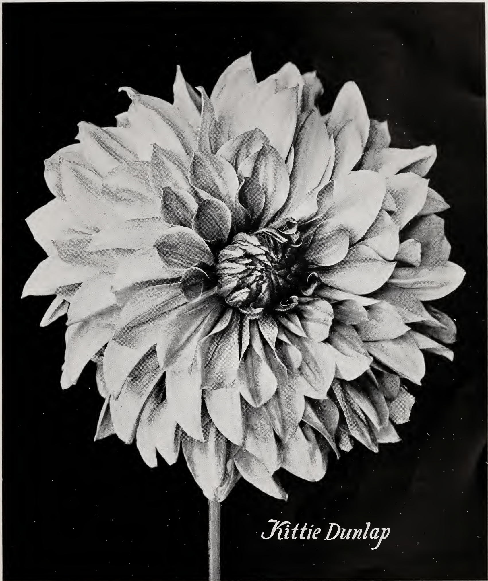
Decorative Dahlia "Kittie Dunlap." For description see opposite page