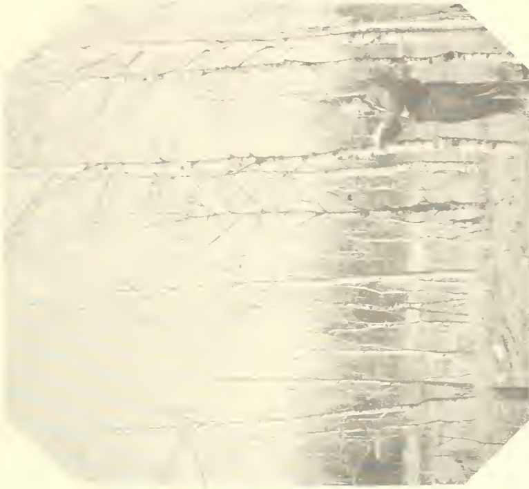
Figure 3.--The poorest site encountered in the study. The dominant trees averaged 42 feet tall at 47 years of age which represents a site index of 43 at age 50.