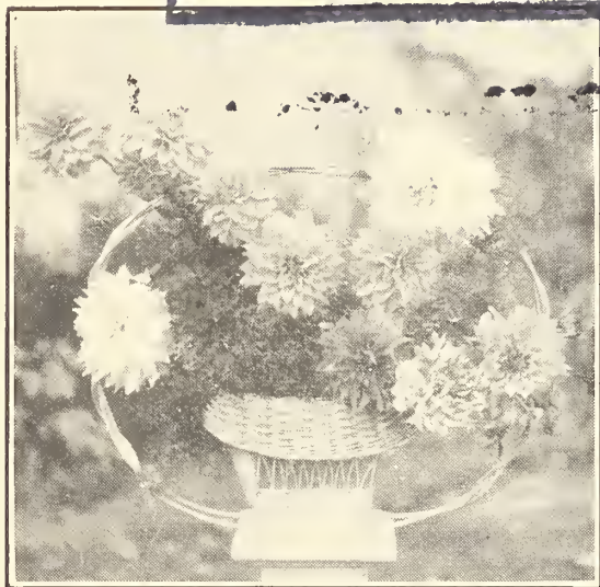
Some 1930 Beauties

LIBRARY RECEIVED ★ FEB 20 1931 ★ U. S. Department of Agriculture.