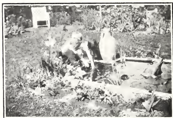
Fishing for Tadpoles

We will have many fine varieties of Perennials for your spring planting. Come and pick out what you want and take them with you. It is much easier on the plants and more sure to grow.