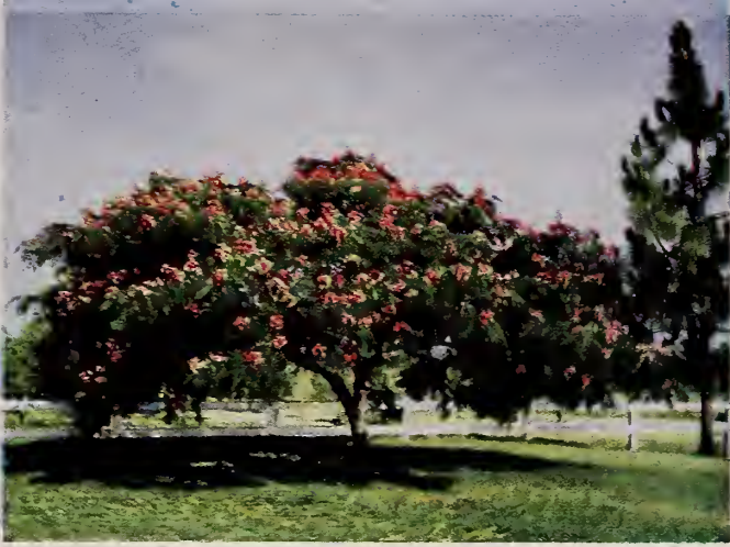
MIMOSA . . . See Page 10