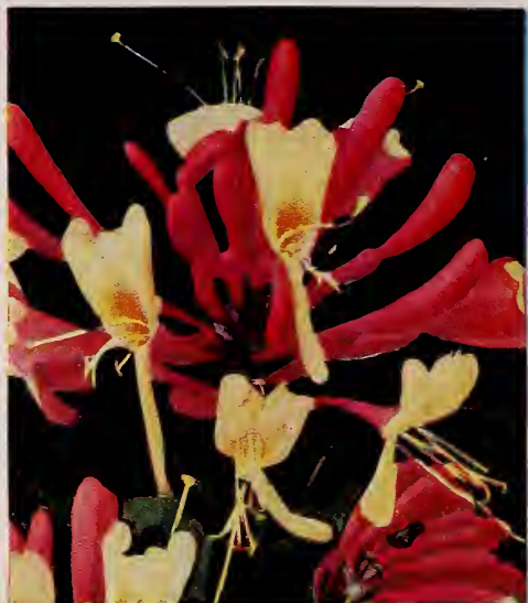
HECKROTTI LONICERA . . . See Page 35