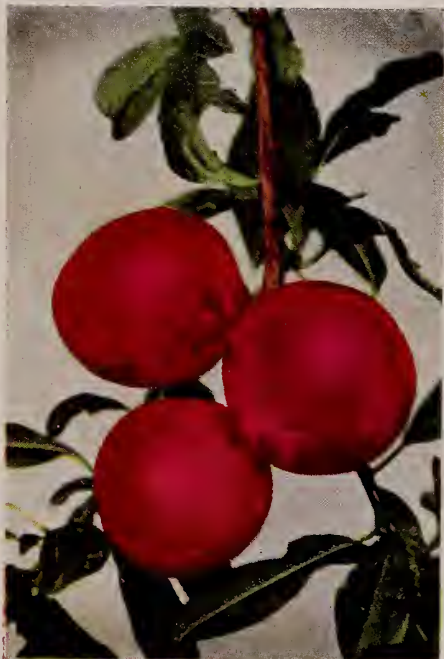
BURBANK PLUM... See Page 3