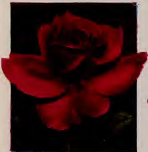
ETOILE DE HOLLANDE