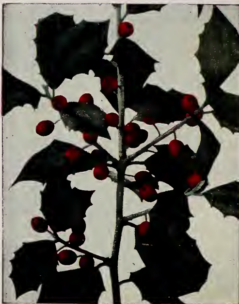
ILEX HOLLY . . . See Page 23