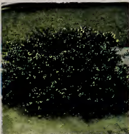
BERBERIS JULIANAE (See Page 15)