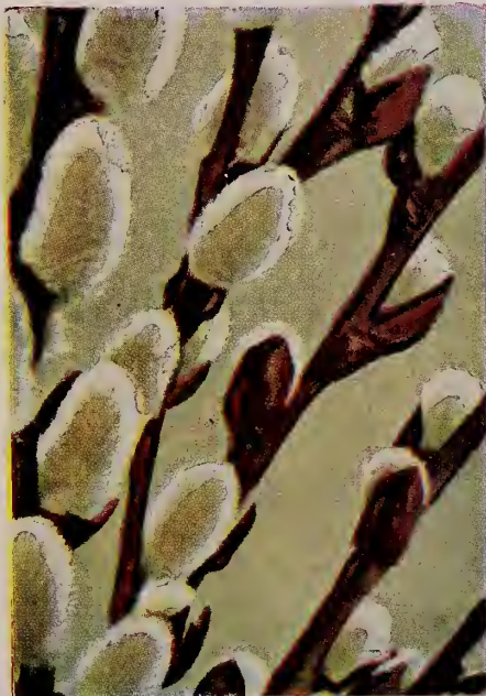
SALIX DISCOLOR ( Pussywillow ) (See Page 7)