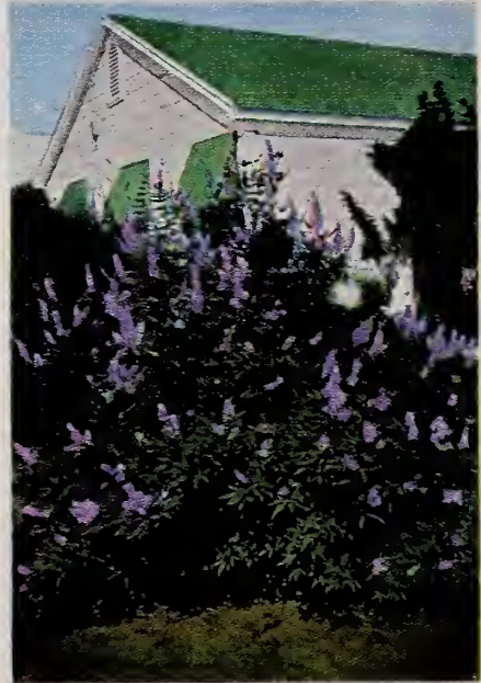
VITEK . . . See Page 11)