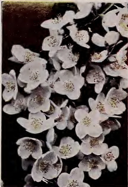
PHILADELPHUS (Mock Orange) (See Page 7)