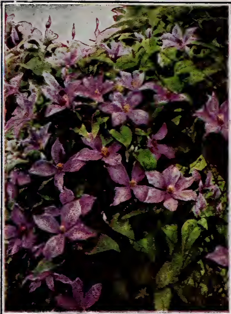
CLEMATIS JACKMANI . . . See Page 34