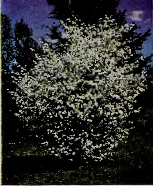
WHITE FLOWERING DOGWOOD (See Page 10)