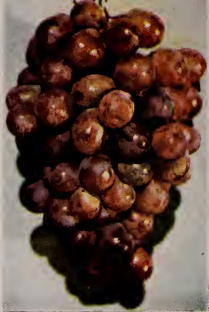
CACO . . . See Page 4