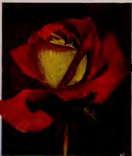
CONDESA DE SASTAGO