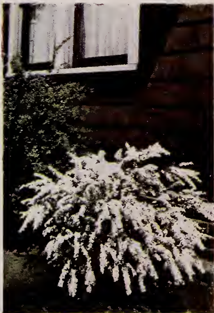
SPIREA VANHOUEITE (See Page 7)