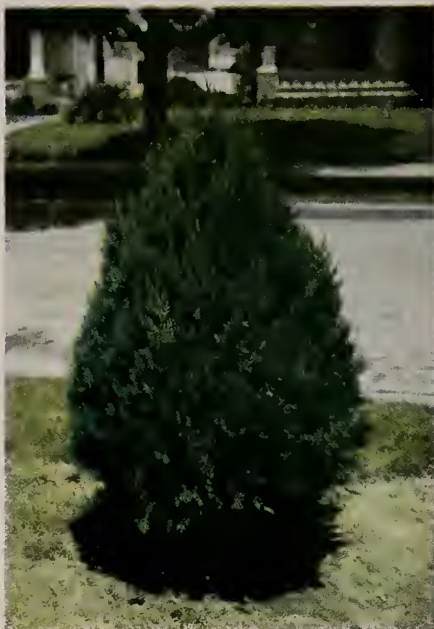
THUJA AUREA NANA