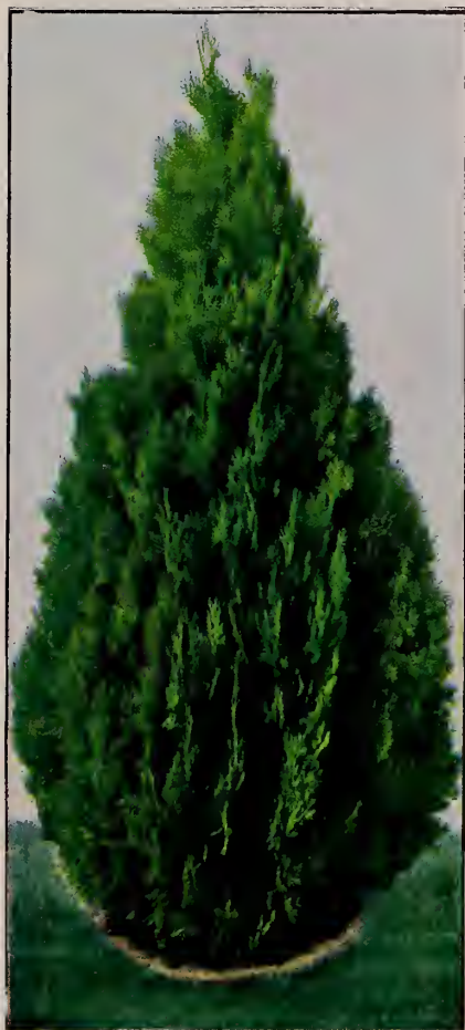
THUJA BAKER (See Page 34)