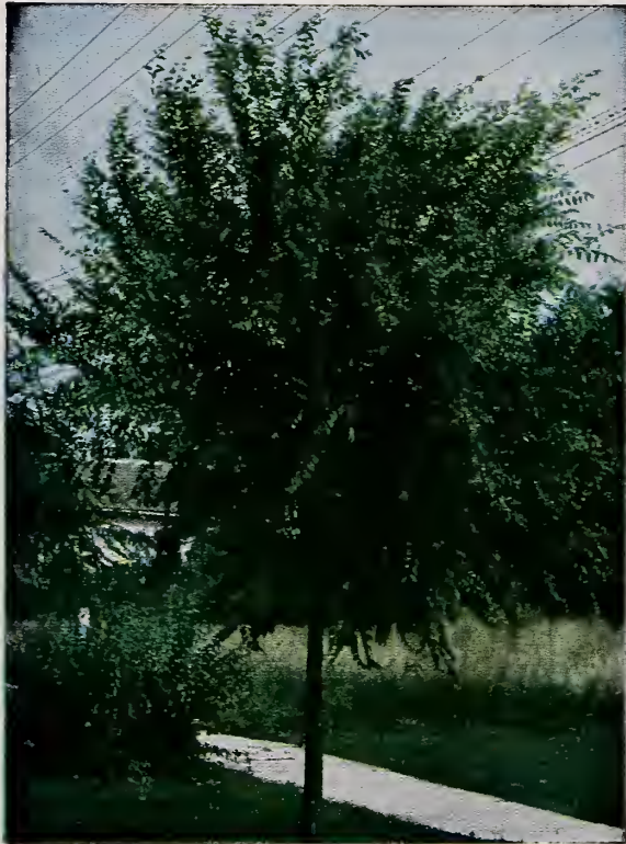
CHINESE ELM . . . See Page 12