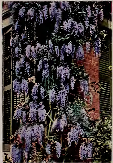
PURPLE WISTARIA . . . See Page 35