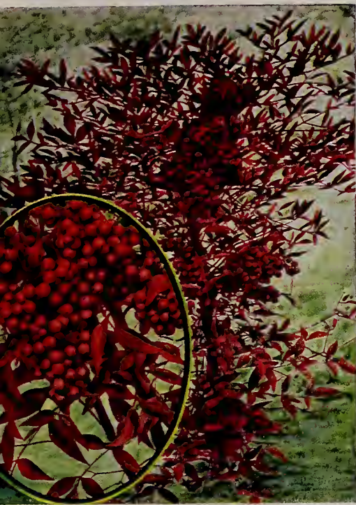
NANDINA DOMESTICA . . . See Page 27