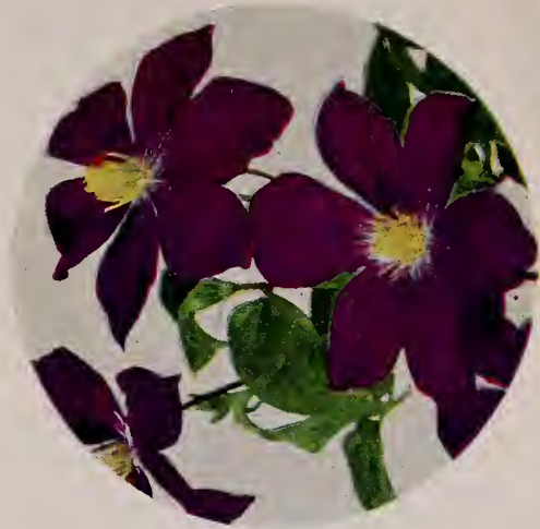
CLEMATIS EDOUARD ANDRE