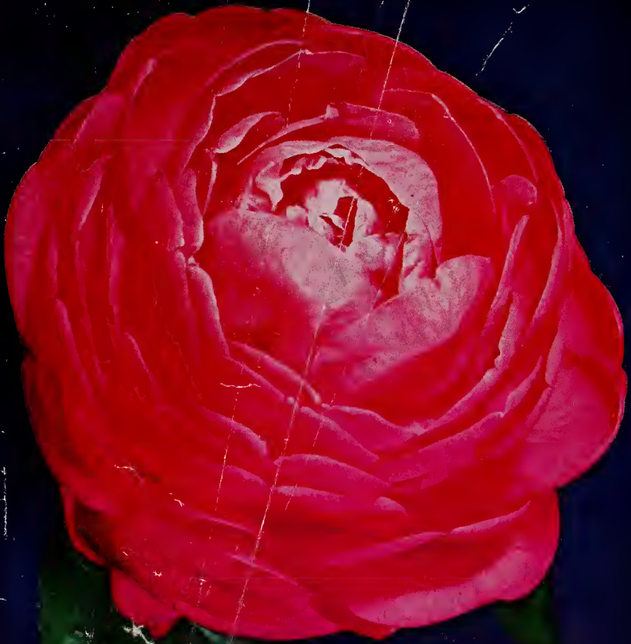
Camellia Japonica - American Girl