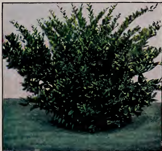
LIGUSTRUM LUCIDUM . . . See Page 26

A LIST OF EVER- GREENS SUITABLE FOR VERY SHADY LOCATIONS