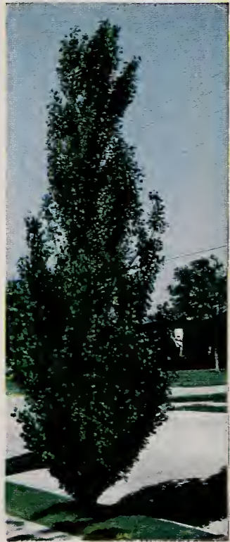
LOMBARDY POPLAR . See Page 11