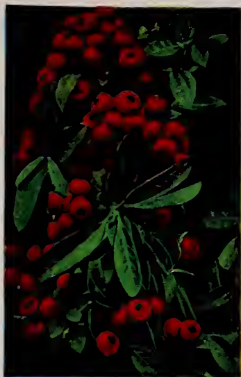
PYRACANTHA FORMOSANA (See Page 28)

Please remember, our Nursery is open every day except Sunday.