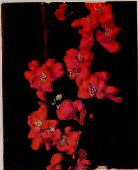
CYDONIA—Japan Quince . . . See Page 6