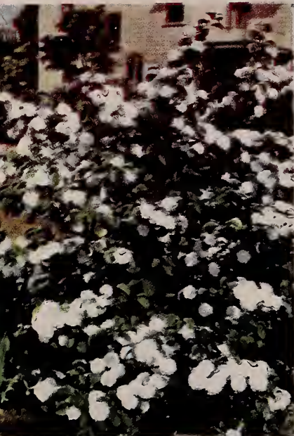
SNOWBALL (See Page 8)