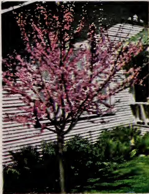
PRUNUS CAMPANULATA . . . See Page 11)

Ulmus pumila (Dwarf Asiatic Elm), 50 ft. Introduced from China. Rapid grower and far superior to U. americana . Very hardy and disease-resistant. Each 8 to 10 ft. (Wt. 25 lbs.) $4.00 6 to 8 ft. (Wt. 20 lbs.) 3.00 5 to 6 ft. (Wt. 15 lbs.) 2.50