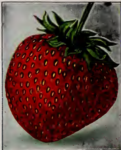
STRAWBERRY . . . (See Page 3)