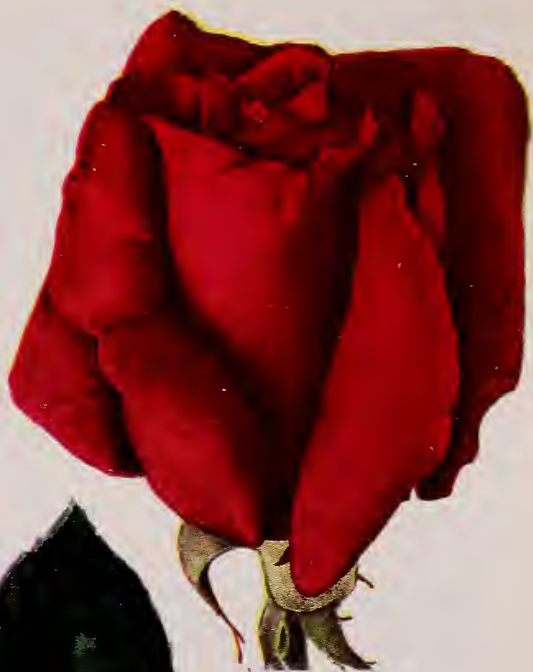
CHRYSLER IMPERIAL (Plant Patent No. 1167) (See Page 43)