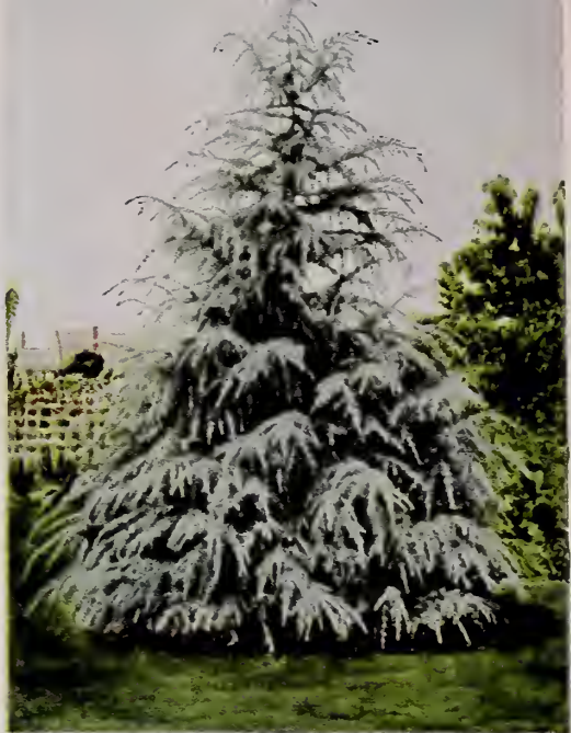
CEDRUS DEODARA . . . See Page 30

Due to increased shipping costs, no order will be accepted for less than $3.00.