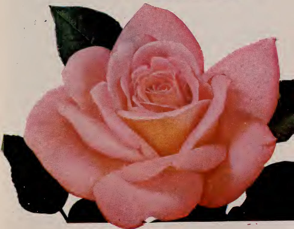
HELEN TRAUBEL (Plant Pat. 1028) (See Page 43)