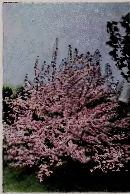
CREPE MYRTLE . . . See Page 10