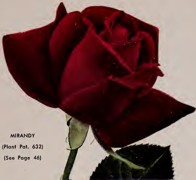
MIRANDY (Plant Pat. 632) (See Page 46)