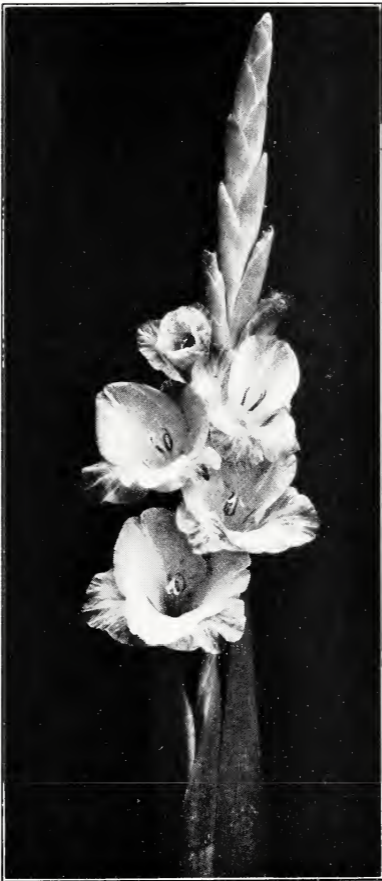
Marshal Foch (K)