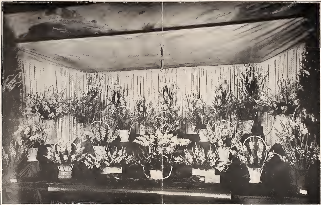
This Display was awarded the Gold Medal by the Massachusetts Horticultural Society at Boston Horticultural Hall in August, 1928.