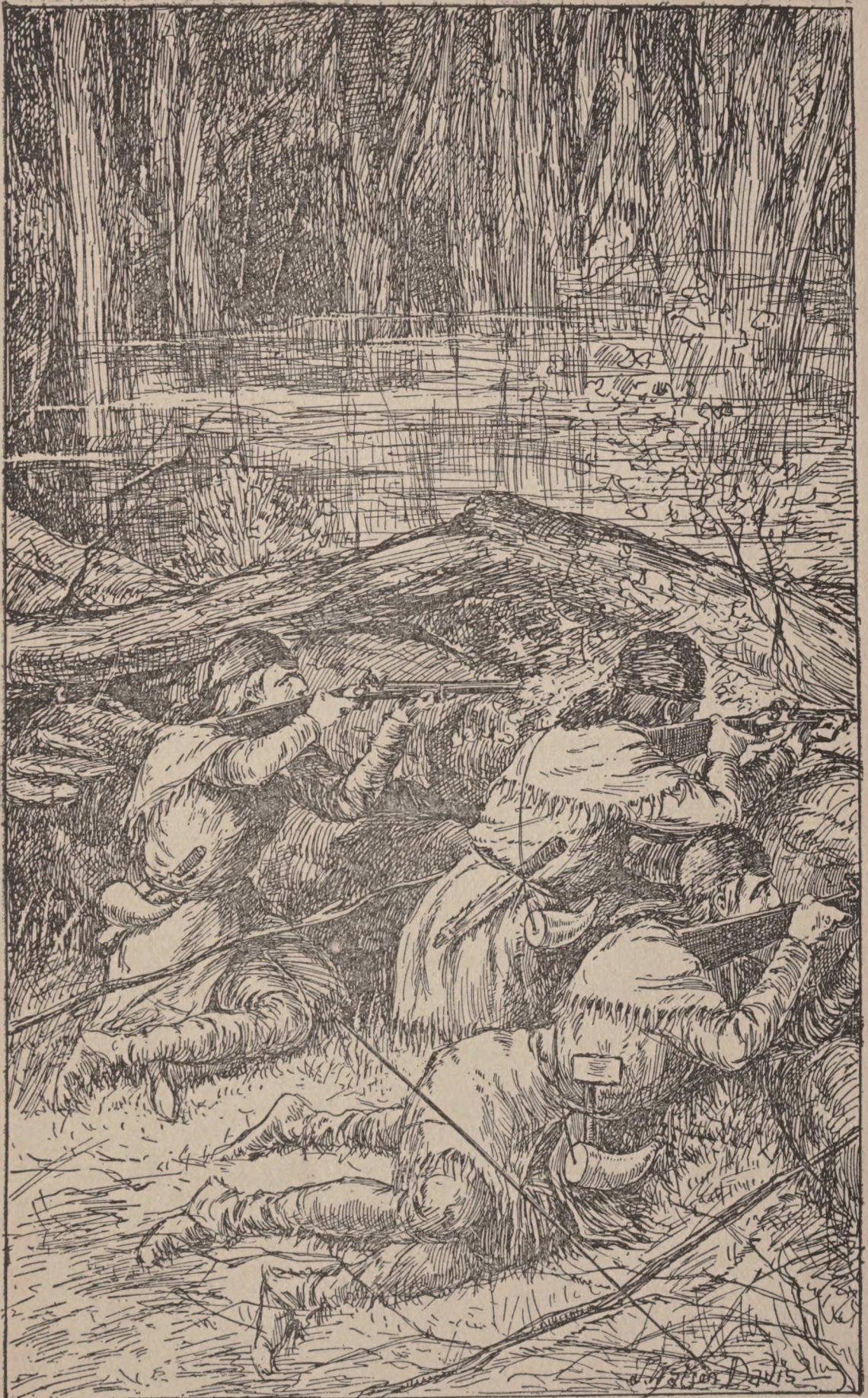
From out of our barricade whistled three bullets, and every one found its mark. Page 259. On the Kentucky Frontier.