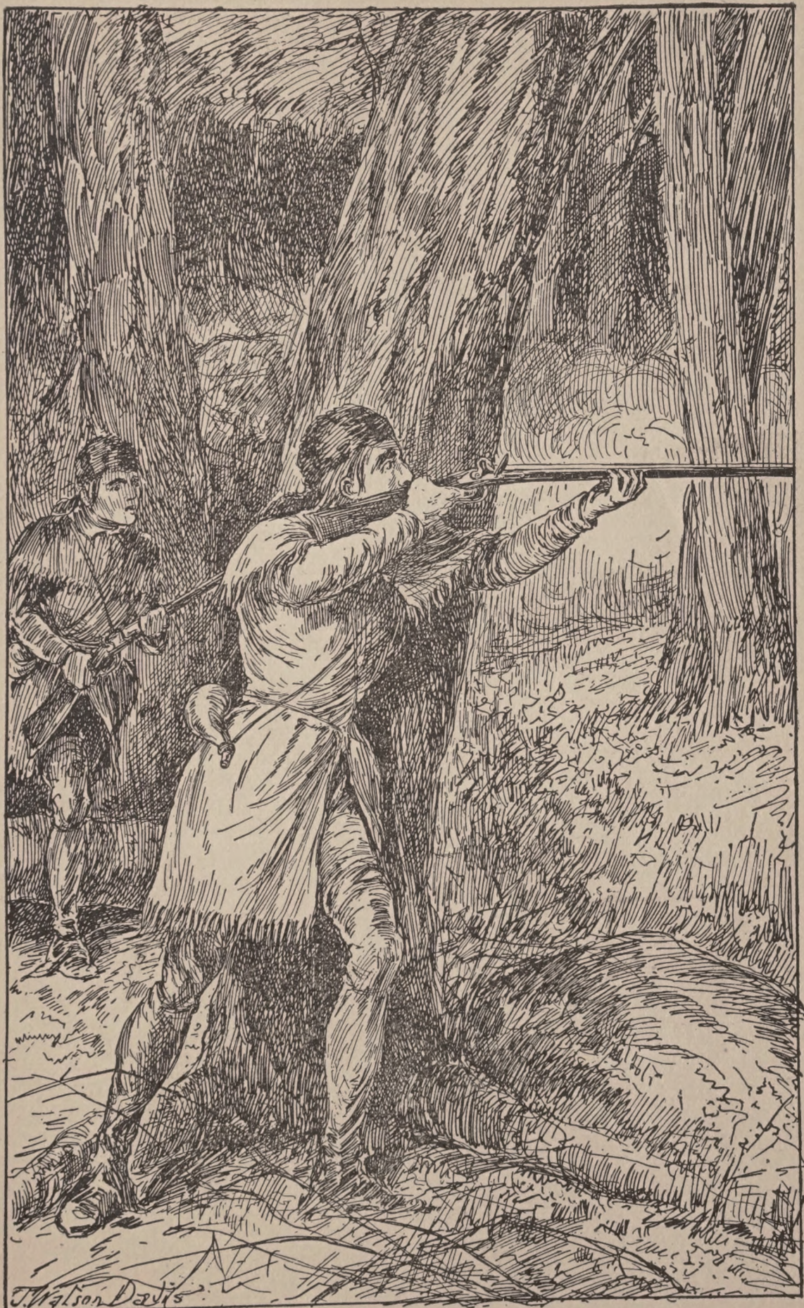
We advanced from one place of shelter to another, firing rapidly.—Page 142.