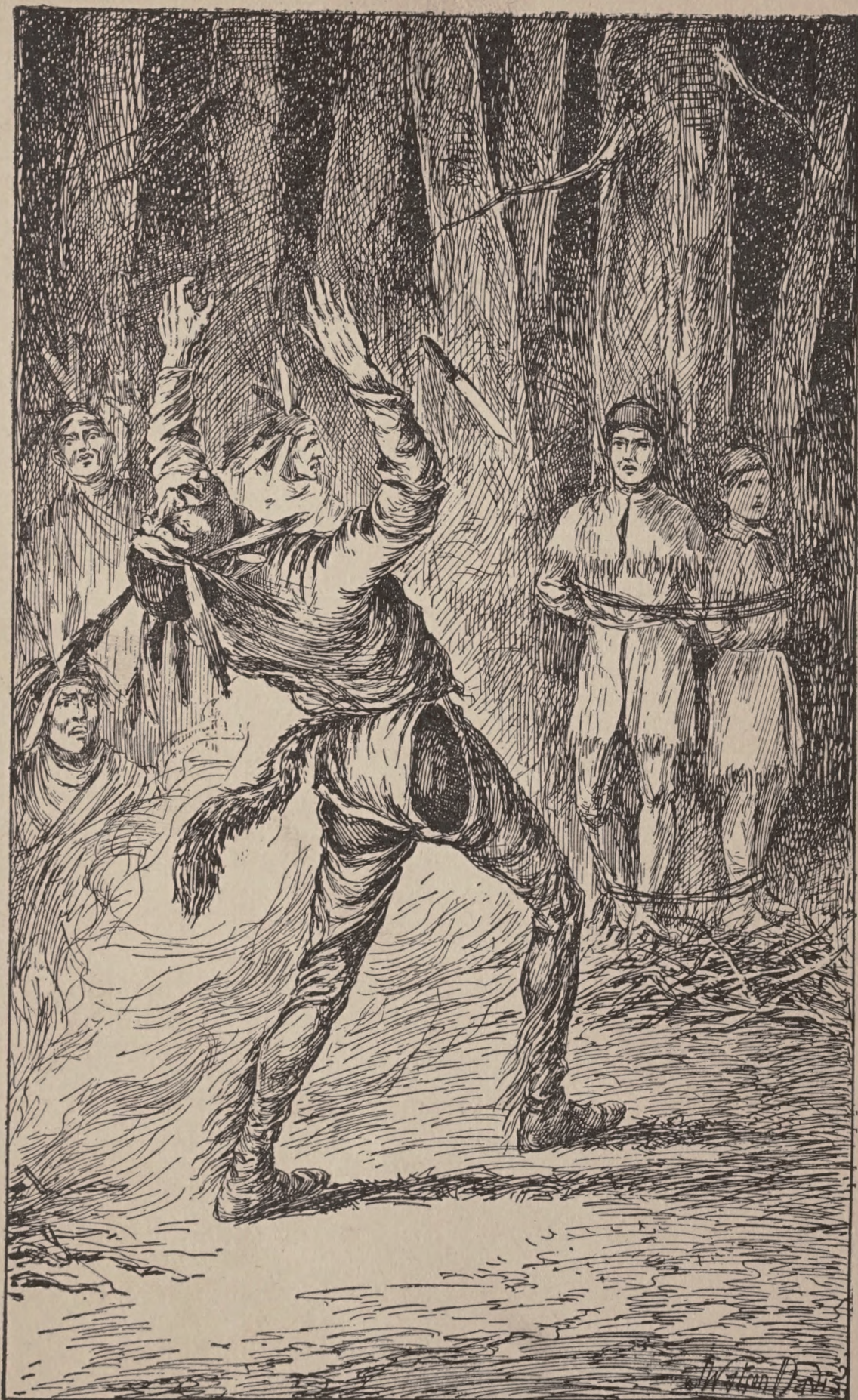
The brute fell as though struck by lightning, and a cry of triumph rang from my lips.—Page 62. On the Kentucky Frontier.