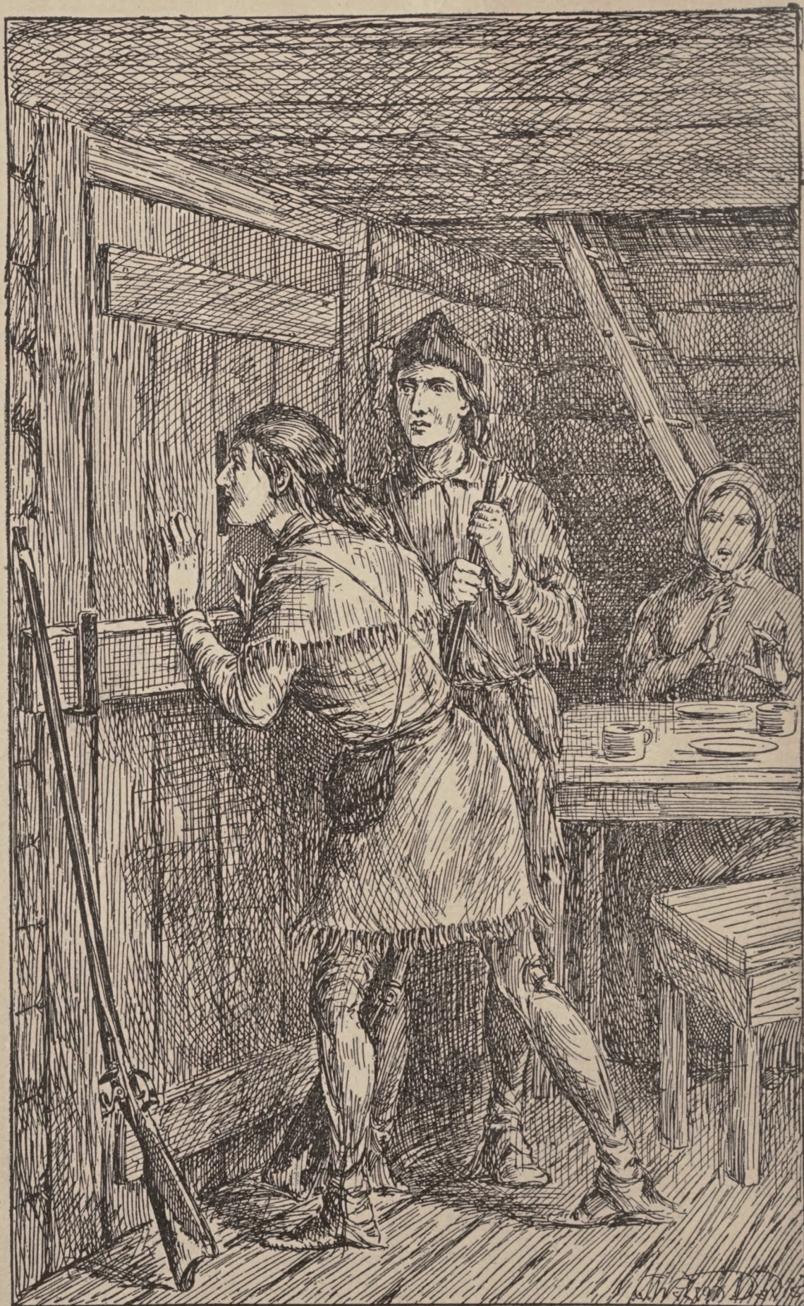
In a twinkling I was by his side, and there saw that which caused the cold chill of fear to run down my back.—Page 40. Frontis. On the Kentucky Frontier.