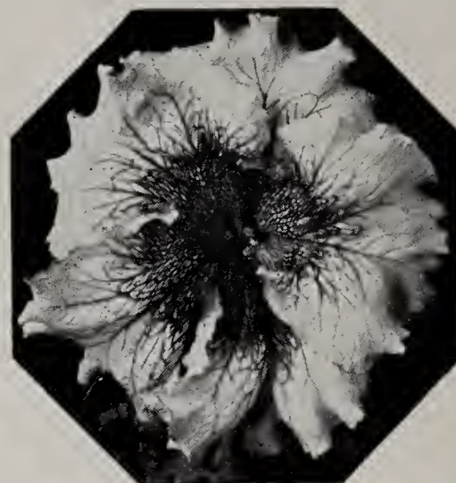
Petunia—Improved Dwarf Giants of California