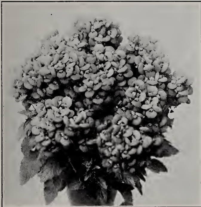
Calceolaria Valentine Greeting