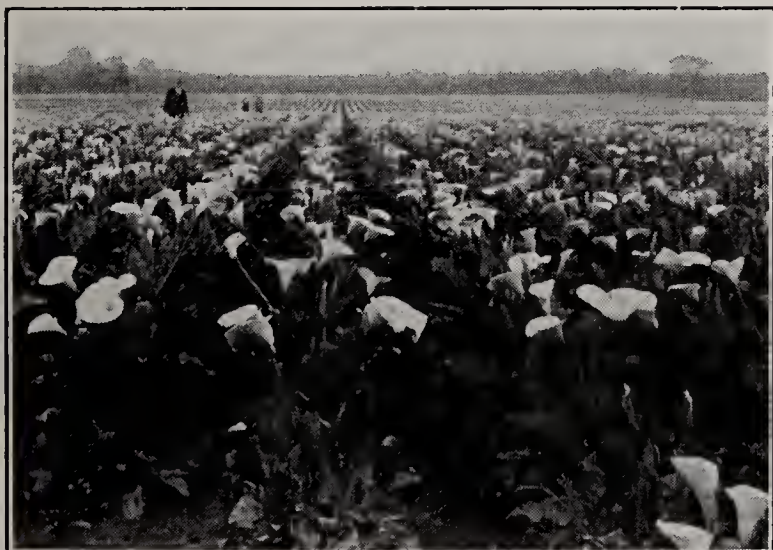
Some of our Callas "at home in the Northwest"

A Lily like fragrant Glad. Lemon yellow flowers on wiry stems 30 to 48 inches long. An ideal cut flower that keeps well. A beautiful novelty. Grown like Freesias.