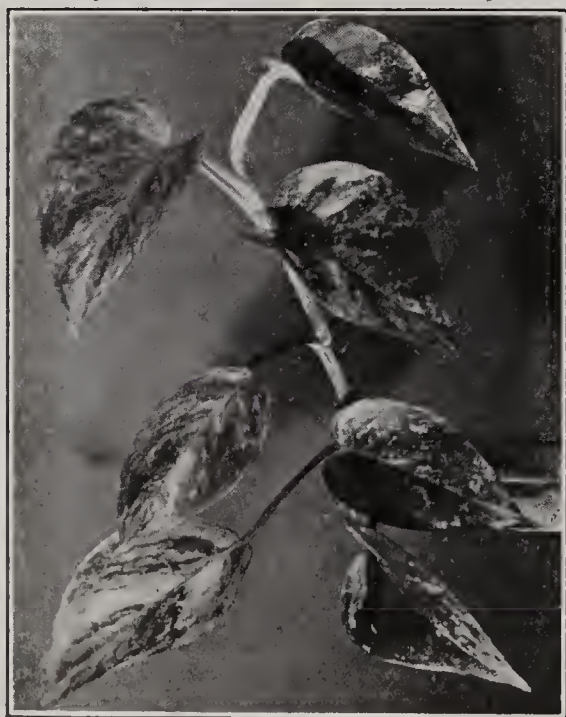
Pothos Aurea (Variegated Philodendron)