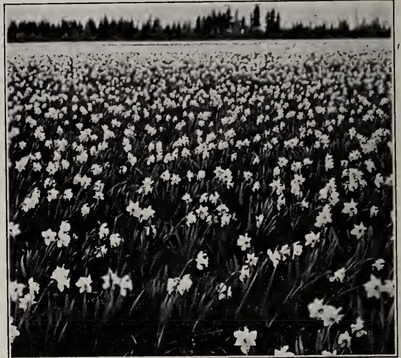
What our Daffodil grower sees from his window

Imperator. Bloemaard. Poggenbeek. Yellow Queen and all other successful varieties.