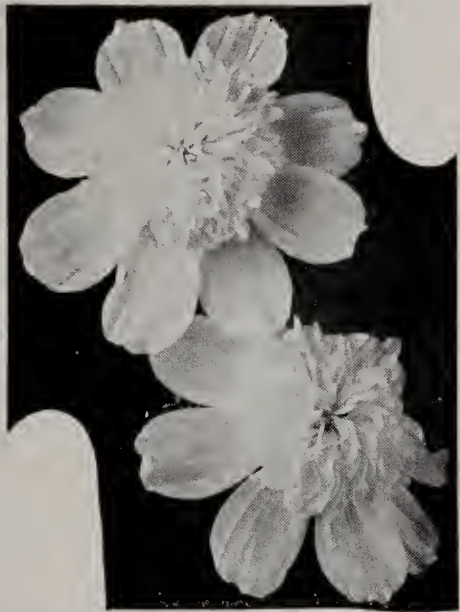
Cosmos—Early Crested White