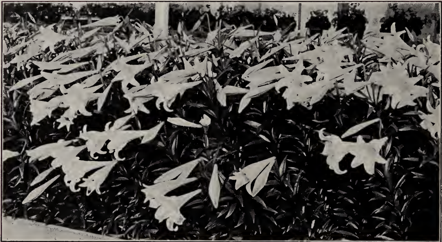
S.S.S. LILIUM HARRISI FOR THANKSGIVING

When it happens on schedule every year, it does not just happen.