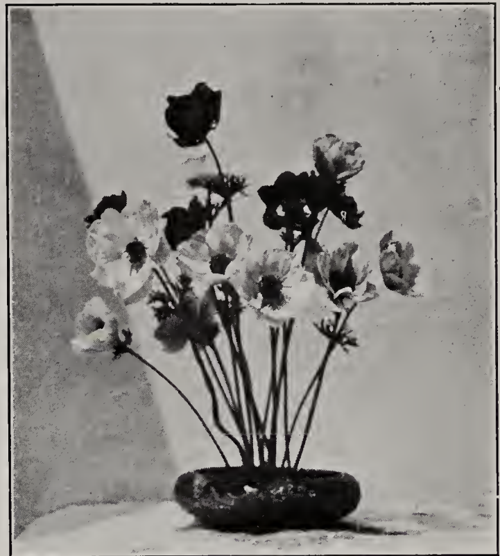
Anemone De Caen Hybrids