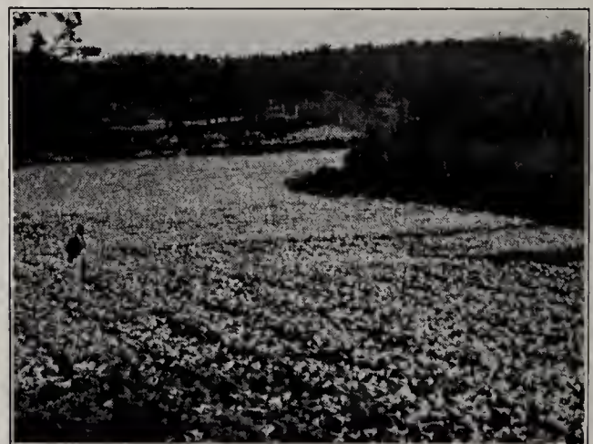
A Glimpse of Easter in Bermuda

Gloria, Clear Rose Pink. Gladstone. White. Queen Alexandra. Lilac. America. Lilac Rose. Rubens. Deep Rose. Deutschland. White. Peach Blossom. Princess Mary. Deep Rose Pink.