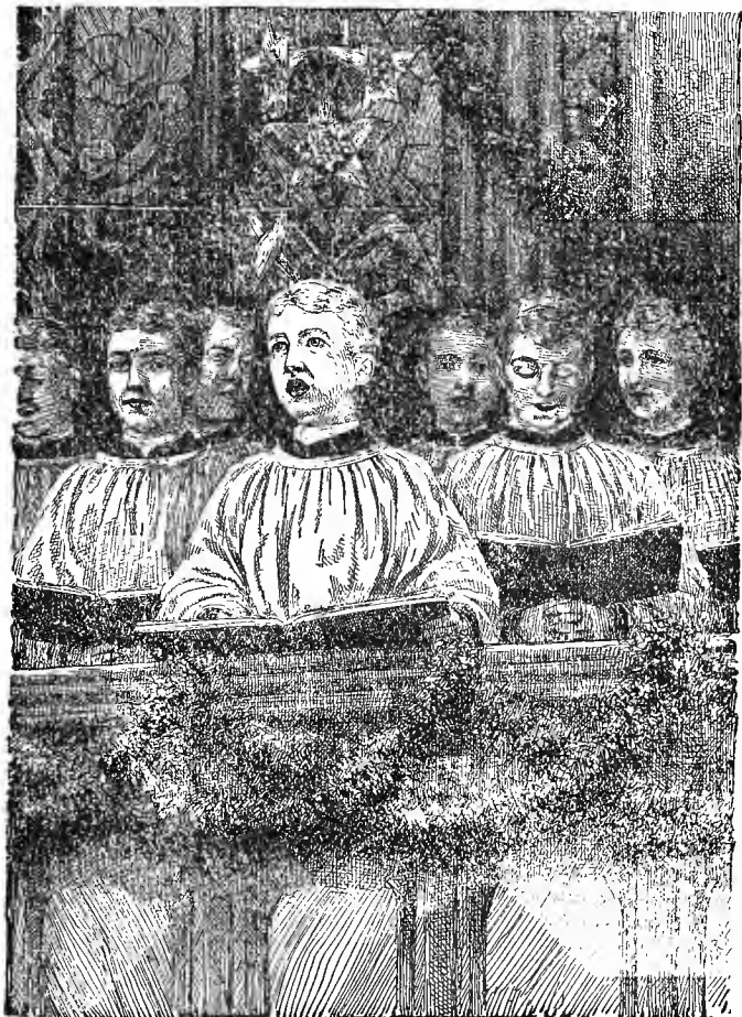
"MY AIN COUNTREE"