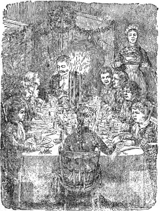
"THE RUGGLESES NEVER FORGOT IT"