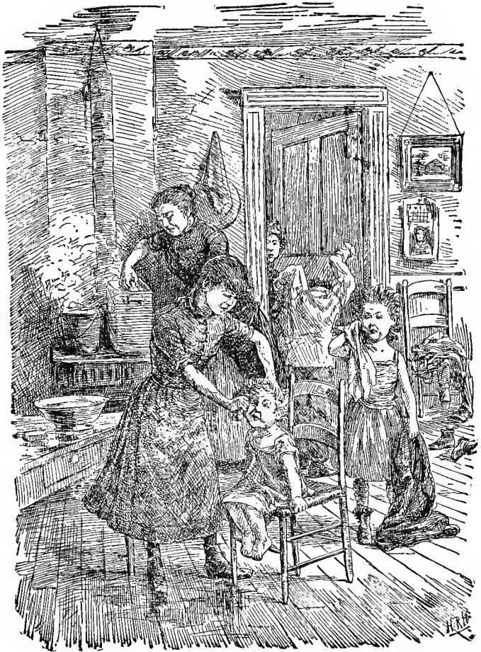
"THE LITTLE RUGGLESSES BORE IT BRAVELY" (Page 36)