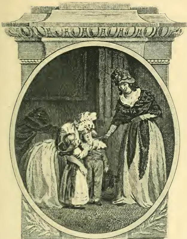
AMELIA. The affecting interview between Amelia and her children on their being brought to her during their father's imprisonment.