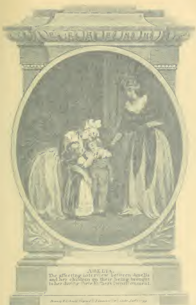
AMELIA. The affecting interview between Amelia and her children on their being brought to her during their Father's imprisonment.