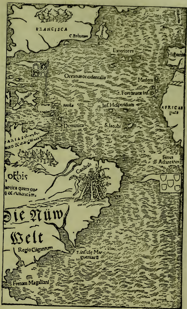
map, 1540. 1