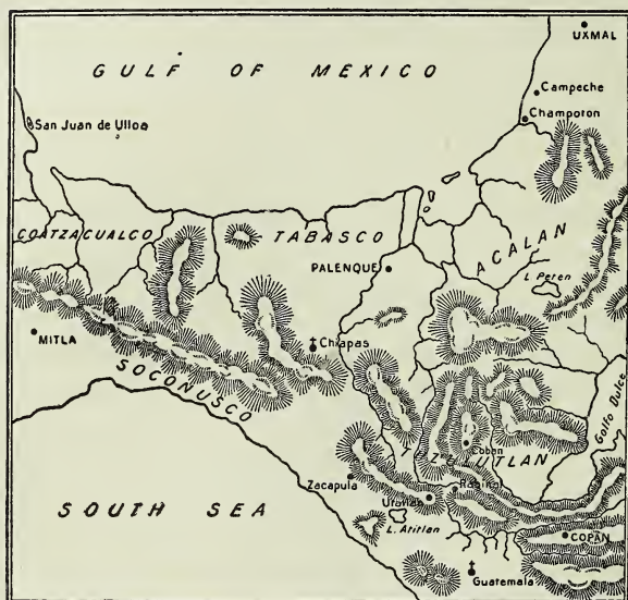
Tuzulutlan, or the "Land of War."

three times had been hurled back in a very dilapidated condition. It could hardly be called a promising field, but this it was that Las Casas chose for his experiment. 1