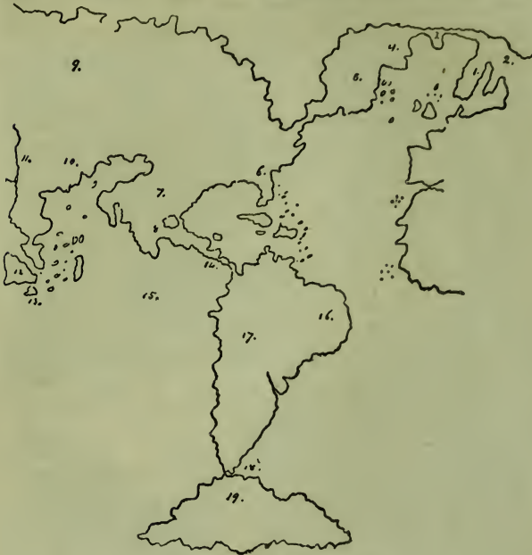
Gastaldi's Carta Marina, 1548. 1

Sebastian Münster, published in the Ptolemy of 1540. Though thus published eight years earlier than Gastaldi, this map represents in some respects