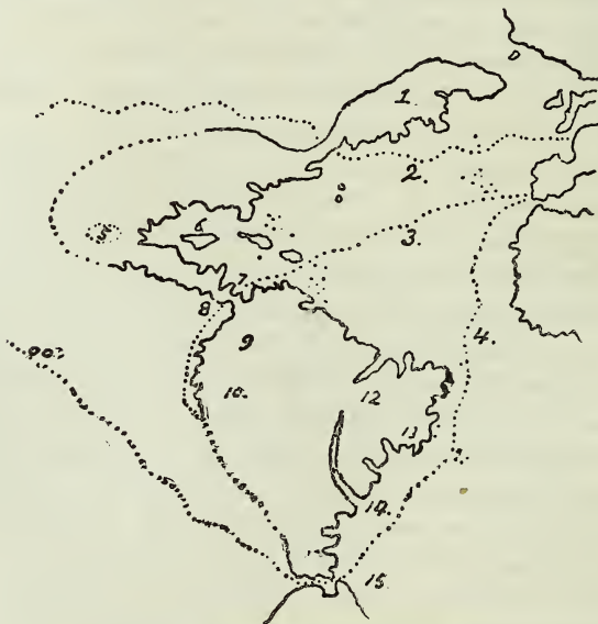
Sketch of Agnese's map, Venice, 1536. 1

appears to the north of Florida. Here, therefore, it does not afford a ready means of access to China, but to some northern ocean washing the shores of an "Upper India," concerning which it may be suspected that the map-maker's ideas were not of the clearest.