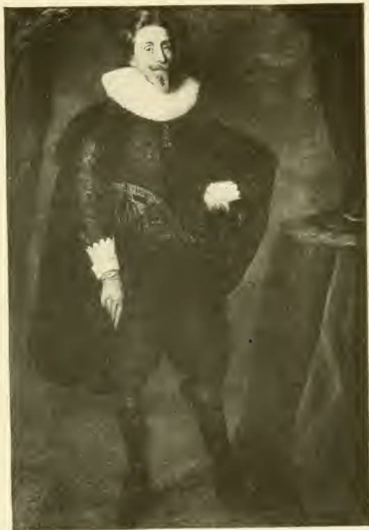
George Calvert, 1st Baron of Baltimore, who was granted the Province of Maryland by Charles the First, for his services to England. He navigated up the coast of Maryland while in the Virginia Colony, but returned to England and died before he could send colonists to his new land, which he called "Terra Mariae" (Maryland), in honor of the Queen.