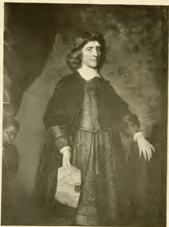
Cecilius Calvert, 2nd Baron of Baltimore, and Founder of The Province of Maryland. He sent the first colonists to his new Province in 1634, after the death of his father, George Calvert.