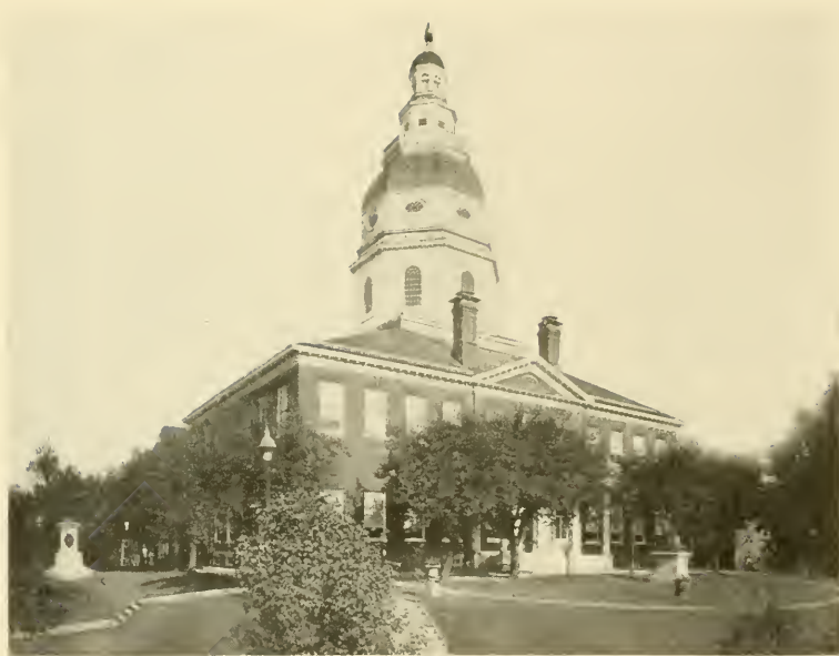
The State House of Maryland, built in 1772. In it is the celebrated Senate Chamber where General Washington surrendered his commission to Congress after the Revolutionary War, on December 23rd, 1783.