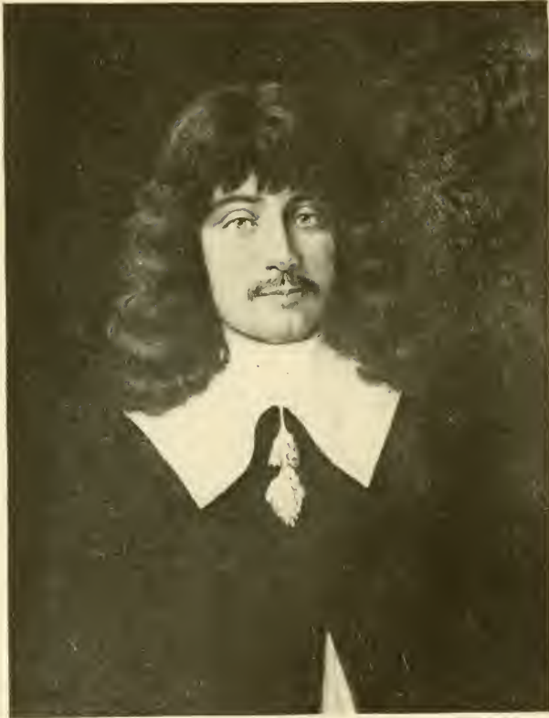
Leonard Calvert, brother of Lord Baltimore, who brought the first colonists to Maryland in the ships The Ark and The Dove , in 1634, and was made the First Governor of Maryland.