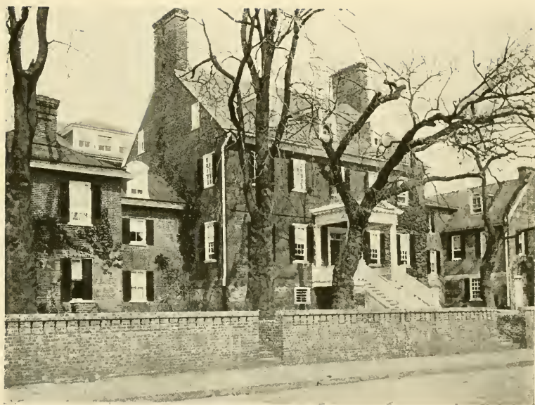
The Paca House, now Carvel Hall Hotel, was built in 1763, by Governor William Paca, who was one of the four Signers of The Declaration of Independence for Maryland.