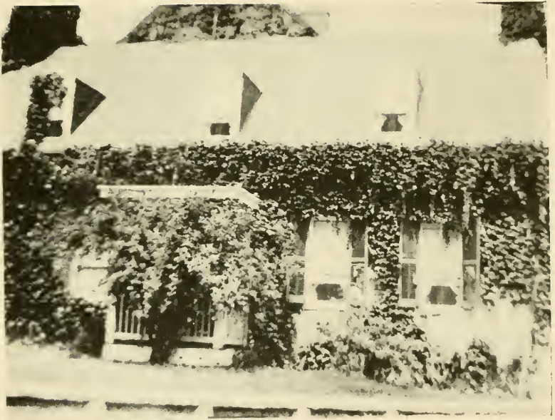
One of the wings of the Brice House, built in 1750. It is now used as a separate dwelling, corner Prince George and East Streets.