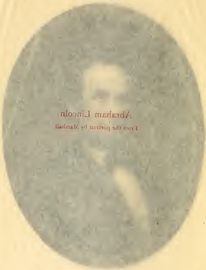
Abraham Lincoln From the portrait by Marshall