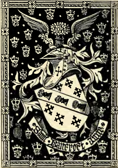
ROCKFORD WILMINGTON, DELAWARE.