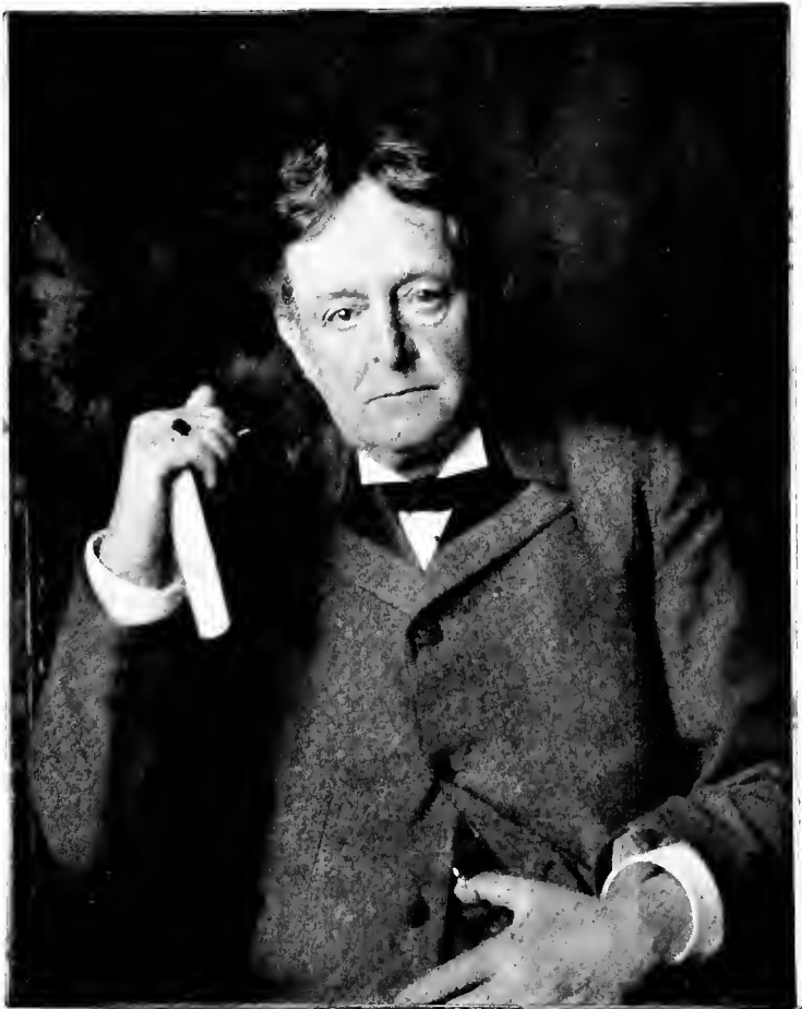
Joseph H. Choate