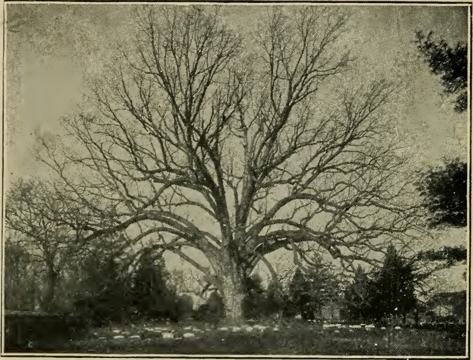
FAMOUS OLD OAK West Broadway, Salem, New Jersey