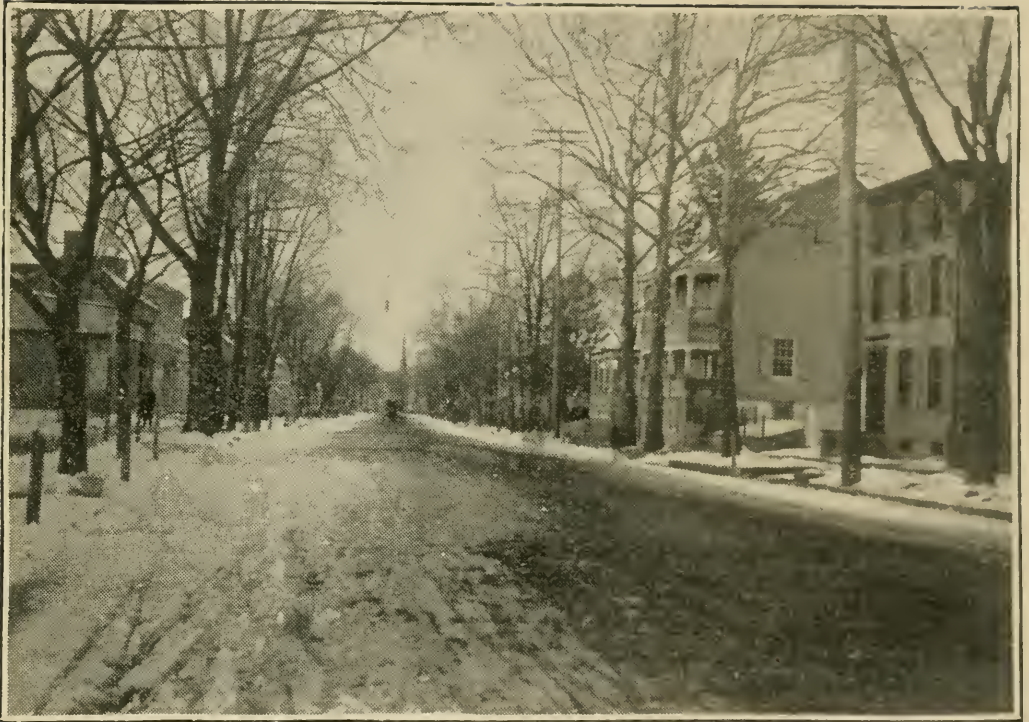
PENNY HILL, SALEM, N. J.