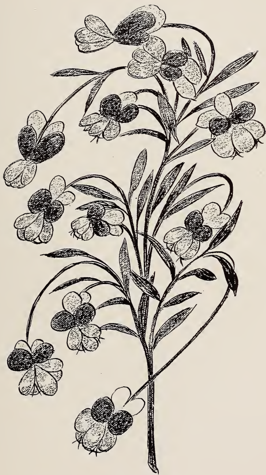
A Flower of Ento, Name Unknown.