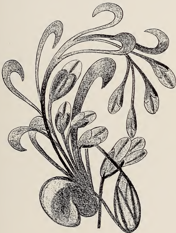
Rosera—an Ento Plant not found on Earth.