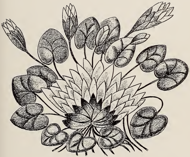
Rodel—the National Flower of Mars, Emblematic of Life and Death.