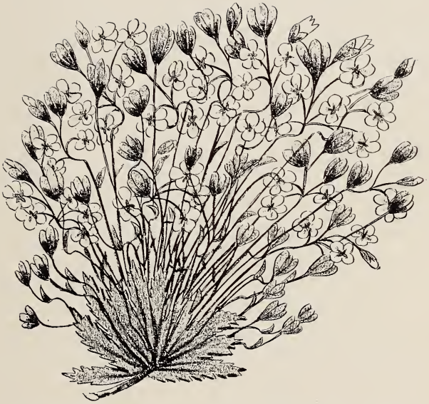
Valseta—A Flower of Mars used as an Altar Offering.