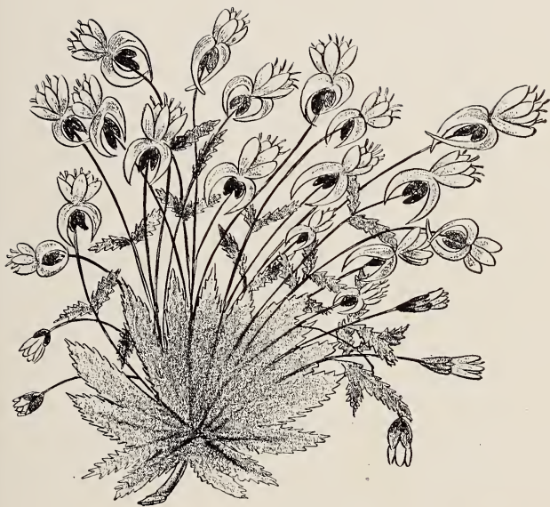
Tsoina—An Ento Plant which serves as an Altar Offering. It is looked up as sacred.