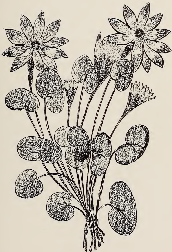
A Flower of Ento, Name Unknown.