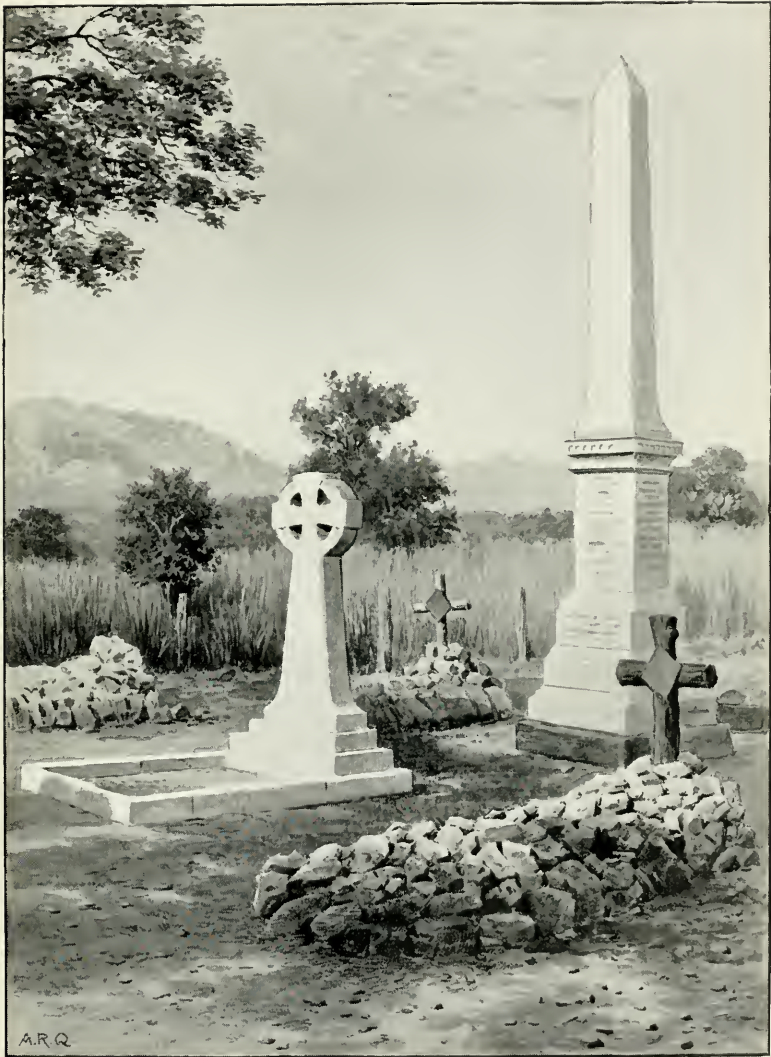
HUBERT HERVEY'S GRAVE.