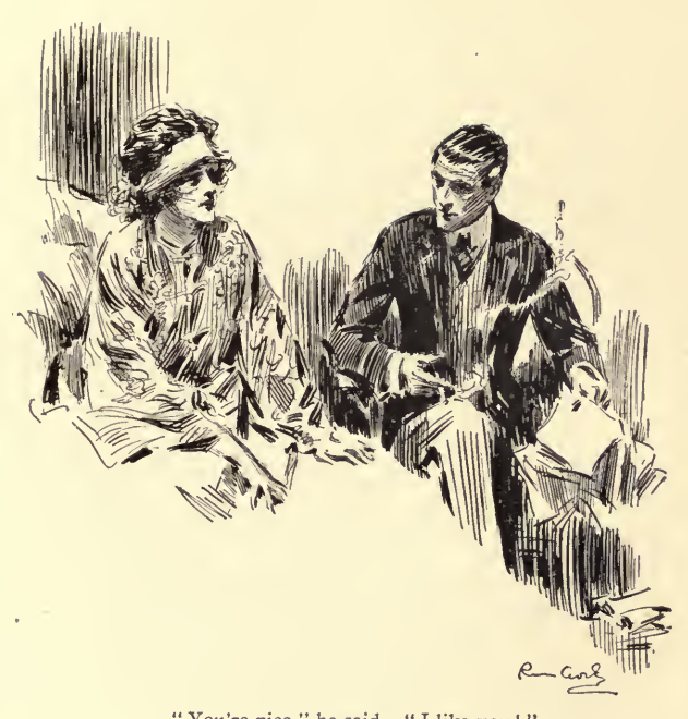
"You're nice," he said. "I like you!"