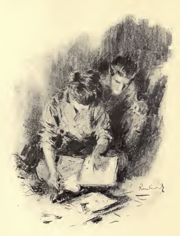
"Your PAPER-DOLL BOOK?" stammered Barton