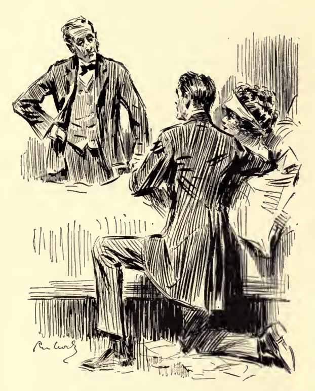
"Any time that you people want me," suggested Edgarton's icy voice, "I am standing here—in about the middle of the floor!"