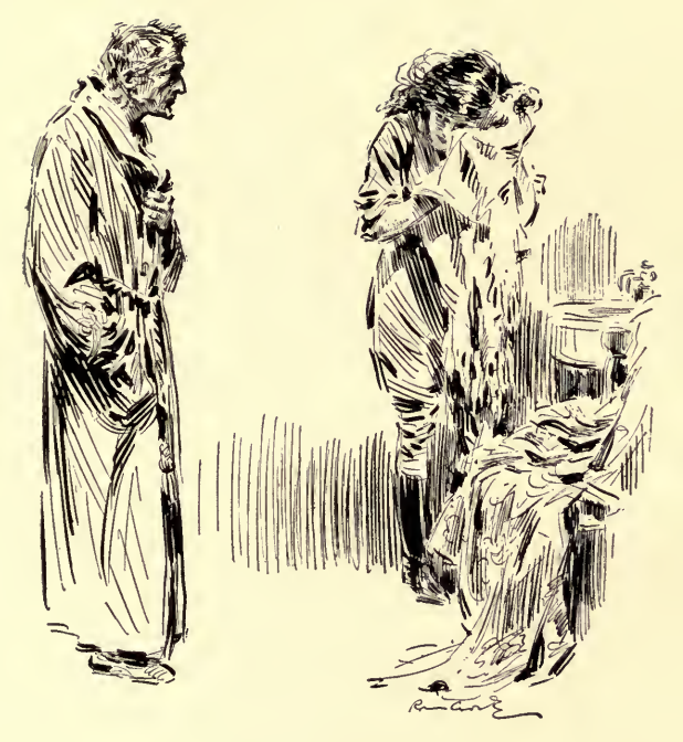
"Don't delay me!" she said, "I've got to make four hundred muffins!"