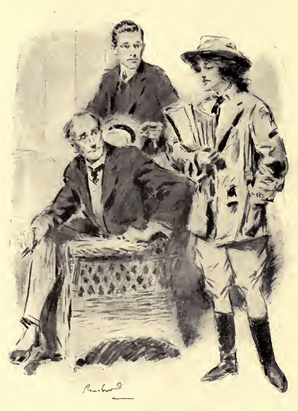
"I am riding," she murmured almost inaudibly