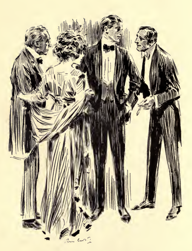
" Music! Flowers! Palms! Catering! Everything!"