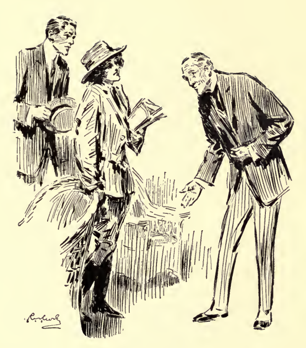
"I would therefore respectfully suggest as a special topic of conversation the consummate cheek of—yours truly, Paul Reymouth Edgarton"