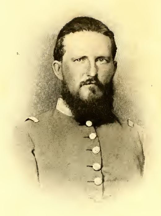
Ever yours 27 Pareton