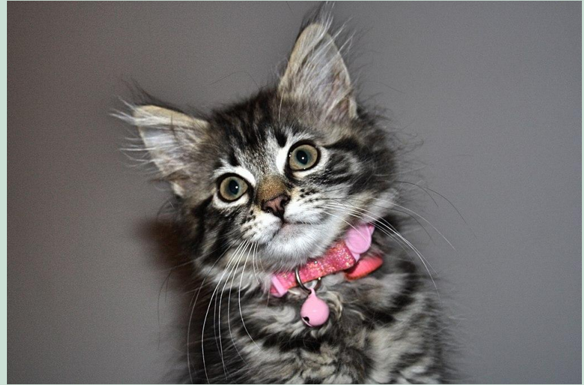
EmmaFoster5 , CC BY-SA 4.0