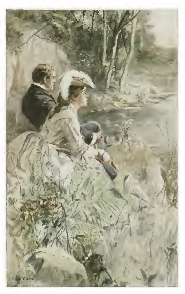
Indeed it was clear that to go away would be unfair.