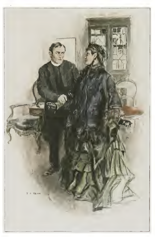
"I am waiting busily for her slayer."