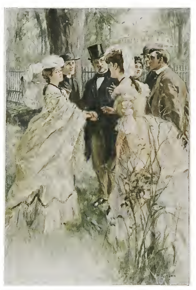
"Father," laughed the daughter, "isn't this rather youngish?"