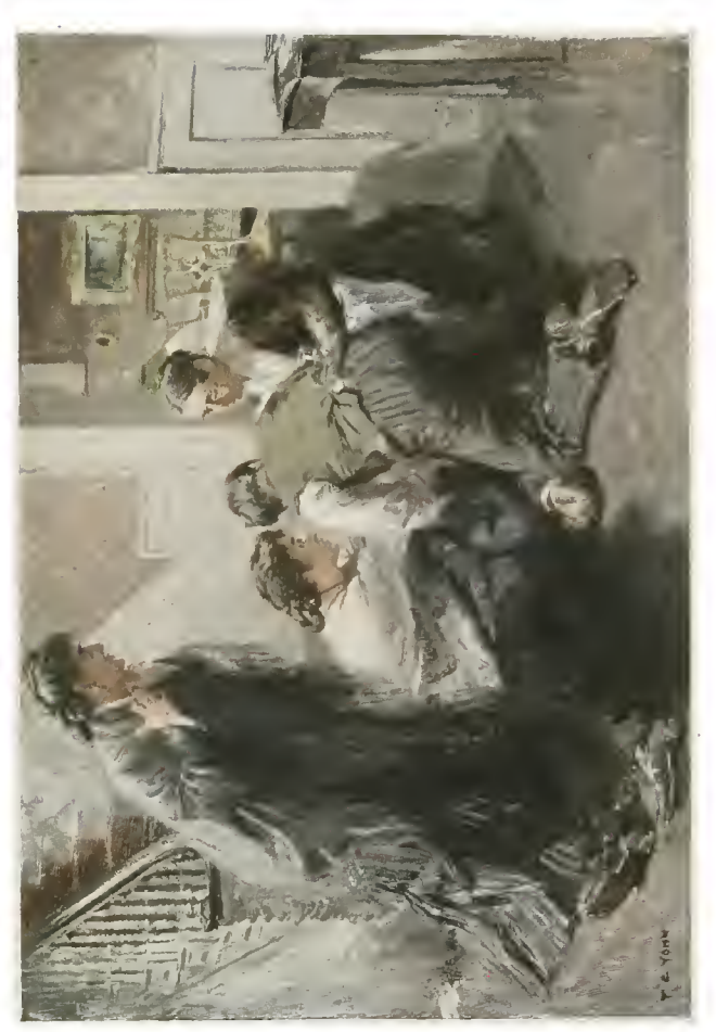
"Arthur! Arthur! can't you speak?"