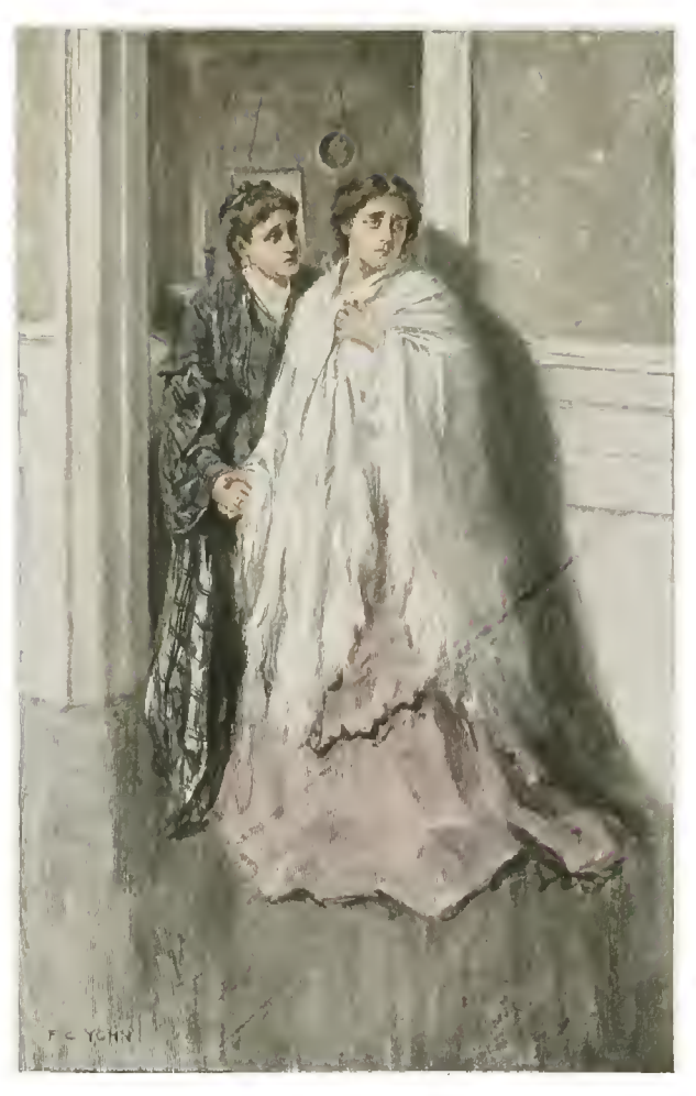
"But to know every day and hour that I'm watched."