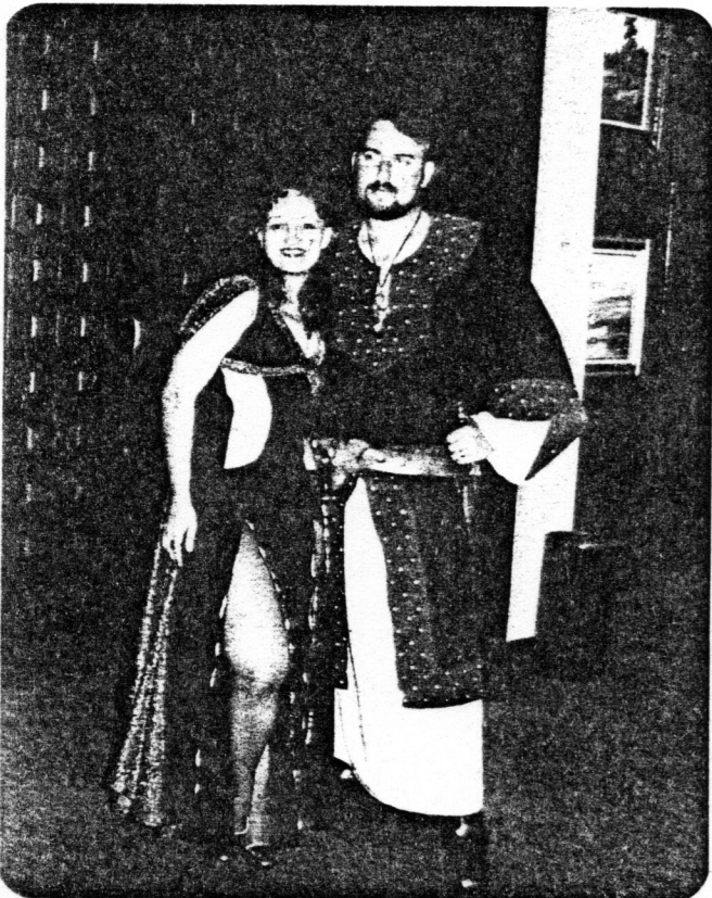
(S.F. WEEKEND AGAIN WITH FRIEND 1-24-79)