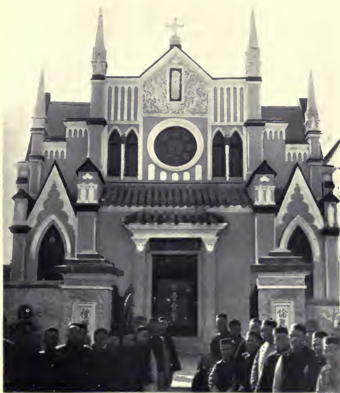
THE LONDON MISSIONARY SOCIETY'S CENTRAL CHAPEL, HANKOW.

In the foreground may be seen some of the Theological and Normal School students and native evangelists. The four schools meet in this chapel for worship every morning, and Sunday and Wednesday afternoons.