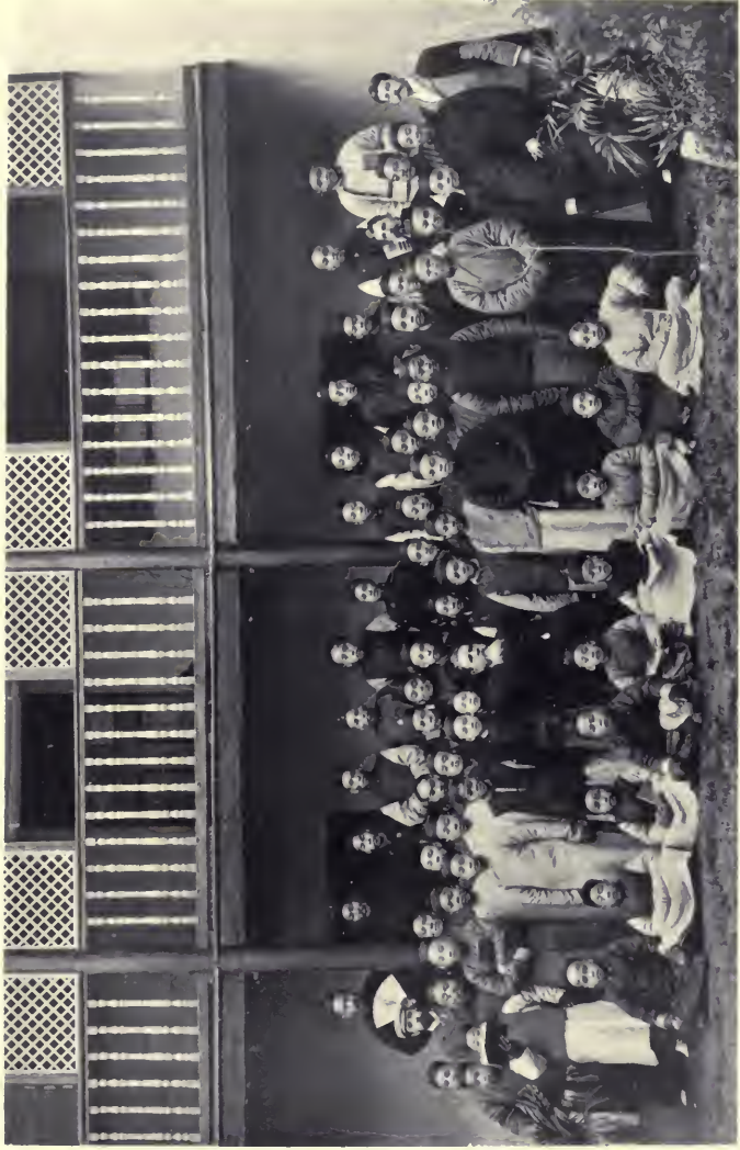
THE LONDON MISSIONARY SOCIETY'S HIGH SCHOOL, HANKOW.