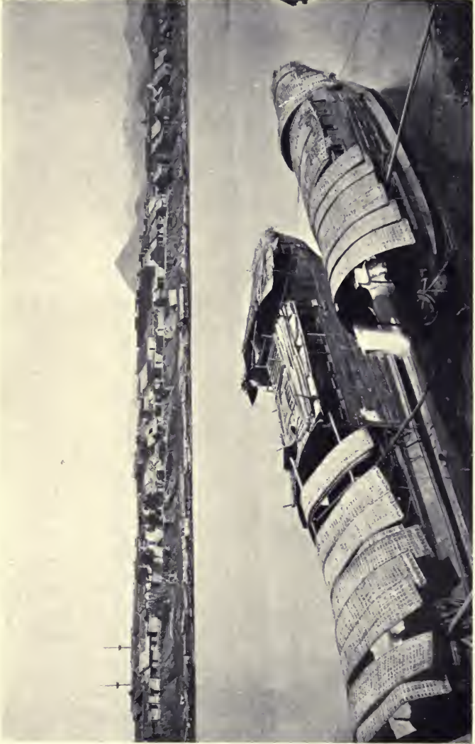
A RIVERSIDE TOWN AND TYPICAL BOATS.