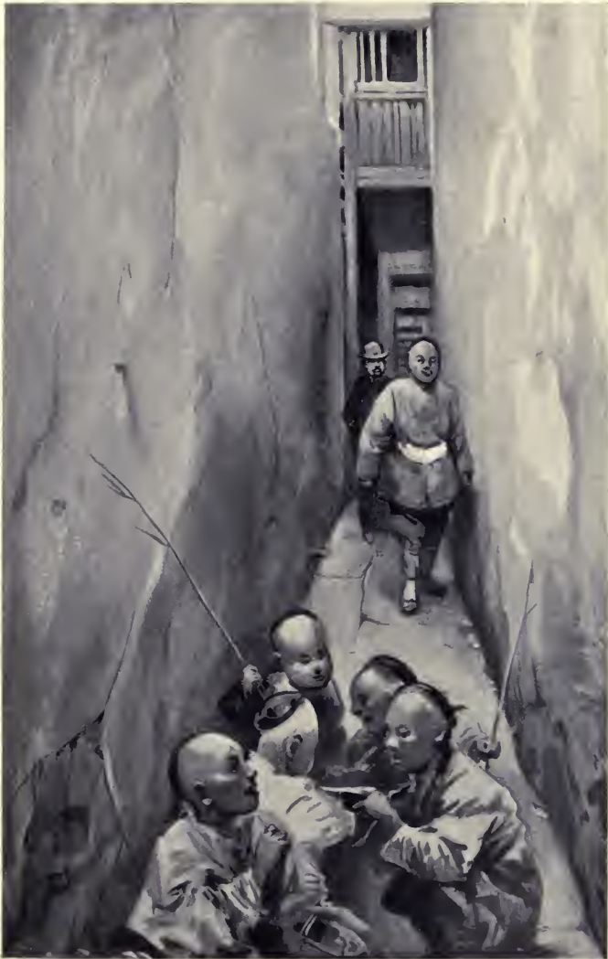
THE FIRST HOME IN HANKOW. (Drawn from a photograph.)