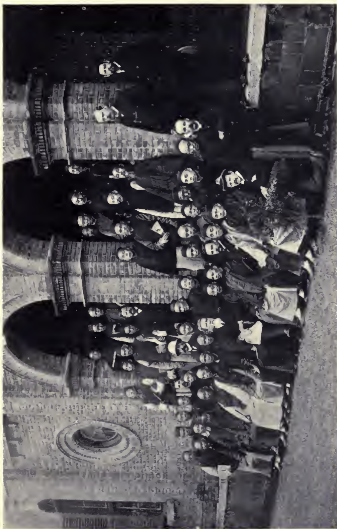
CONFERENCE OF EVANGELISTS OF THE LONDON MISSIONARY SOCIETY IN CENTRAL CHINA, MAY 1905.