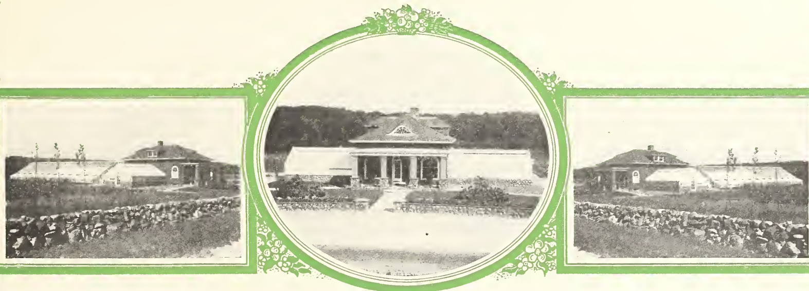
THREE VIEWS OF HAV-A-LOOK GARDENS

In view of the time and energy consumed in getting started we have until now, been unable to turn our attention to the issue of any catalog. We offer you in lieu of an elaborate catalog, this little