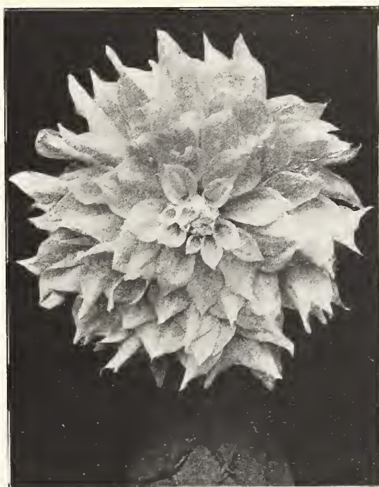
"Frances Cooper" of Hav-a-Look

Winner of a first prize 1924, Silver Medal and first in undecimated seedling class, and Gold Medal Sweep stakes for best Dahlia in the show at Boston, 1925. The colorings of this immense Hybrid Decorative are shades of orange apricot, with tones of carrot red on reverse of petals, with a cadmium yellow center which is high and full. A wonderful Exhibition variety that will average nine inches in diameter, has been grown eleven inches. This Dahlia is the most continuous and consistent bloomer I have ever grown. Even the laterals produce full sized flowers. The stem is stiff and strong enough