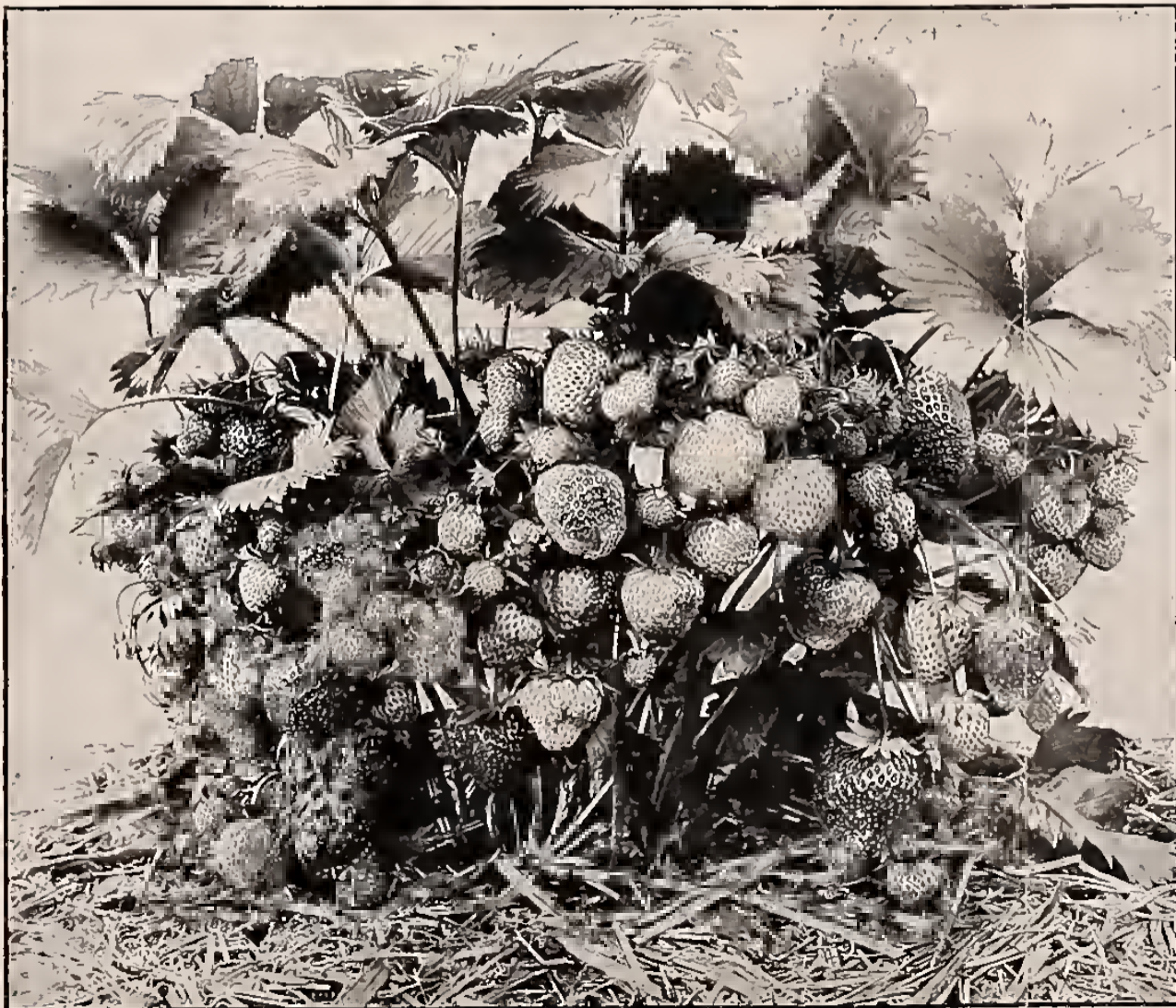
This photo-engraving tells the "Rockhill" story more forcibly than words. Most of the foliage has been clipped to show the large crop of mammoth berries. Imagine the original hills almost as large as a bushel basket and you will get an idea of the actual size of the berries.

"Rockhill" Has a Worth Heretofore Undeveloped