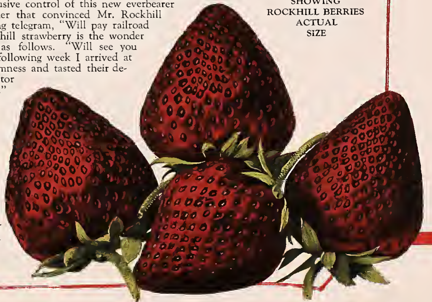
SHOWING ROCKHILL BERRIES ACTUAL SIZE