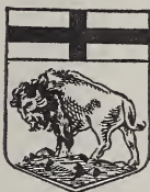
PROVINCE OF MANITOBA

With the Compliments of the Government of Manitoba from the Provincial Library