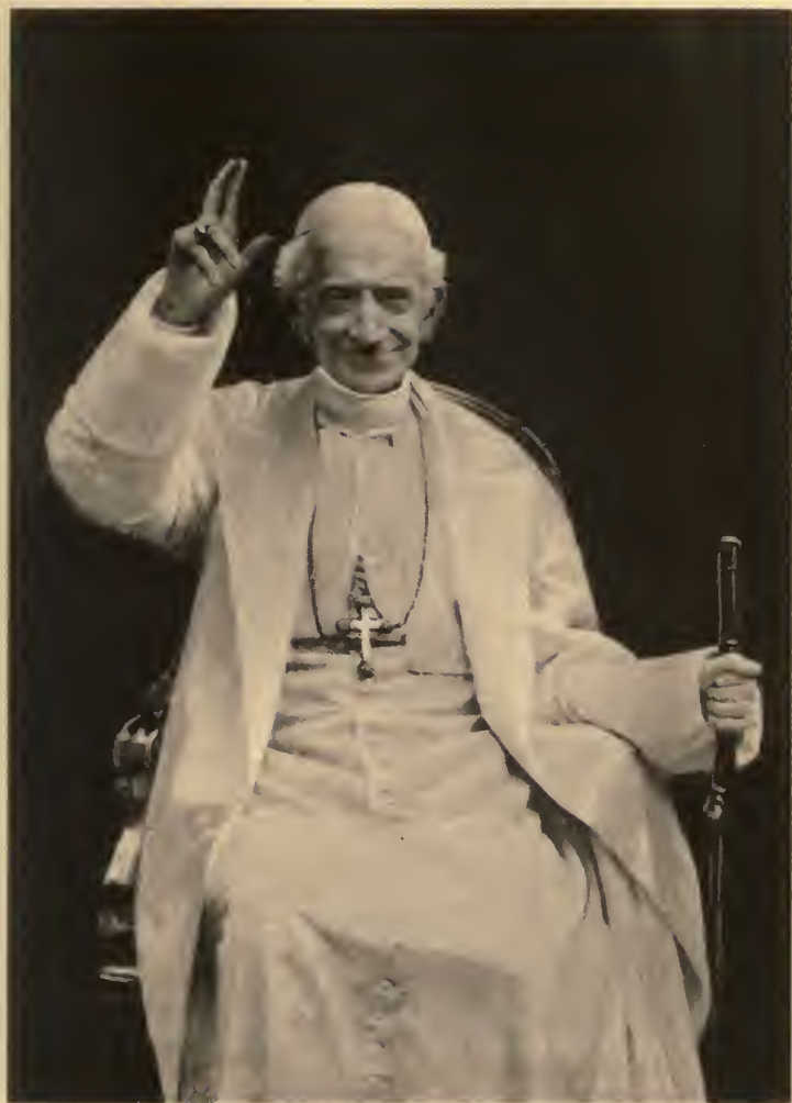
POPE LEO XIII.